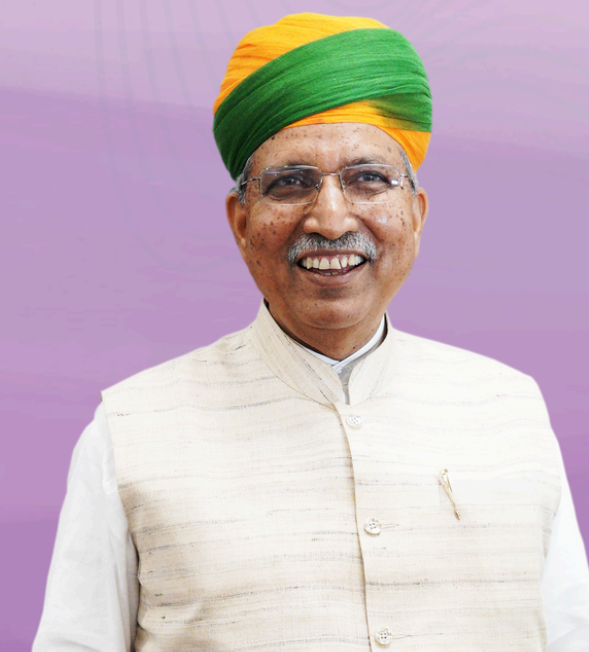
Shri Arjun Ram Meghwal Hon'ble Minister of State, Ministry of Law and Justice (Independent Charge)