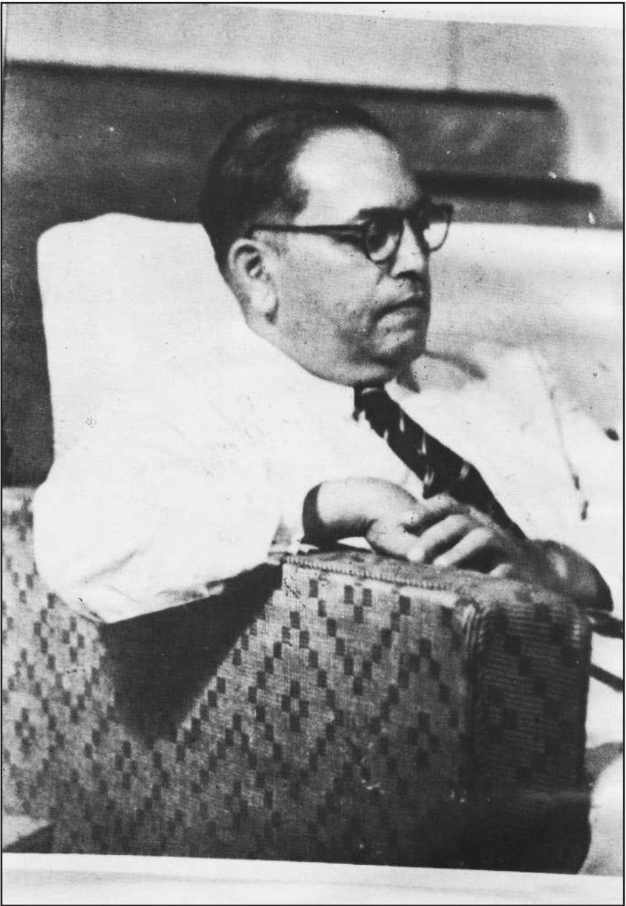
Babasaheb Dr. B.R. Ambedkar (14th April 1891 - 6th December 1956)