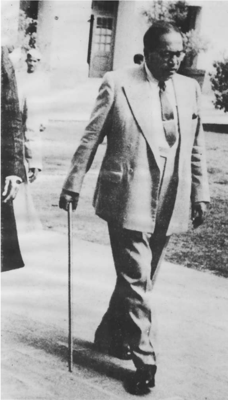
Dr. Ambedkar on the lawns of Parliament