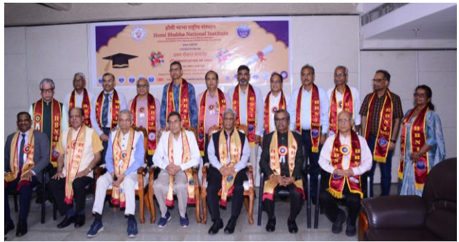
(a) Outstanding students' awardees, and (b) Academic authorities, with the dignitaries