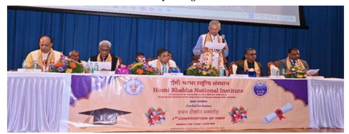
Dignitaries on the dais