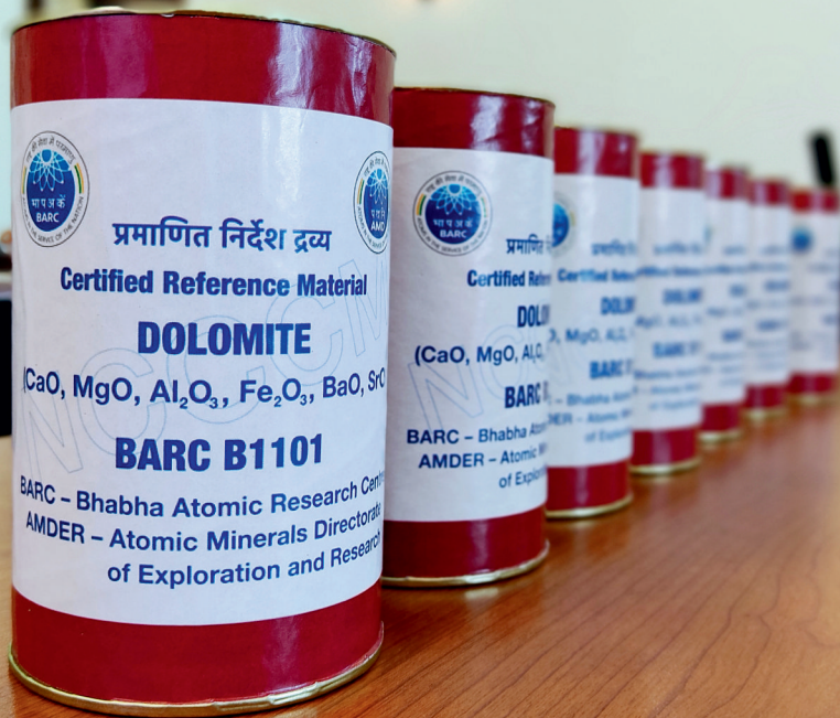
Product – Dolomite – (BARC B1101)