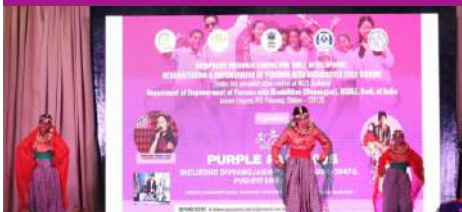
Group Dance by students under Parkha BAC