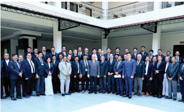
Glimpse from Refresher Training Programme conducted at Chhattisgarh State Judicial Academy

March 23, 2025: A One-Day Refresher Training Programme was organized for Legal Aid Defense Counsels at the Chhattisgarh State Judicial Academy. The training aimed to strengthen the legal knowledge, courtroom skills, and procedural understanding of Legal Aid Defense Counsels to ensure effective representation of beneficiaries with professionalism, empathy & a strong commitment to justice under the legal aid system. The programme included expert-led sessions, interactive discussions, and practical insights on recent developments in criminal law and defense strategies. Participants also had the opportunity to engage in case studies to apply the knowledge gained in real-world scenarios. This initiative forms an integral part of the ongoing and concerted efforts to enhance the quality and efficiency of legal aid services across the state.