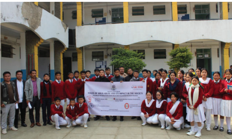
DLSA, Chandel (Manipur) at Jawahar Navodaya Vidyalaya (JNV)

January 31, 2025: DLSA, Chandel (Manipur), in collaboration with the Naga Students Union Chandel (NSUC), organized a painting competition at Jawahar Navodaya Vidyalaya (JNV), Chandel. The theme of the competition was “ Issues of Drug Abuse and Its Impact in Society ”, aiming to raise awareness about drug abuse and promote understanding of de-addiction schemes and policies in the state. A total of 100 students actively participated in the competition, which was thoughtfully divided into two categories: Classes 5th-8th and Classes 9th-12th ensuring age-appropriate engagement. The initiative offered an engaging and creative platform for young minds to express their perspectives, raise awareness, and reflect on this critical social issue through art, writing, thereby nurturing empathy among them.