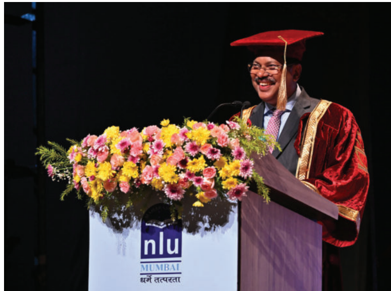
Glimpse from MNLU Convocation: MoU signed for a one-month internship programme with MNLU

With the approval of Hon'ble Mr. Justice B.R. Gavai, Judge, Supreme Court of India and Executive Chairman, NALSA, a significant boost was given to clinical legal education through the approval of proposals submitted by select universities. At MNLU Nagpur, an exclusive one-month internship at Legal Services Institutions was approved as a mandatory component of the B.A. LL.B. (Hons. in Adjudication and Justicing) five-year degree programme. At MNLU Mumbai, a four-week Internship Programme on Legal Research, Drafting, and Practical Exposure to Governance Mechanisms was approved for first and second-year law students, aimed at fostering a deeper understanding of the functioning of legal services authorities and judicial institutions. NLU Delhi has also been granted approval to involve students in various projects under NALSA and legal aid framework, offering them valuable experiential learning opportunities.