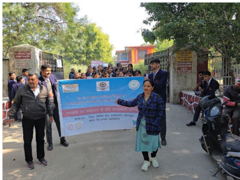
DLSA, Dehradun (Uttarakhand) at Shri Guru Ram Rai Public School, Bindal

January 30, 2025: DLSA, Dehradun (Uttarakhand), organized a legal awareness camp at Shri Guru Ram Rai Public School, Bindal, to educate students on important legal and social issues. The session covered the POCSO Act, Cybercrime, Social Media fraud, the ill effects of drug addiction, and introduced students to the NALSA toll-free legal aid helpline 15100. In addition to the awareness programme, a cleanliness rally was conducted by the students to mark National Cleanliness Day, promoting hygiene and social responsibility. The event witnessed enthusiastic participation and served as a meaningful initiative towards empowering youth through legal knowledge and civic awareness. Resource persons from the legal fraternity and police department engaged with the students, addressing their queries and encouraging proactive legal awareness. The session adopted a student-friendly approach, making complex legal topics more relatable for the young audience.