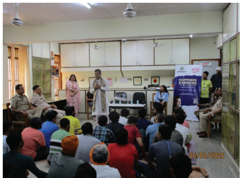
DLSA, North (New Delhi) at Central Jail No. 10, Rohini

March 25, 2025: DLSA, North (New Delhi) organized a mental health awareness session titled "From Isolation to Connection" at Central Jail No. 10, Rohini, for inmates, Para Legal Volunteers (PLVs), legal sewadars, and staff. The session emphasized the importance of mental well-being, offering coping strategies for stress, isolation, and anxiety, along with mindfulness techniques and information on available psychological support within the correctional system. Around 40 inmates actively participated, sharing their experiences in an open and supportive environment. The session aimed to destigmatize mental health issues and promote emotional resilience, ensuring inmates were aware of the mental health resources available to them. The session concluded with one-on-one counseling and guidance for the inmates on accessing ongoing mental health resources, empowering participants to take proactive steps toward improving their mental well-being.