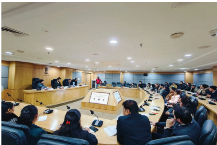
Glimpse from a Training Programme Organized by Delhi SLSA