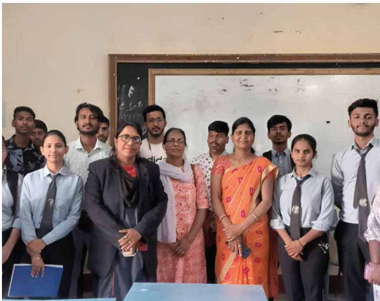
Glimpse from a Legal Awareness Programme conducted by DLSA, Jaipur (Rajasthan)

March 11, 2025: DLSA, Jaipur (Rajasthan), in collaboration with SSG Pareek College, Jaipur, organized an awareness campaign titled "Sensitization Programme on the Rights of Women, Scheduled Castes, Children, the Elderly, Persons with Disabilities, Poor Migrants, People Living with HIV/AIDS, and Transgender Persons." The primary objective of the campaign was to spread awareness about the rights and legal provisions available to these vulnerable groups and to promote inclusivity and legal empowerment through education. The session highlighted the importance of legal safeguards and support systems for marginalized communities. The event saw enthusiastic participation from 35 students, who actively engaged in meaningful discussions and gained valuable insights into the legal protections and resources available to these groups. The campaign aimed to cultivate a sense of social responsibility and encourage the students to become advocates for the rights and welfare of these vulnerable populations.