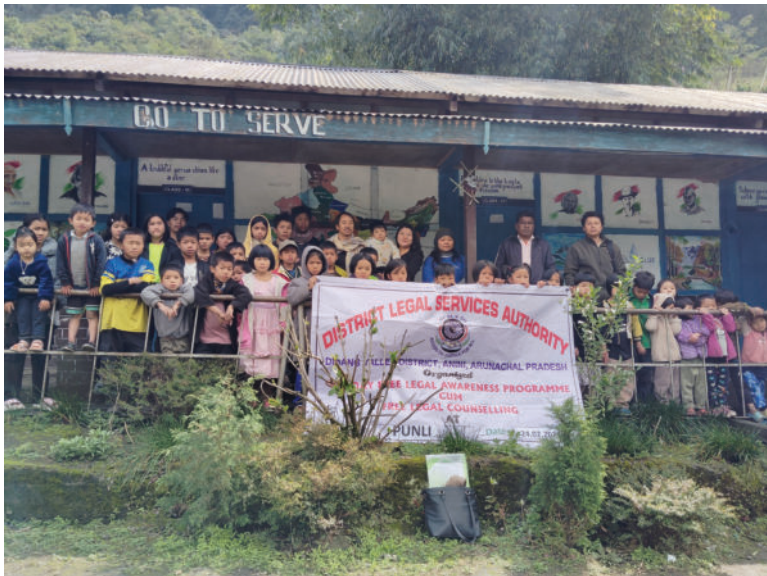
DLSA, Dibang Valley (Arunachal Pradesh) at Government Residential School, Punli

At Colleges & Schools : Empowering the Future Leaders through Knowledge