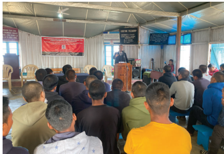
Glimpse from a Legal Awareness Programme at District Jail, Lunglei (Mizoram)

January 6, 2025: A legal awareness camp was organized by DLSA Nainital (Uttarakhand) at District Jail Nainital and Sub Jail Haldwani, where prisoners' concerns were addressed by the Hon'ble Chairman, DLSA. Inmates were informed about National Lok Adalat, compounding, remission, commutation, the e-Prison portal, e-true copy, and sensitization was done regarding various schemes and prisoner rights. It emphasized the importance of legal support and dignity for incarcerated individuals. The benefits of skill development were highlighted, with discussions focusing on how acquiring new skills can significantly contribute to the rehabilitation and reintegration of prisoners into society post-release. Jail PLVs were sensitized on the NALSA Prison Legal Aid Clinic SOP to ensure effective implementation of legal aid services inside prisons. A survey on caste-based discrimination in jail work allotment was also conducted.