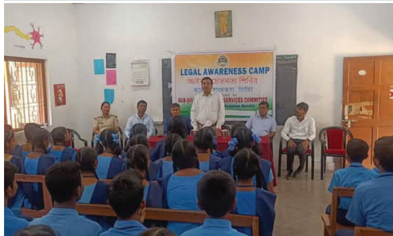
DLSA, Andaman & Nicobar Islands at VKV Zilla Parishad School, Basantipur

February 24, 2025: DLSA, Dibang Valley (Arunachal Pradesh), organized a one-day Free Legal Awareness Camp at the Government Residential School in Punli. The session aimed to enlighten students and staff about key legal safeguards for children, focusing on the Protection of Children from Sexual Offences (POCSO) Act, 2012, and the Prohibition of Child Marriage Act, 2006. The camp sought to enhance awareness and understanding of child protection laws, promoting legal literacy among young learners and empowering them with knowledge about their rights and protections under the law. It also encouraged open discussions about challenges faced by children in the community and highlighted the importance of reporting any form of abuse. The session was designed to ensure that the students and staff are equipped with the essential information and practical knowledge to protect themselves and those around them.