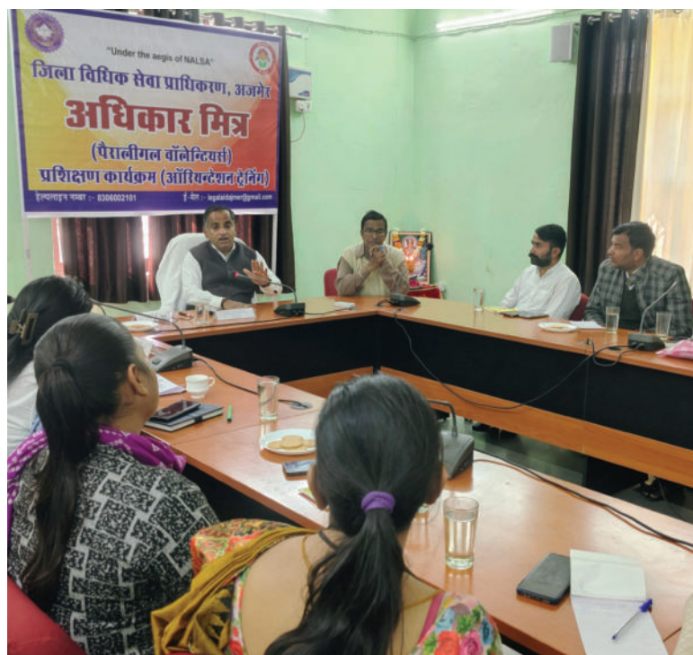
Glimpse from Orientation Training Organized by DLSA, Ajmer (Rajasthan)

March 6, 2025: DLSA, Ajmer (Rajasthan), organized a Training-cum-Sensitization Session titled “PLV Orientation Training.” The session aimed to enhance the knowledge and capacity of Para Legal Volunteers (PLVs) by providing in-depth insights into the Para Legal Volunteer Scheme, its objectives, and implementation framework. The training focused on equipping participants with the necessary legal awareness and practical skills to effectively serve their communities and assist in promoting access to justice. It emphasized the vital role PLVs play in supporting marginalized groups and facilitating legal aid. Through interactive discussions and case studies, the session aimed to prepare PLVs to address common legal issues and provide assistance in legal matters such as domestic violence, women’s rights, and access to government schemes. This initiative contributed to building a stronger, more knowledgeable network of volunteers dedicated to enhancing legal awareness and access to justice within the community. Participants also shared field experiences, allowing for collective learning and exchange of strategies to address grassroots legal challenges. The session reinforced the importance of empathy, vigilance, and accountability in PLVs’ day-to-day roles.