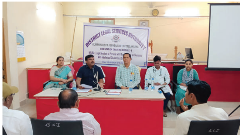
Glimpse from Capacity Building Programme Organized by DLSA, KB Asifabad (Telangana)

February 15 & 16, 2025: DLSA, KB Asifabad (Telangana), conducted an Orientation Training Programme for members of the Legal Services Unit for Persons with Mental Illness and Persons with Intellectual Disabilities under the NALSA (LSUM) Scheme, 2024. The training was held at the Senior Civil Judge Court Hall in Asifabad. The session was designed to provide the members with comprehensive knowledge and practical skills to effectively assist individuals with mental illnesses and intellectual disabilities in navigating and accessing legal services. The programme also focused on engaging participants in understanding the legal challenges faced by these individuals and provided insights into their rights and the legal provisions available for their protection and empowerment.