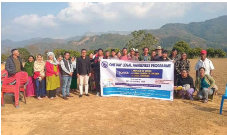
DLSA, Ukhrul (Manipur) at Champhung/Aphung Village

February 20, 2025: DLSA, Kra-Daadi (Arunachal Pradesh) District organized a legal awareness programme titled “ Legal Awareness Campaign ” at Nyokum Ground, Palin. The programme aimed to educate the public on various legal rights and welfare schemes, including key NALSA and State Schemes such as the Sexual Harassment of Women at Workplace (Prevention, Prohibition and Redressal) Act, 2013 (POSH Act), the Victim Compensation Scheme, 2024, the Protection of Children from Sexual Offences (POCSO) Act. A total of 48 individuals participated in the campaign, which served as an important initiative to spread legal awareness and ensure that citizens are informed of their rights and the legal remedies available to them. This initiative fostered a sense of confidence amongst the participants.