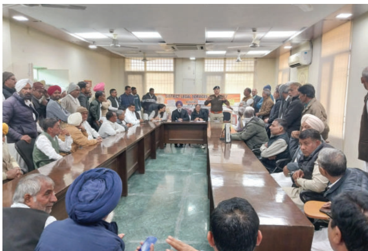
Glimpse from a Capacity Building Programme Organized by DLSA, Sirsa (Haryana)

January 17, 2025: DLSA, Sirsa (Haryana), conducted a meeting with Para-Legal Volunteers (PLVs) to review their work and discuss various NALSA Schemes. During the meeting, PLVs shared the challenges they face while organizing legal aid camps in remote areas in reaching marginalized communities. Panel Advocates, briefed the PLVs on two important NALSA Schemes: the NALSA (Effective Implementation of Poverty Alleviation Schemes) Scheme, 2015, which helps people access government poverty alleviation programmes, and the NALSA (Legal Services to Workers in the Unorganized Sector) Scheme, 2015, which focuses on providing legal support to workers in the unorganized sector. The session aimed to equip PLVs with the knowledge and tools to effectively implement these schemes in their respective areas. The meeting concluded with a renewed commitment to strengthen grassroots legal outreach.