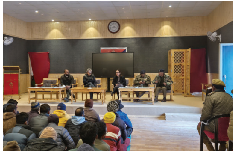
DLSA, Leh (Ladakh) at District Jail, Leh

March 27, 2025: DLSA, Leh (Ladakh) organized an awareness programme at the District Jail, Leh, focusing on the rights and entitlements of prisoners. As part of the initiative, the DLSA also conducted a screening to identify undertrial prisoners who were unrepresented, in order to extend free legal aid and ensure access to justice. This outreach programme aimed to create awareness among inmates about their legal rights while reinforcing the commitment of the DLSA to safeguard the rights of undertrial prisoners. Additionally, the programme highlighted the importance of legal representation in ensuring fair trial and preventing prolonged detention without proper legal recourse. The initiative emphasized the DLSA's role in promoting legal literacy and fostering a more inclusive justice.