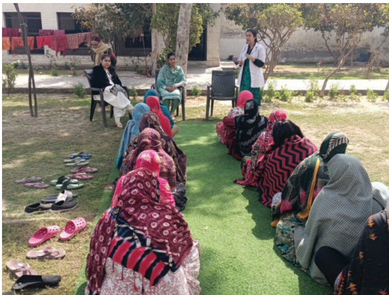
DLSA, Kaithal (Haryana) at District Jail, Kaithal

January 17, 2025: DLSA, Kaithal (Haryana), in collaboration with the Legal Aid Defence Counsel Office, organized five awareness programmes for female inmates of District Jail, Kaithal. The inmates were informed about their rights, including access to free legal aid, bail, parole, furlough, education, and the procedure for applying for legal assistance under the Legal Services Authorities Act, 1987. The sessions were specifically designed to empower the female inmates by providing them with crucial legal knowledge and practical insights, enabling them to better understand and navigate the complexities of the justice system. A total of 24 female inmates benefited from these sessions, gaining a clearer understanding of their rights and available resources. The initiative aimed to create an environment of legal literacy, ensuring that the inmates were aware of the legal support they could access for their rehabilitation, overall well-being and to assert their rights and seek justice.