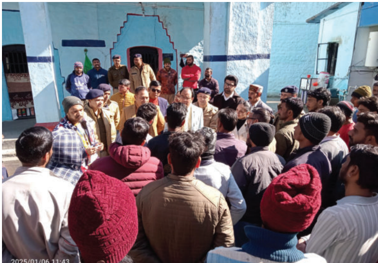
DLSA Nainital (Uttarakhand) at District Jail Nainital and Sub Jail Haldwani

February 13, 2025: A Special Campaign and Legal Awareness Programme was conducted at District Jail, Lunglei (Mizoram) in collaboration with the Healthy Lunglei Campaign. The initiative included a health screening drive to address the legal and medical needs of the inmates, ensuring their holistic well-being and access to justice. In addition to providing legal awareness on topics such as prisoner rights, legal aid, and available support schemes, the programme aimed to promote health and wellness among the inmates. The session offered a holistic approach to care, addressing both an individual's physical health concerns and legal entitlements, ensuring they are informed and empowered in seeking justice and support. This multifaceted and rehabilitative campaign underscored the critical and often overlooked link between legal empowerment and physical well-being within custodial settings.