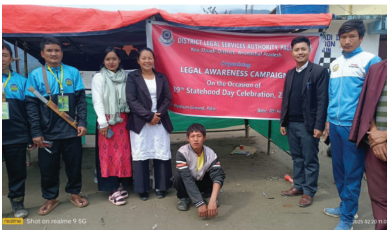
DLSA, Kra-Daadi (Arunachal Pradesh) at Nyokum Ground, Palin

January 28, 2025: DLSA, Ukhrul (Manipur), in collaboration with Tora Legal Aid Clinic, organized a Legal Awareness Programme at Champhung/Aphung village in Ukhrul District. The programme focused on three key topics: the menace of drug abuse, legal rights, and the availability of legal services. Advocates from Ukhrul District served as the Resource Person, delivering insightful guidance on these important issues. A total of 50 participants attended the session, which aimed to empower the local community with knowledge of their rights and available legal remedies while also addressing the growing concern of drug abuse. Resource persons engaged in interactive discussions with community members, encouraged them to speak openly about challenges faced within their locality.