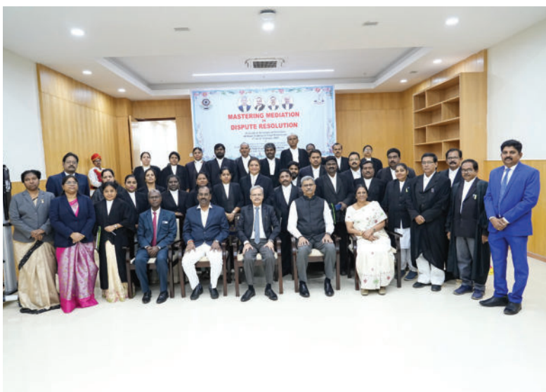
Glimpse from a Training Programme Organized by Andhra Pradesh SLSA

February 17, 2025: A 40-hour Mediation Training Programme was conducted at the premises of the Hon'ble High Court, organized by the Andhra Pradesh SLSA, Andhra Pradesh HCLSC, and the Mediation and Conciliation Project Committee (MCPC). The programme was inaugurated by Hon'ble Mr. Justice Ravi Nath Tilhari, who emphasized the importance of mediation in resolving disputes efficiently and reducing court caseloads. The Master Trainer provided participants with hands-on training in mediation techniques. The training aimed to enhance participants' mediation skills, enabling them to resolve disputes amicably and contribute to a more efficient justice system. The programme received an enthusiastic response from participants, reflecting a growing recognition of mediation as a vital tool in access to justice. Such initiatives are instrumental in building a cadre of trained mediators to support alternative dispute resolution mechanisms across the country.