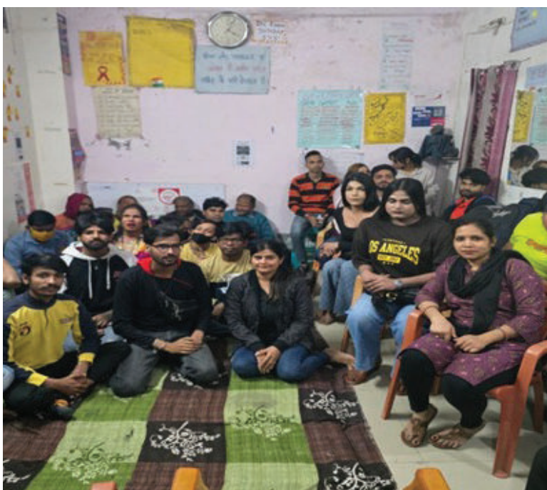
Glimpse from a Legal Awareness Programme conducted by DLSA, South-East (New Delhi)

March 5, 2025: DLSA, South-East (New Delhi), in collaboration with Bal Vikas Dhara NGO, organized an awareness session for transgender individuals and sex workers on the topic “ Legal Rights of Sex Workers & Fundamental Rights. ” The session witnessed the participation of approximately 40 individuals. The initiative aimed to raise awareness about the legal provisions and protections available to sex workers and transgender persons, including their fundamental rights and access to justice. The Participants were also informed about available support systems such as the NALSA Helpline (15100) and DSLSA Helpline (1516), both of which are operational 24x7. The session not only fostered open dialogue but also addressed individual concerns, and emphasized the importance of dignity, equality, and legal empowerment for marginalized communities. Through an interactive format, the initiative created a safe and inclusive space for participants to share their experiences and better understand their legal rights. It also reinforced the commitment of legal services institutions to extend meaningful support to those who are often on the fringes of the justice system.