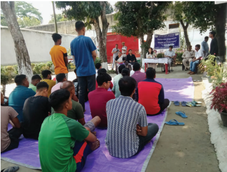
DLSA, Majuli (Assam) at District Jail, Majuli

March 26, 2025: DLSA, Majuli (Assam) organized an awareness programme at the District Jail, Majuli, focusing on key aspects of the Premature Release, Parole, and Furlough of Prisoners, along with the broader Rights of Prisoners. The programme was focused on generating consciousness amongst the inmates and prison authorities about legal safeguards and mechanisms available under the law to ensure humane and just treatment of incarcerated individuals. It provided valuable information on the procedures for applying for premature release, parole, and furlough, helping inmates understand their rights and avenues for seeking temporary release. The initiative also emphasized the importance of ensuring fair treatment for prisoners, promoting rehabilitation, and encouraging better access to legal remedies. By addressing these critical issues, the programme aimed to significantly enhance legal awareness among inmates and reinforce the principles of justice and human dignity within the prison system.