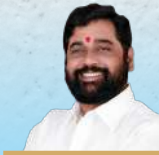
Shri Eknath Shinde Hon'ble Deputy Chief Minister Government of Maharashtra