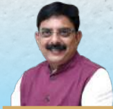
Shri Sanjay Savkare Hon'ble Textile Minister Government of Maharashtra