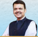
Shri Devendra Fadnavis Hon'ble Chief Minister Government of Maharashtra