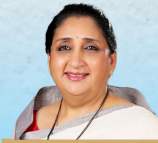
Smt. Sunetra Ajit Pawar Hon'ble Deputy Chief Minister Government of Maharashtra