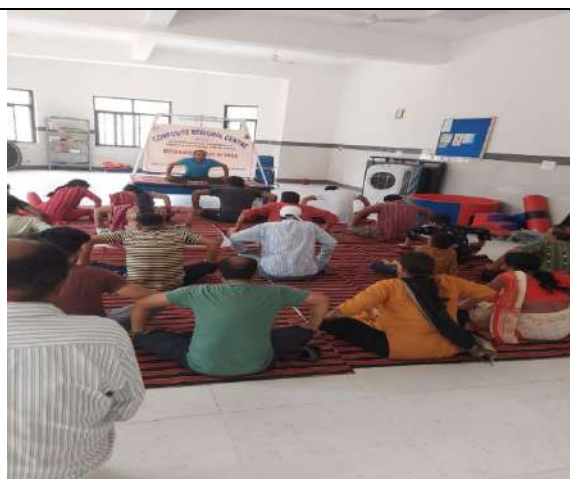
The Yoga teacher demonstrated different Asanas to the participants