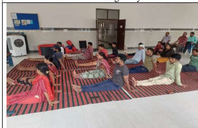
Yoga Asanas practised by the participants