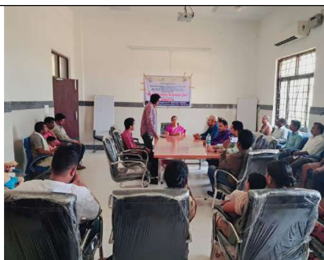
An orientation on Multiple Sclerosis by Professionals of CRC Balangir

The CRC, Balangir observed “Multiple Sclerosis Day” on 30 th May 2023. The theme of the day was “connections, means connection with the community/by yourself and with the people who provides quality care”. Here the professionals imparted the knowledge regarding “Multiple Sclerosis”, the symptoms, Age group particular, and its general remedies. There is no cure found for such chronic disorder. There is a question answer session between the beneficiaries and the professionals. We were able to satisfy the participant and make the event successful. There are 30 participants present in the event.