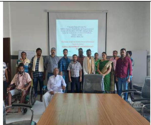
An orientation on accessibility day by Professionals of CRC Balangir