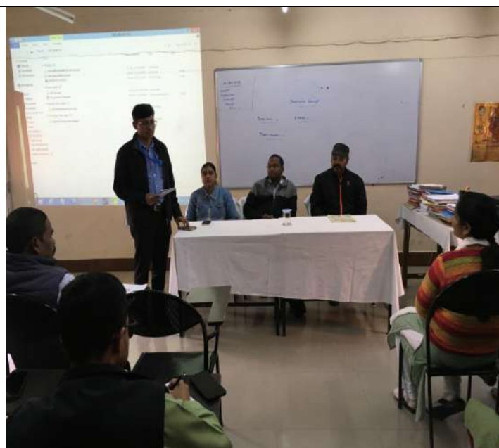
Introductory speech by Principal PM Shri Kendriya Vidyalaya-II

The Asst. Professor Special Education and the Asst. Professor (Speech & Hearing) was invited by Kendriya Vidyalaya to take session on inclusive education to the teachers of the school. The Principal was very cooperative and even enthusiast to conduct such kind of programme in near future. He was very pleased with the Professional of CRC Balangir because such interactive session on dated 19.11.2023.