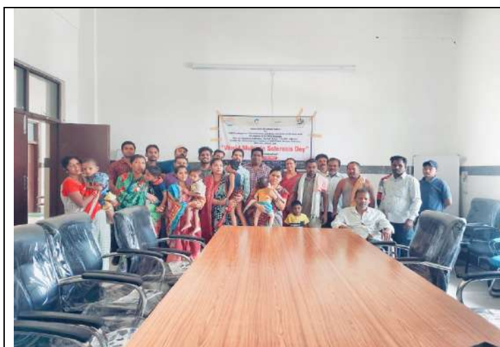
Group photo with the beneficiaries at CRC Balangir