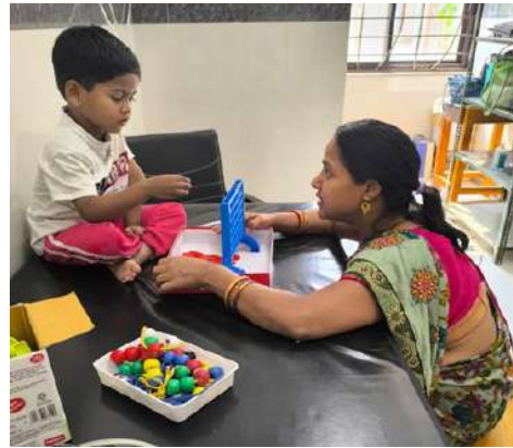
Sensory Motor Activity

The department of special education is dedicated to provide educational intervention to children with special needs and Children with delayed Development. Its primary focus is on providing individualized support, specialized instruction and accommodation to help Children with disabilities succeed academically, socially & emotionally. Here the professionals work collaboratively with students, parents & families to ensure that each child receives the appropriate services and resources tailored to their specific needs. It also provides counseling to the parents' to deal with their wide variety of emotional and psychological problems. The department plays crucial role in prompting inclusivity, equity and accessibility in education.