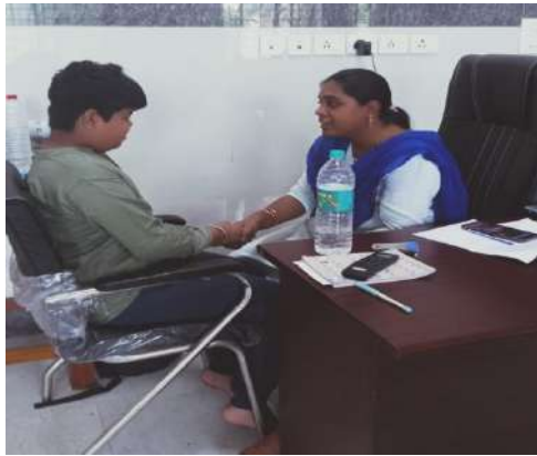
Eye Contact Training