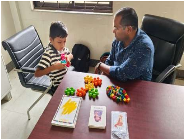
Increasing attention & concentration span activity