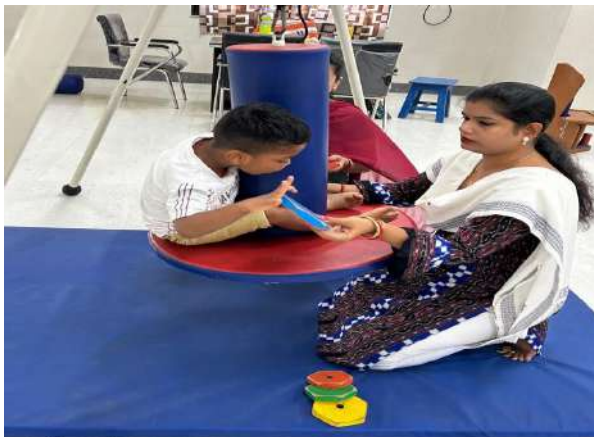
(I) Vestibular input to improve balance in CP

The major objectives of Occupational therapy are to provide a comprehensive program within a rehabilitation setting that utilizes a team approach to maximize an individual's independent functioning and participation in daily life activities and to develop, restore, or improve required skills, habits, and roles for independent, meaningful, and productive living. The assessment and treatment of performance components includes neuromuscular, sensory integration, cognitive, psychosocial skills, hand therapy for neuro-musculoskeletal conditions, ADL training for neuro motor conditions, Splints & assistive devices.