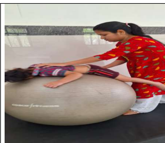
(II) Ball therapy in cp