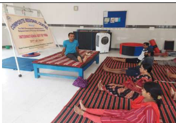
The Yoga teacher demonstrated different Asanas to the participants

The CRC SERE, Balangir observed International Yoga Day on 21.06.2023 in its campus. As we all aware of the fact that for healthy living Yoga is very much essential in recent time. It is an ancient practice & discipline and it is related to achieving physical, mental & spiritual health. Hence it includes various postures (Yoga Asana), Chants, Mantras and meditation. The auspicious day was started with different Yoga asana taught by Yoga instructor at 7 am and continues till 9 am. The event was successful one with the cooperation of staff members and beneficiaries. There are as many as 30 beneficiaries participated in the event.