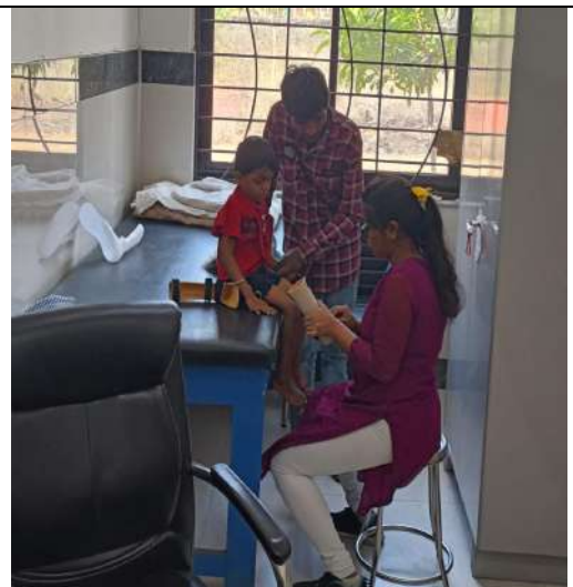
Fitment of Orthosis

The unit has a well-equipped workshop with necessary tools, equipment and machineries including a leather work section for fabrication of aids and appliances for rehabilitation of Persons with Disabilities. The unit of Prosthetics and Orthotics designs, fabricates and fits latest and lightweight Prosthetic and Orthotic appliances to the Persons with Physical Disabilities (Divyangjan). The type of aids and appliances that are provided to persons with disabilities are free of cost under the Scheme of Assistance to Disabled Persons (ADIP Scheme) or payment basis for those who do not come under the ADIP Scheme.