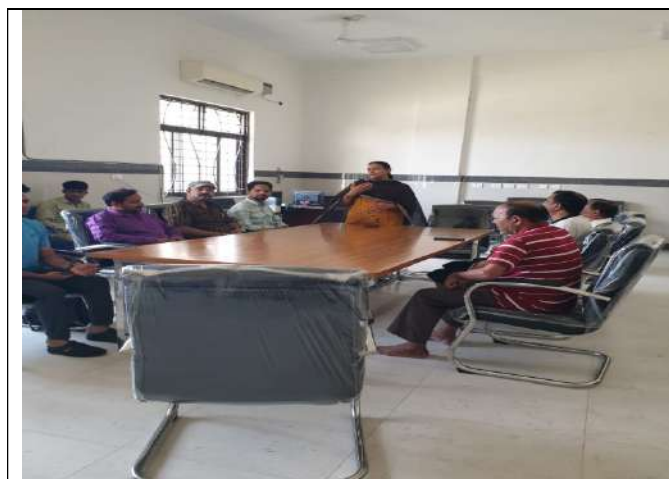
Introduction speech by the Officer-In-charge, CRC Balangir on the occasion of International Yoga Day