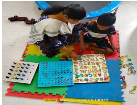
(II) Activity to improve sitting Tolerance, color concept, and Communication in Autism spectrum