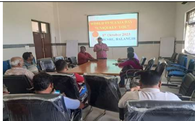
Group photo with beneficiaries