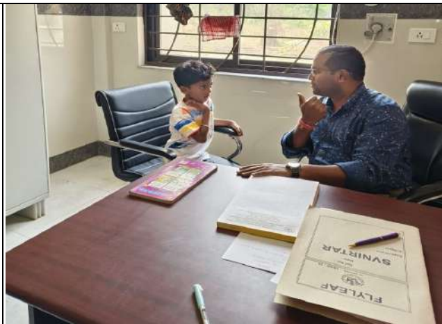
Nasal voice & Oral voice differentiation activity