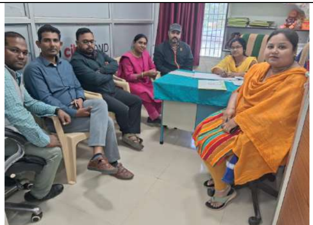
A visit to DEIC, DHH, Balangir with all the newly joined staff and meet Senior Audiologist, Special educator, Counsellor, Social worker & MOIC and promotion of CRC's services and KIRAN MHRH done

CRC's Social Work and Placement unit functions with the objective to support persons with disabilities to lead their life independently. The service includes facilitation to access Govt. Schemes