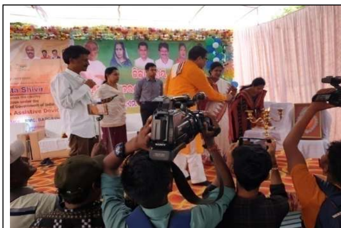
Lamp lighting the District Magistrate and Collector of Bargarh