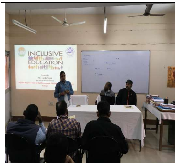
Asst. Professor, Special education took the session on Inclusive education