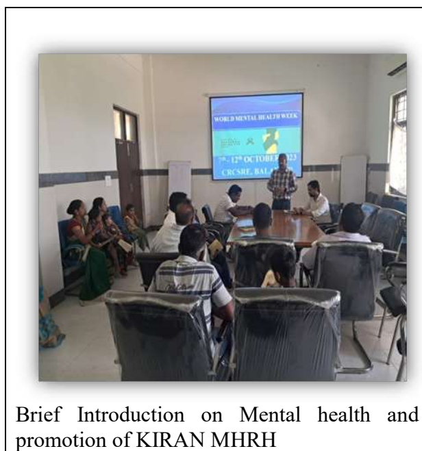
Brief Introduction on Mental health and promotion of KIRAN MHRH

World Mental Health Day 2024, on October 10th, is an opportunity for the world and communities to unite behind the theme 'Mental health is a universal human right'. It is not just a day of awareness; it's a collective step towards a healthier, more understanding world. The Mental Health day was observed at CRC Balangir on dated 07.10.2023. There are 4 types of Mental disorders i.e. mood disorders (such as depression or bipolar disorder) anxiety disorders. personality disorders. psychotic disorders (such as schizophrenia). The main objective of the observation of