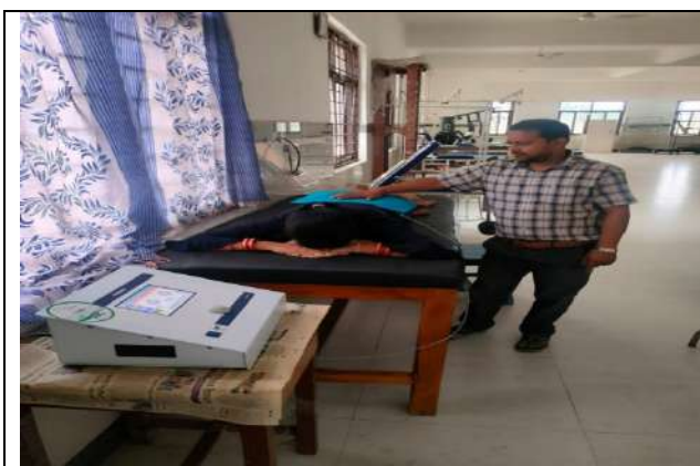
(I) Magnetic therapy

Physiotherapy is a health care profession concerned with human function, movement and maximizing physical potential. It includes Musculoskeletal Disorders, Muscular Disorders, Pediatric Disorders, Post-operative & Post-traumatic Condition with persons with disabilities i.e. Neurological Disorders, Post-operative stiffness & contractures, Back Pain, Spinal Cord Injuries, Stroke, Dystrophy etc. Physiotherapy is a modern science which includes examinations, assessments, interpretation, diagnosis, planning and intervention at the level of impairment, functional limitation and disabilities. Physiotherapy services are provided to the persons with disabilities and with the help of exercise therapy, heat therapy, cold therapy, electrotherapy, manual therapy etc. Physiotherapy unit has been well equipped with state-of-art machines like Ultrasound, Interferential Therapy (IFT) Machine, CPM (Knee and Elbow), Traction (Neck and Back) Beds, Transcutaneous Electrical Nerve Stimulation (TENS), Short Wave Diathermy (SWD), Wax Bath, Treadmill etc. During this year, a total of 11,111 beneficiaries were got benefitted from Physiotherapy Services at this Centre.