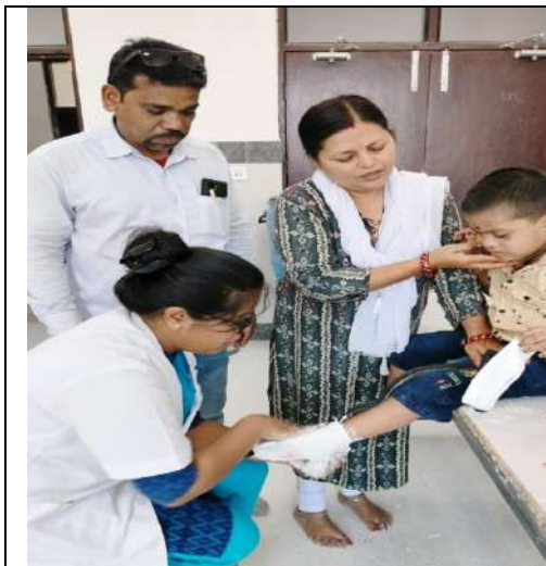
Measurement procedure for Orthosis