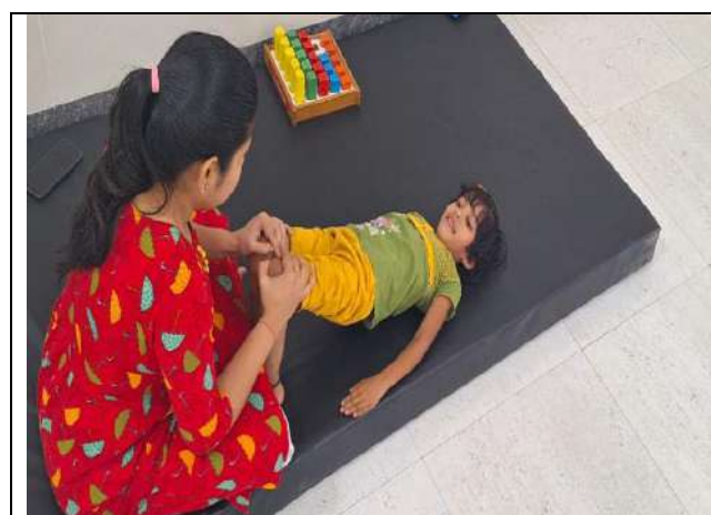
(I) Pelvic bridging exercise for pelvic floor and hip extensor strengthening