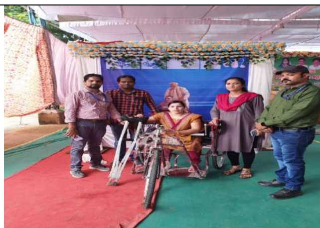
The beneficiary with aids & appliances

A mega distribution Camp was held on 24 th September, 2023 at Bargarh district. There are as many as 1002 beneficiaries who were pre-identified by ALIMCO. The CRC Balangir provided the hand holding support in terms of logistics, document compilation and guest invitation in coordination with District administration Bargarh.