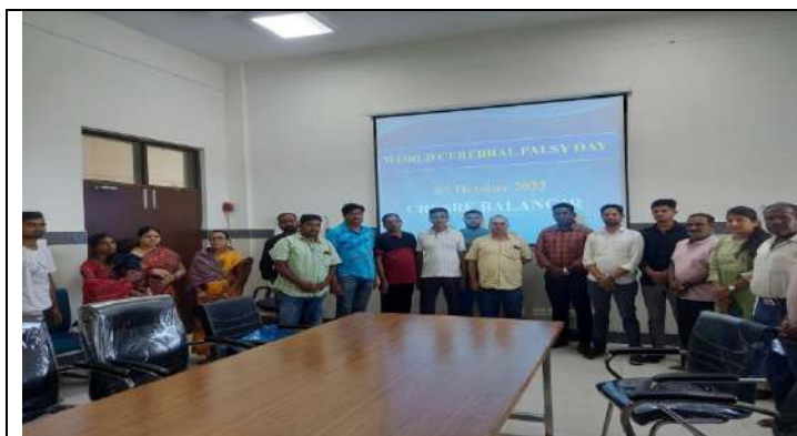
Group photo with beneficiaries