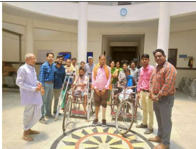
Distribution of aids & appliances to 6 nos of beneficiaries

(i) Global Accessibility Awareness Day: The CRCSERE, Balangir observed Global Accessibility Awareness Day on dated 18.05.2023 consisting of the professional and the beneficiaries. Here the professional aware the persons with disabilities about the accessibilities and how to access such benefits. Apart from awareness the CRC also distributed few aids and appliances (06) to the needy PwDs. The event was successful with the cooperation of staff members and beneficiaries. There are as many as 20 beneficiaries participated in the event.