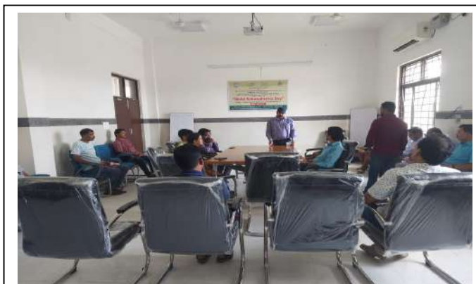
A brief orientation on Schizophrenia to the beneficiaries by the Professionals of CRC Balangir

The “World Schizophrenia Day” was observed on 24 th May every year. The theme is celebrating the power of community kindness. It is such a disorder which can be treated with proper care and the support of family/community at a large. The professionals spoke on the common tendency and behavior in this disorder as well as the treatment related to it. Apart from this the Rehab Officer connects the Schizophrenia with Kiran MHRH and its 24*7 services to the beneficiaries. There are 30 participant attended in the said event.