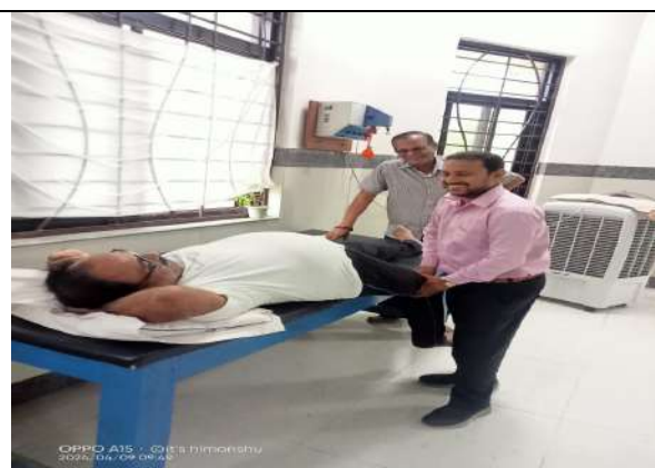
(II) Assessment of Hip flexor tightness