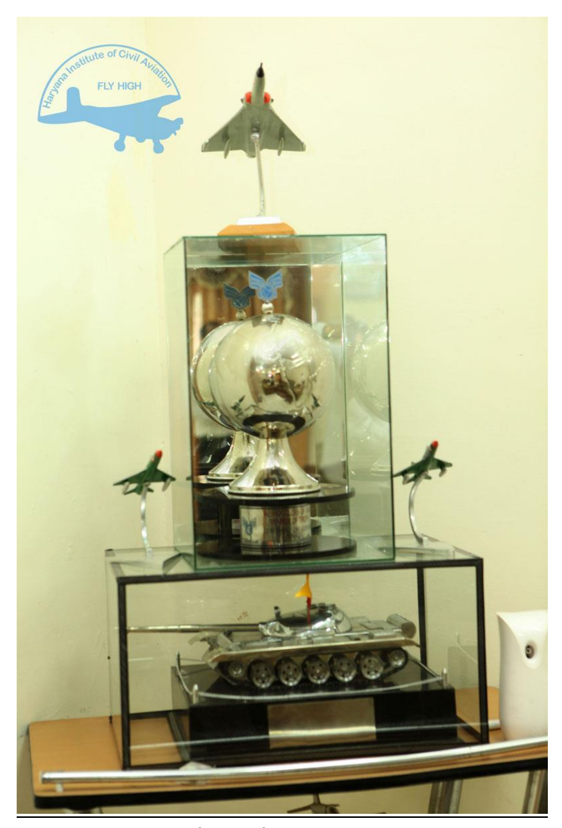
2nd Best Flying Institute -Awarded by AERO CLUB of INDIA