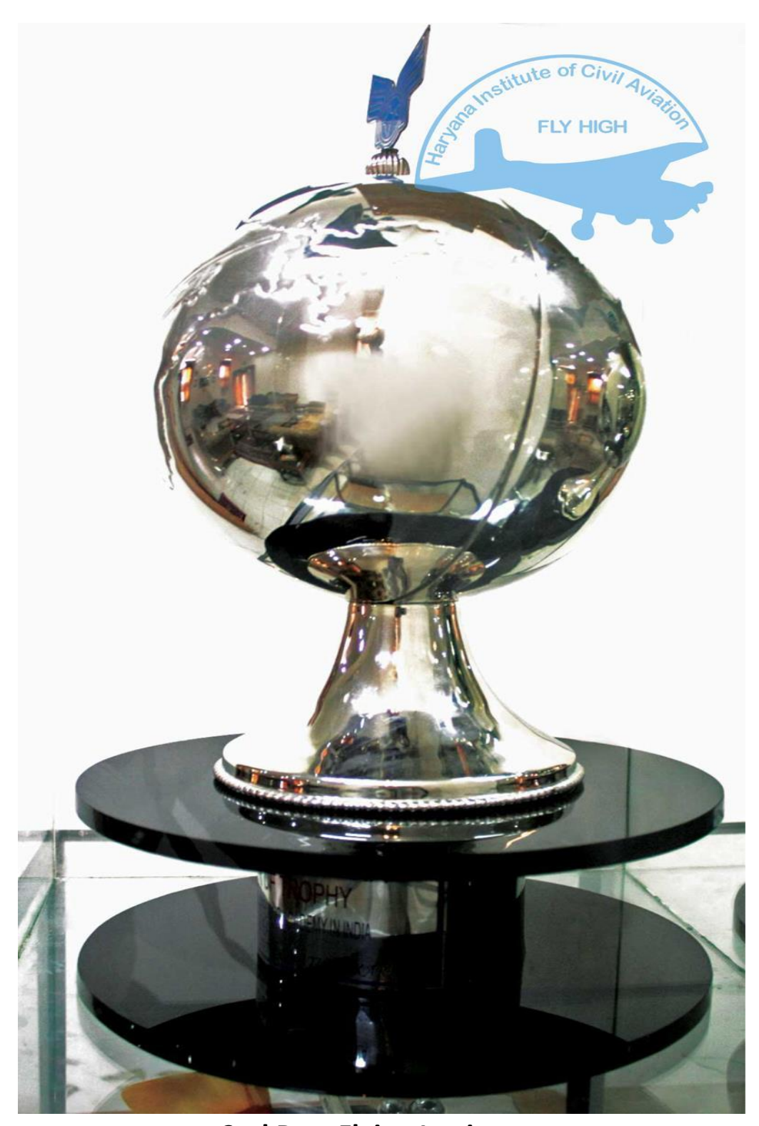
2nd Best Flying Institute -Awarded by AERO CLUB of INDIA