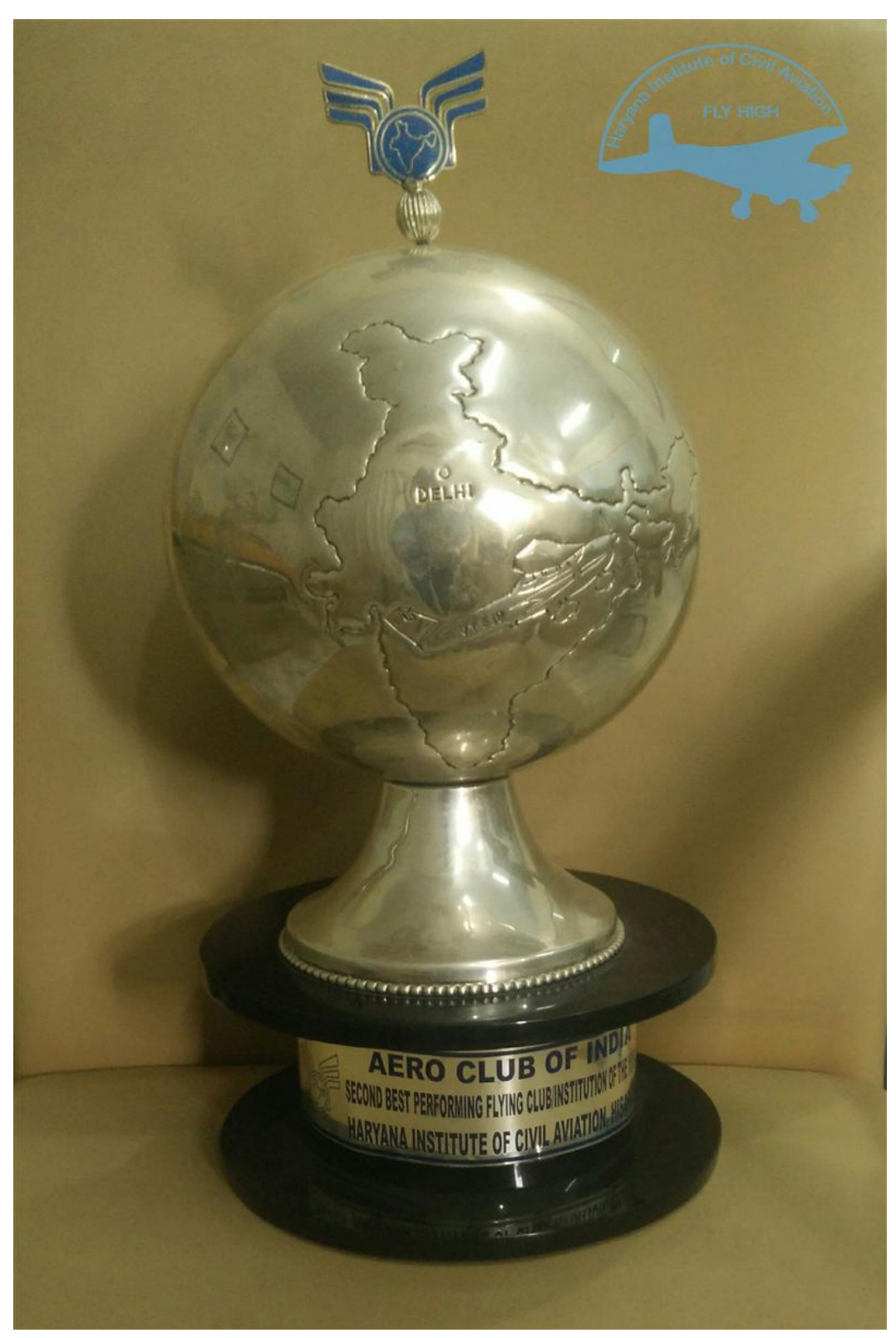
2nd Best Flying Institute -Awarded by AERO CLUB of INDIA