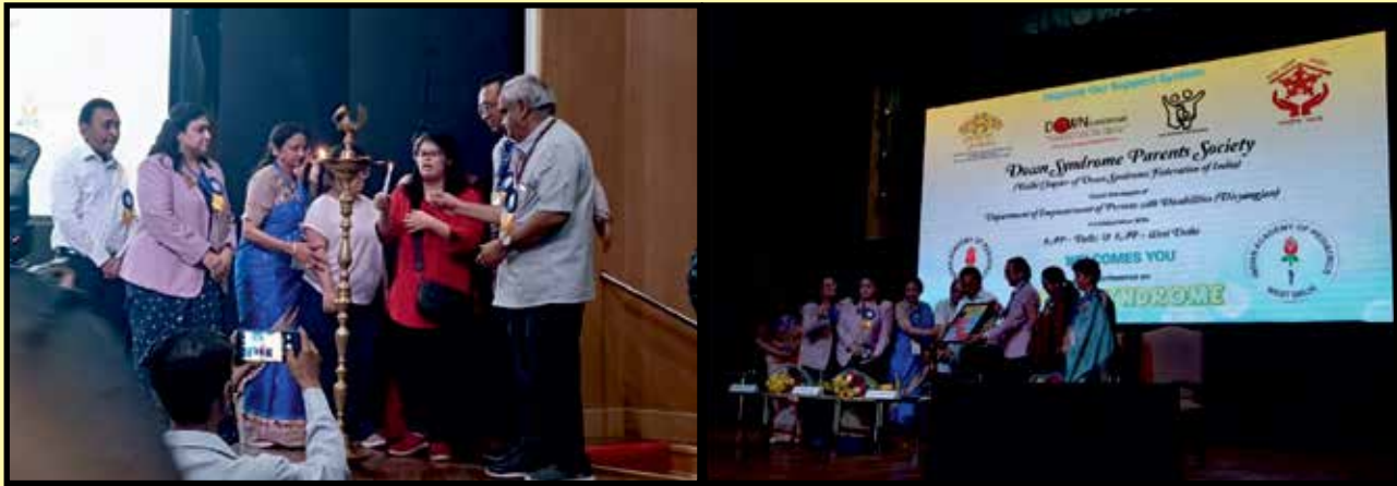
Lighting of lamp and facilitation of dignitaries during the World Down Syndrome Day programme