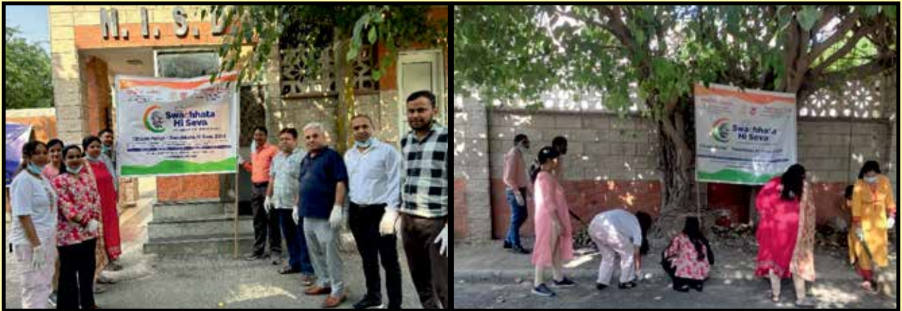
Cleanliness drive conducted by National Trust officials