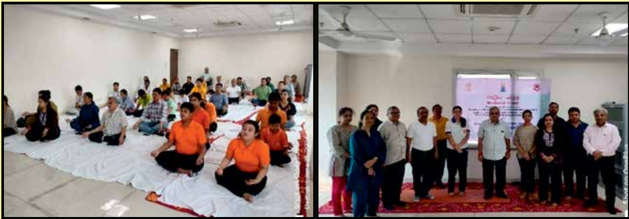
Observed International Yoga Day at National Trust premise

(iii) International Yoga Day-2024 was observed in the National Trust on 21.06.2024. Divyangjan from Registered Organization Delhi and officials of National Trust participated in the yoga session.