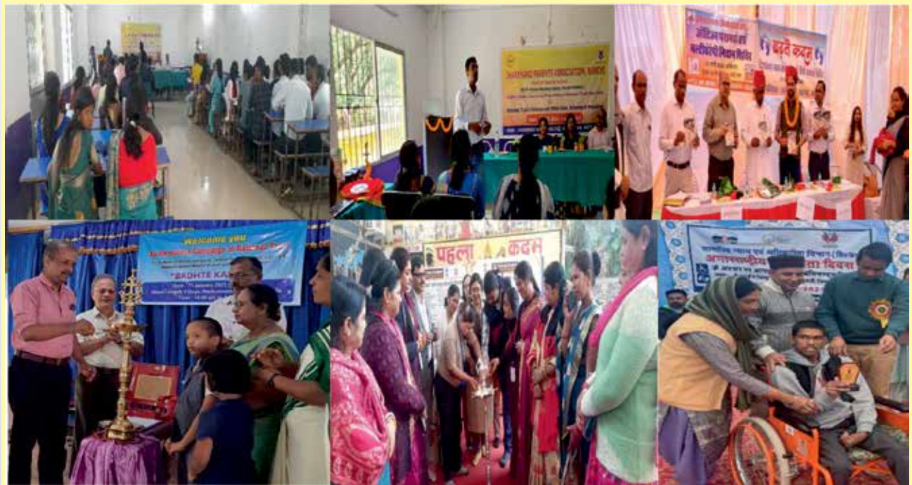
Glimpses of Badhte Kadam Awareness Programmes conducted at various places of the country