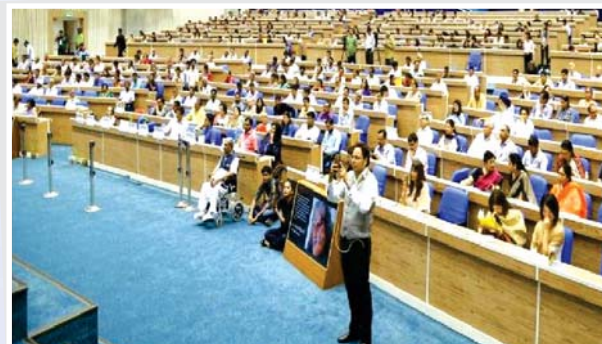
Dignitaries in the Inclusive India Summit