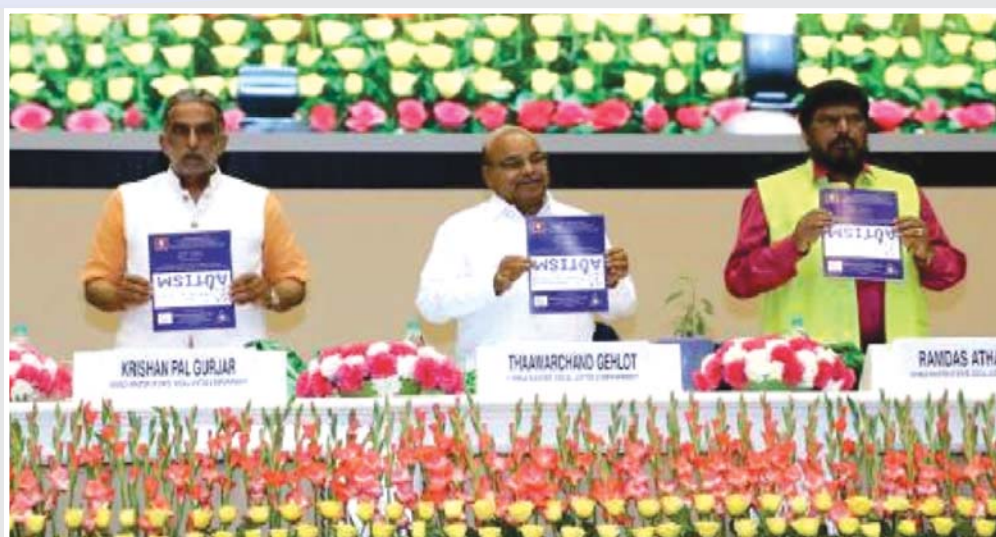
Release of booklets on Autism by Shri Thaawarchand Gehlot, Hon'ble Minister, Social Justice & Empowerment in presence of Shri Ramdas Athawale and Shri Krishan Pal Gurjar, Minister of State, Social Justice & Empowerment on 3-4-2017

To commemorate the event, the National Trust organized a National Conference on Autism at Plenary Hall, Vigyan Bhawan, New Delhi on 3.04.2017. The conference was inaugurated by Shri Thaawarchand Gehlot, Hon'ble Minister, Social Justice & Empowerment in presence of Shri Ramdas