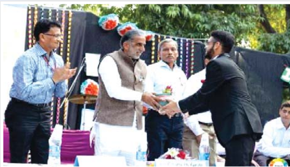
Shri Krishan Pal Gurjar, Hon'ble MOS, SJ&E in the event