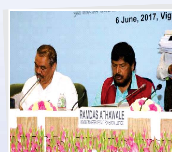
Hon'ble MOS, SJ&E on the launch of "Inclusive India Initiative"