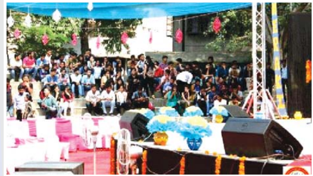
Students participating in the Inclusive India Programme

On 13th October 2017, National Trust has organised a Youth Festival among Delhi University students to propagate the essence of Inclusive India Initiative. The proclaimed national goal for the Hon'ble Prime Minister's vision of 'Youth Led Development' is the thrust behind the Youth Festival. Shri Krishan Pal Gurjar, Minister of State, Ministry of Social Justice & Empowerment, Government of India shared his thoughts with the students as the Chief Guest. The guiding force behind the Inclusive India campaign; Sh. KK Pandey, Chairperson, National Trust and Shri Mukesh Jain, CEO, National Trust were the Guests of Honour.