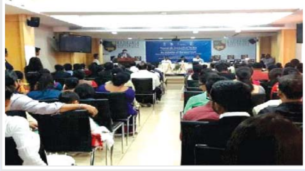
Regional workshops on Inclusive India Initiative conducted in Gangtok, Jorhat, Dehradun and Kangra