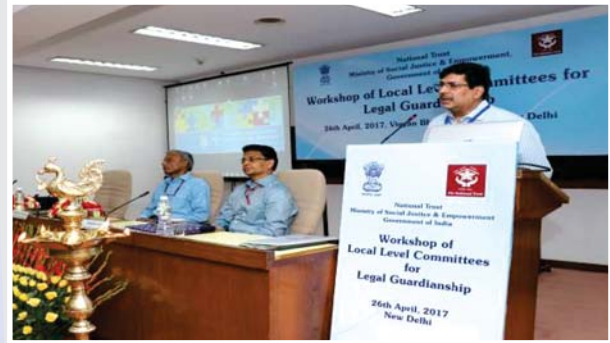
National Workshop on Local Level Committee for Legal Guardianship in Vigyan Bhawan, New Delhi on 12 th & 26 th April, 2017