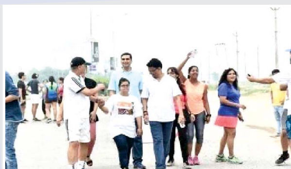
Inclusive Walkathon at Gurugram on 16.7.2017

An inclusive walkathon was organized involving professional runners, bikers, volunteers, students, corporate heads and people with intellectual and developmental disabilities, to spread a message of 'Building an Inclusive nation' where everyone is equal. The event had participation from 1,100 people from all walks of life, including 120 people with intellectual and developmental disabilities.