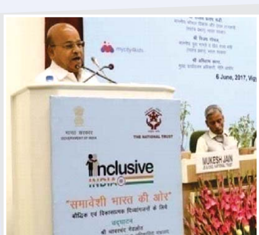
Address by the Hon'ble Minister, SJ&E On the launch of "Inclusive India Initiative"

The National Trust launched 'Inclusive India Initiative' on 6.6.2017 with an objective to bring inclusion in the Education, Employment and Community life of Persons with Intellectual and Developmental Disabilities (PwIDDs). The initiative aims at sensitizing masses and facilitating inclusion. The initiative was launched by Hon'ble Minister for Social Justice & Empowerment, Shri Thaawarchand Gehlot in the presence of Shri Vijay Goel, Hon'ble MoS(I/C), Youth Affairs & Sports; Shri Rajiv Pratap Rudy, MoS(I/C), Skill Development and Entrepreneurship; Shri Amitabh Kant, CEO, NITI Ayog and Shri Yuri Afanasiev UN Representative to India; Shri N.S. Kang, Secretary, Department of Empowerment of Persons with Disabilities (Divyangjan).