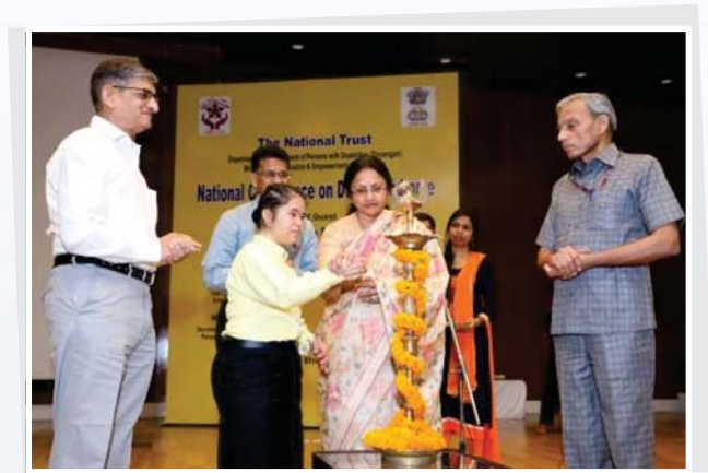
Opening ceremony of the National Conference on Down Syndrome on 26 March 2018

The conference brought intellectuals from all walks of life on one platform to spur ideas and channelized knowledge on Down Syndrome which was very beneficial to enable a positive change in the people with Down Syndrome. People with Down Syndrome and their parents were invited to share their inspirational stories.