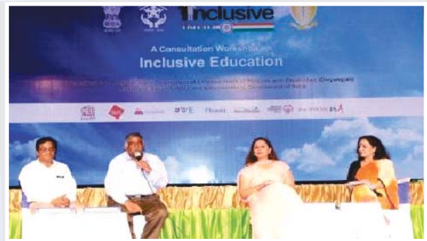
Consultation Workshop on Inclusive Education on 27.7.2017

With an aim to create accessible and inclusive institutions, for students with intellectual and developmental disabilities, a consultation workshop on Inclusive Education was scheduled on 27 July 2017 by National Trust. The workshop was a collaborative effort of school heads, teachers, special educators, parents from across 125 schools of Delhi-NCR, both government and private.