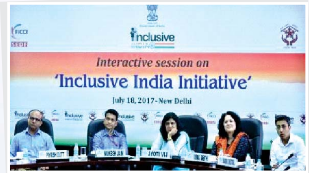
Inclusive Employment Meet on 18.7.2017

An 'Inclusive Employment' workshop with CEOs/ HR Heads of corporates was held on 18 July 2017 in collaboration with FICCI Socio Economic Development Foundation. Vishal Mega Mart, Bank of America, Jindal Stainless, Marks and Spencers, Accenture and TCI Foundation committed and pledge to support Inclusive Employment. The success stories shared at the workshop highlighted the need of including persons with intellectual and developmental disabilities in our recruitment policies and recognize them as the pool of potential productive employees.