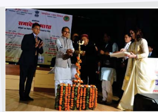
Shri Shivraj Singh Chauhan, Hon'ble Chief Minister, Madhya Pradesh in the Inclusive India Seminar on 10.2.2018

National Trust in collaboration with Department of Social Justice Madhya Pradesh has organized a seminar on “ Inclusive India and Self Advocacy ” in Bhopal on 10.2.2018. The seminar was conducted with the aim to create awareness amongst the policy makers and stakeholders. Shri Shivraj Singh Chauhan, Hon'ble Chief Minister of Madhya Pradesh inaugurated the seminar.