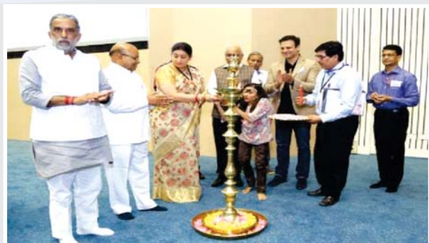
Opening Ceremony of the Inclusive India Summit in Vigyan Bhavan, Delhi on 12.9.2017