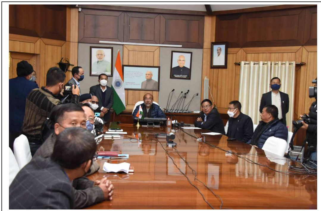
Fig: Hon'ble Chief Minister Launching mPension Manipur