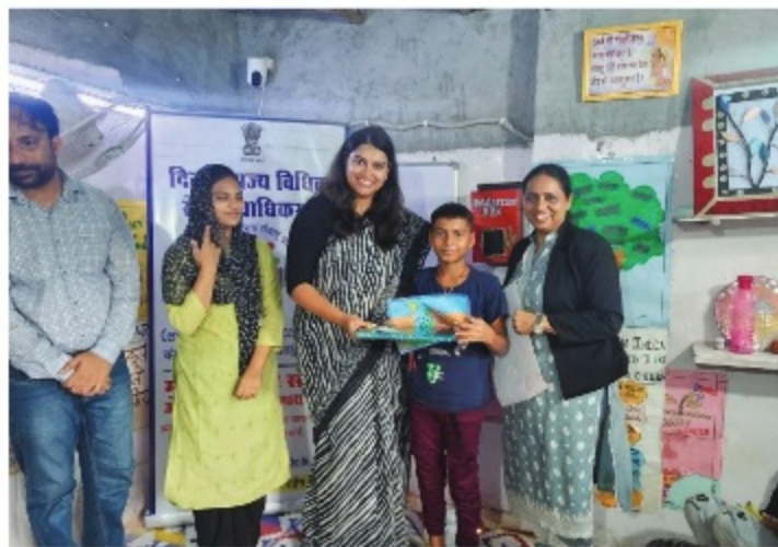
World Youth Skills Day: Awareness Session & Drawing Competition

On 15 th July 2025, the District Legal Services Authority, Central, Rouse Avenue, in collaboration with Railway Children India, organized an Awareness Session and Drawing Competition at Nava Hind Girls Senior Secondary School near Sarai Rohilla Railway Station area to mark World Youth Skills Day. The initiative engaged slum children in discussions on youth empowerment, the importance of education and opportunities for skill development. The resource team sensitized children about their legal rights, protections and the role of legal aid institutions in supporting vulnerable youth. Participants created artwork reflecting themes of aspiration, resilience and social responsibility. The programme strengthened awareness among children living in vulnerable circumstances, promoting positive choices and self-reliance through information and legal guidance.