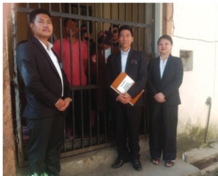
Arunachal Pradesh – Jail Visits & Legal Awareness for Inmates

On 22 nd August 2025, the District Legal Services Authority, Lohit, conducted its weekly visit to District Jail, Tezu, where grievance boxes were installed in both male and female wards and inmates were counselled on how to use them effectively to raise concerns confidentially. The team interacted with the undertrial prisoners (UTPs) and convicts who expressed interest in filing appeals before the High Court. They were provided guidance on documentation and timelines for legal processes. The same day, the DLSA Upper Subansiri team, led by the Assistant Legal Aid Defence Counsel (LADC), visited Sub-Jail Daporijo and held discussions with inmates regarding their legal rights, access to free legal aid and grievance redressal. These coordinated visits ensured continuous monitoring, timely intervention and strengthened access to justice for incarcerated individuals across both districts.