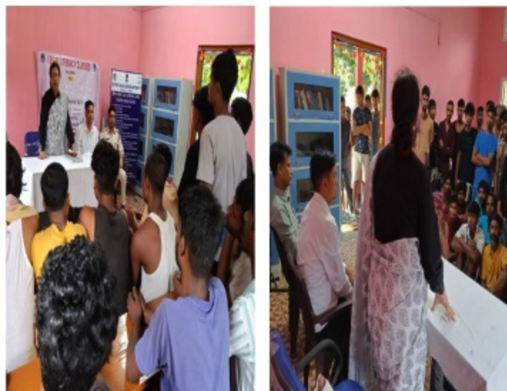
Assam – Legal Literacy & Awareness Programmes Across Jails

Throughout August 2025, District Legal Services Authorities across Assam conducted jail-based legal literacy sessions focusing on the rights of prisoners and reintegration support. The DLSA Majuli organized multiple sessions at District Jail, Majuli, on 7 th , 12 th , 14 th , 20 th , 26 th , 28 th and 29 th August, covering constitutional rights, the POCSO Act, rights of rape victims, health and hygiene, and life after release. Jail Visiting Lawyers and LADCs served as resource persons, guiding inmates on filing appeals, accessing legal aid and seeking counselling support. These sustained awareness programmes aimed to reduce legal illiteracy among inmates and strengthen their understanding of available remedies. The initiative reaffirmed DLSAs' commitment to ensuring timely legal assistance and supporting rehabilitation within correctional settings.