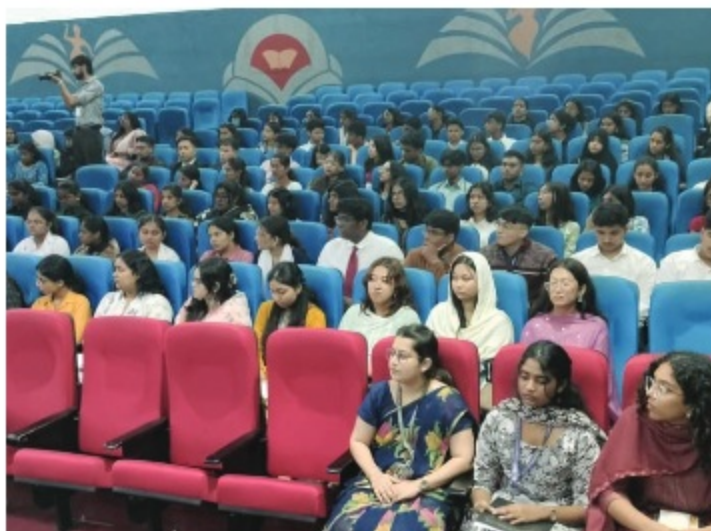
Karnataka – Orientation Programme on Legal Aid & Lawyering

At Colleges & Schools : Empowering the Future Leaders through Knowledge