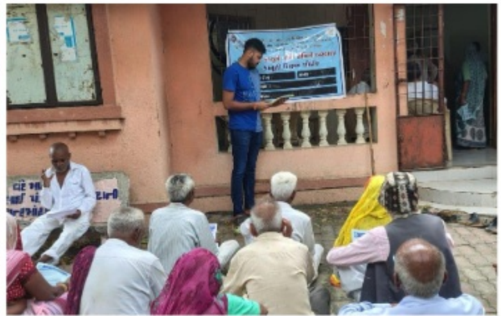
Gujarat – Legal Awareness Programme for Senior Citizens, Botad

On 5 th August 2025, the District Legal Services Authority, Botad, organized a focused Legal Awareness Programme for senior citizens at Chokdi Village, Barwala Taluka. Led by a Para Legal Volunteer (PLV), the session sensitized elderly participants about their rights under the NALSA (Legal Services to Senior Citizens) Scheme, 2016 , including maintenance rights, protection from neglect and access to free legal aid. Information was also provided on government welfare schemes, old-age pensions and support services available at the district level. The initiative strengthened legal empowerment among elderly residents, promoting dignity, security and informed decision-making within the community.