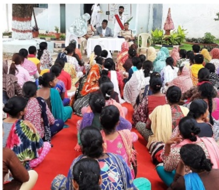
Telangana – Legal Awareness Camp at Special Prison for Women, Chanchalguda

On 16 th September 2025, a Legal Awareness Camp was organized at the Special Prison for Women, Chanchalguda, Hyderabad, with a focused session on prisoners' rights, mental health safeguards and free legal aid provisions. The resource team highlighted key protections under the NALSA (Legal Services to Persons with Mental Illness and Persons with Intellectual Disabilities) Scheme, 2024 , emphasizing access to treatment, rehabilitation and fair legal representation. Women inmates were guided on procedures for raising grievances, accessing counselling and seeking assistance for pending cases. The session aimed to build confidence among inmates by ensuring they were aware of their entitlements and available institutional support. The programme reinforced NALSA's commitment to humane, inclusive and rights-based legal services within correctional environments.