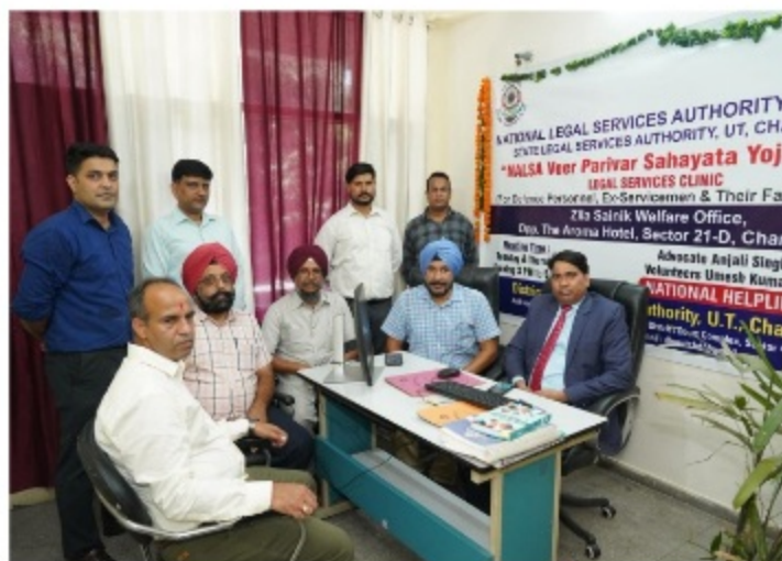
Chandigarh – Legal Services Clinic under NALSA Veer Parivar Sahayata Yojana

On 31 st July 2025, the Unakoti Kailashahar District Legal Services Authority, organized a large community rally under the nationwide “Mediation for Nation” campaign to promote mediation as a people-friendly alternative to litigation. The rally aimed to create awareness about early dispute resolution, encouraging citizens to choose dialogue and compromise instead of conflict. PLVs and volunteers engaged with local residents, highlighting how mediation reduces delays, restores relationships and promotes social harmony. The outreach initiative strengthened public understanding of mediation as a cost-effective and accessible remedy, aligning with NALSA’s broader goal of reducing case pendency and fostering peaceful dispute settlement in everyday life.