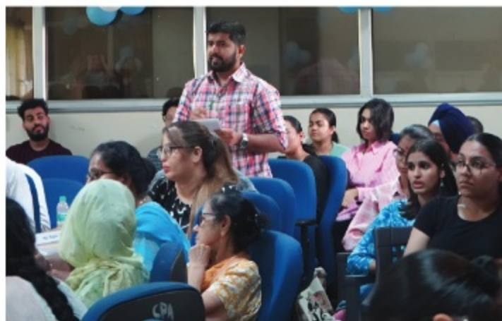
Chandigarh – Sensitization on Human Rights & Mental Health of Acid Attack Survivors

On 4 th August 2025, Kristu Jayanti College of Law, Bengaluru, in collaboration with the Karnataka State Legal Services Authority (KSLSA), organized an Orientation Programme on “Legal Aid and Lawyering” at the SKE Auditorium. The Ld. Member Secretary, KSLSA, inaugurated the programme and addressed over 500 faculty members, staff and students. The session covered the Legal Services Authorities Act, 1987 , functions of DLSAs, the role of student Para Legal Volunteers (PLVs) and essential laws relating to women and children. Participants were briefed on the importance of legal services clinics and community outreach. The programme aimed to inculcate a culture of legal awareness, responsibility and service among law students, encouraging them to contribute meaningfully to access-to-justice initiatives.