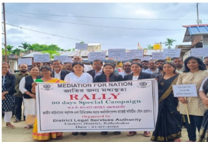
Tripura – ‘Mediation for Nation’ Rally

At Community Level : Empowering Communities through Knowledge