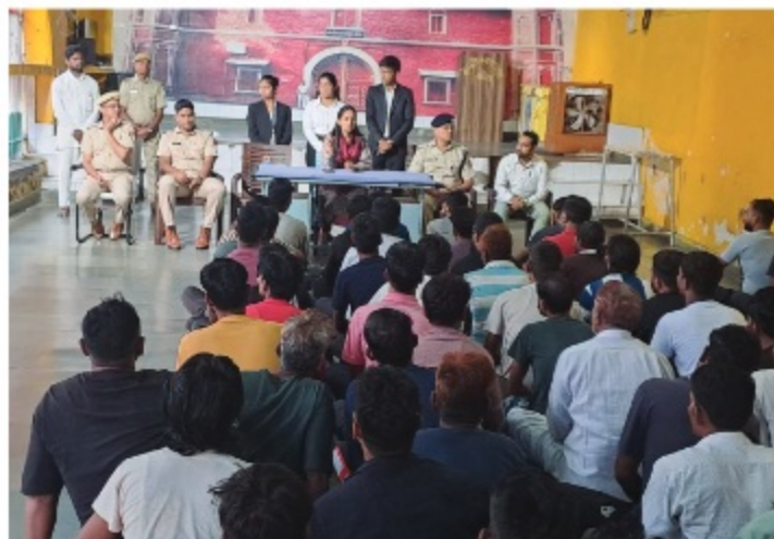
Rajasthan – Legal Awareness Camp at Central Jail, Kota

On 14 th July 2025, the District Legal Services Authority, Kota, in collaboration with the jail administration, organized a Legal Awareness Camp at Central Jail, Kota. The Secretary, DLSA Kota, served as the main speaker and sensitized inmates about their legal rights, access to free legal aid, plea bargaining and procedures for approaching Legal Services Institutions. Inmates were also informed about the Rajasthan State Legal Services Authority's Scheme for the Welfare of Prisoners and Teenagers in Conflict with Law, 2015 . The session aimed to strengthen inmate awareness of safeguards available under the law and promote rehabilitation-oriented decision-making. Around 200 inmates participated, engaging actively with the resource team and seeking clarifications on pending matters and appeal procedures.