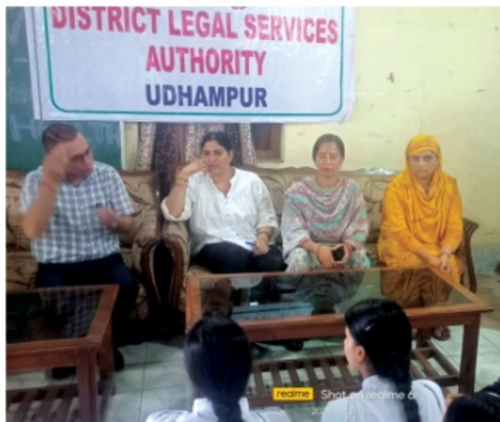
Jammu & Kashmir – Awareness Programmes by DLSA Udhampur & World Tribal Day

On 13 th August 2025, the District Legal Services Authority, Shahdara, conducted an Awareness Session on the “Maha-Swachhata Abhiyan” at the Legal Literacy Club ‘Samanvay,’ Amar Jyoti Charitable Trust, Karkardooma. A Legal Aid Counsel, served as the resource person and spoke on the importance of cleanliness, waste segregation and sustainable waste management. The session emphasized individual responsibility in maintaining hygiene, reducing waste and contributing to a healthier environment. The programme strengthened environmental awareness among young learners and encouraged them to adopt responsible habits at school, home and within the broader community fostering a culture of collective action and sustained environmental stewardship among all participants involved.