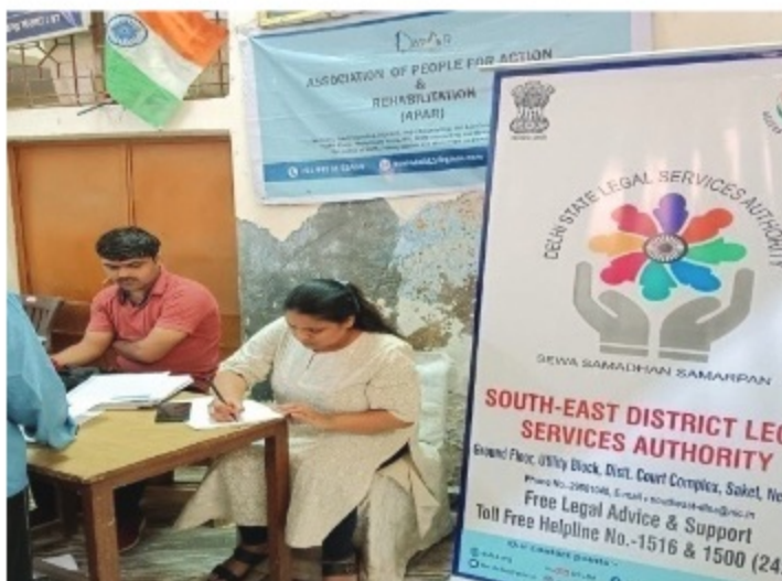
Delhi – Aadhaar Registration & Legal Aid Camp under SAATHI Campaign

On 10 th August 2025, the District Legal Services Authority, South-East Delhi, conducted an Aadhaar Registration and Legal Aid Camp at Hari Nagar, Ashram, under the national SAATHI campaign aimed at ensuring identity documentation for vulnerable children. The initiative targeted children living on the streets, in shelter homes, child care institutions and other marginalized individuals without Aadhaar. A Panel Lawyer from SEDLSA provided on-site legal guidance, helping participants understand documentation requirements and available entitlements. During the camp, Aadhaar registration was completed for numerous children and adults, enabling them to access education, healthcare, government welfare schemes and legal support mechanisms. The programme reinforced NALSA’s objective of ensuring identity, inclusion and dignity for every individual through coordinated outreach and doorstep legal assistance.