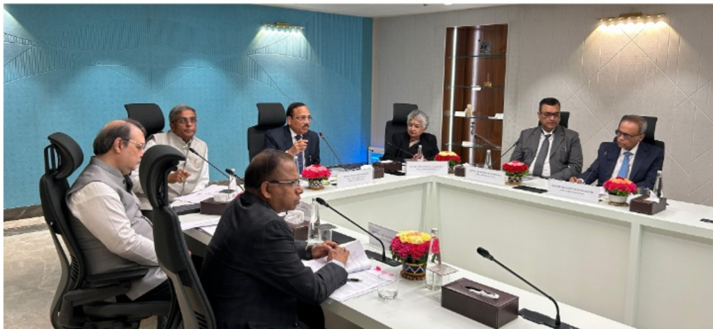
23 rd July 2025: Justice Surya Kant, Judge, Supreme Court of India and Executive Chairman, National Legal Services Authority (NALSA), along with Justice Vikram Nath, Justice BV Nagarathna, Justice JB Pardiwala, Justice Dipankar Datta, Justice KV Viswanathan and Justice Joymalya Bagchi, Judges, Supreme Court of India, at the National Virtual Consultative Meeting convened by NALSA

Suggestions included expanding mediation to labour disputes, arbitration-related matters and execution-stage cases, and encouraging greater involvement of Judicial Officers in referrals. A proposal for a Special National Lok Adalat for Contentious Cases was also examined, focusing on complex matters that meaningfully impact pendency on the NJDG. The importance of qualitative assessment, such as judicial time saved—was underscored.