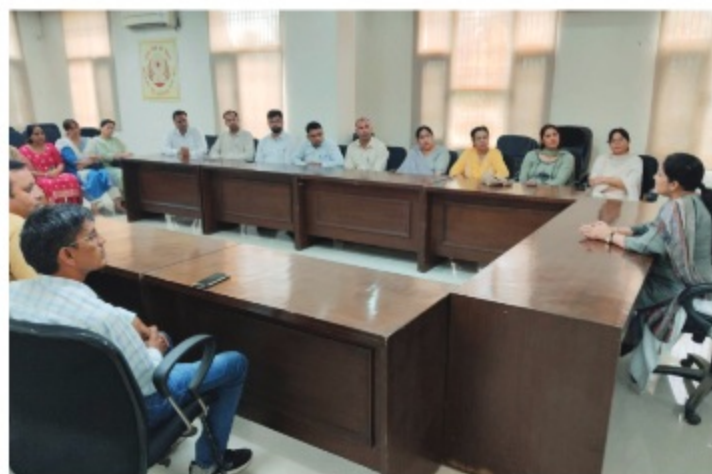
Haryana – Two-Day Training for PLVs on Multiple NALSA Schemes, DLSA Jind

The District Legal Services Authority, Jind, organized a two-day training programme for Para Legal Volunteers (PLVs) focusing on the NALSA (Victims of Trafficking and Commercial Sexual Exploitation) Scheme, 2015; the NALSA (Effective Implementation of Poverty Alleviation) Scheme, 2015; voting rights under the “Haq Hamara Bhi Hai” campaign; rights and rehabilitation of persons affected by leprosy; and the Juvenile Justice (Care and Protection of Children) Act, 2015. The sessions enhanced their understanding of vulnerable groups’ entitlements, field-level identification, referral mechanisms and documentation. The training strengthened PLVs’ capacity to serve as first responders at the grassroots, improving outreach and early intervention for marginalized individuals.