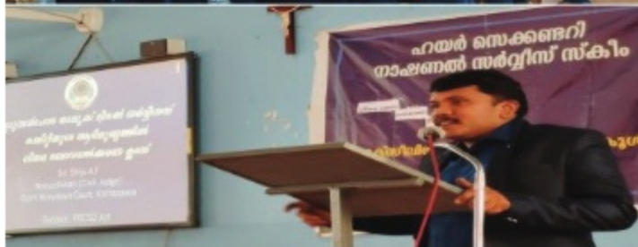
Taluk Legal Services Committee Udumbanchola - Nedumkandam