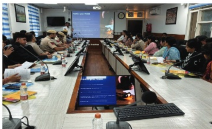
Delhi – Training on Role of Police Officials under POCSO Act & Victim Compensation

On 4 th August 2025, an Awareness-cum-Training Programme was conducted at the Office of the DCP, Seelampur, focusing on the role of police officials under the POCSO Act and procedures relating to victim compensation. The session was organized by the NE DLSA and the same was attended by ACPs, SHOs, JWOs, Child Welfare Police Officers and members of SJPU. The resource person delivered an extensive lecture on child-sensitive investigation, mandatory reporting, evidence handling, responsibilities of police officers, timelines under the POCSO Act and on State and Central victim compensation schemes. The session strengthened procedural capacity within the police force and improved institutional convergence for faster, survivor-centric justice delivery.