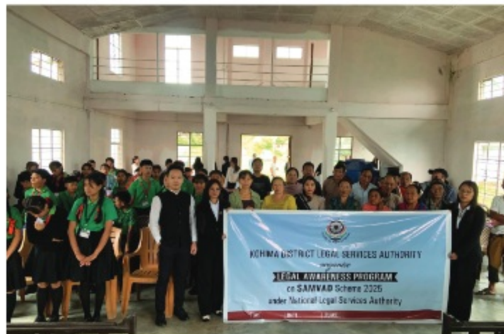
Nagaland – SAMVAD Outreach for Tribal & Nomadic Communities

On 24 th September 2025, the District Legal Services Authority, Jaisalmer, in collaboration with the local administration, conducted a Legal Literacy Camp at Bada Bag focusing on women's rights and legal protections. A PLV/Adhikar Mitra served as the main resource person and guided participants on key laws including the POSH Act, Domestic Violence Act, provisions relating to mediation, Lok Adalats and free legal services. Women were informed about accessible remedies, complaint mechanisms and available institutional support. The programme encouraged participants to confidently report grievances and seek assistance through DLSA platforms. The interactive session witnessed active community participation and strengthened awareness on gender-based protections, contributing to safer, informed and more empowered communities in Jaisalmer district.