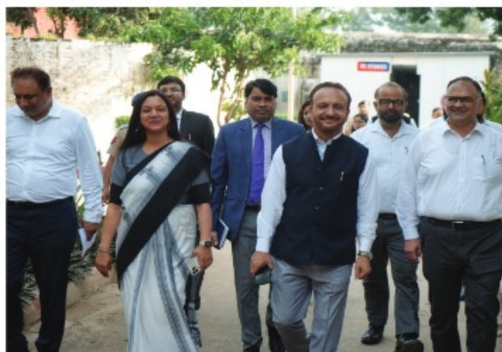
Chandigarh – Jail Visit & Inspection at Model Jail

On 30 th August 2025, the Ld. District & Sessions Judge-cum-Chairman, District Legal Services Authority, U.T. Chandigarh, accompanied by judicial officers, conducted a detailed inspection of Model Jail, Chandigarh. During the visit, officials interacted directly with undertrial prisoners (UTPs) and convicts to understand their concerns relating to pending cases, medical facilities and access to legal aid. Directions were issued to jail authorities for prompt action on grievances raised during the interaction. The inspection also included a review of the kitchen, canteen and stock-keeping procedures to ensure compliance with the Jail Manual and maintenance of food quality. The visit reaffirmed DLSA's commitment to monitoring jail conditions and ensuring that all prisoners receive fair treatment, dignity and timely legal assistance.