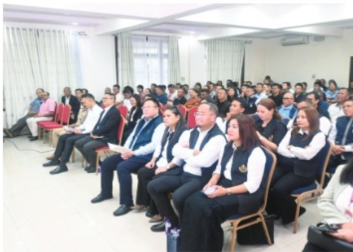
Mizoram – Launch of SOP & Flowchart under NDPS Act and Training of Trainers