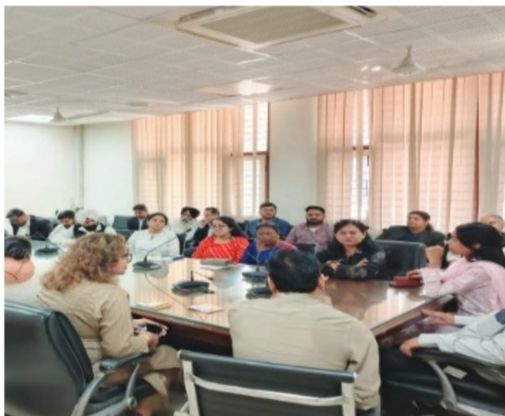
Chandigarh – Sensitization Session on Transgender Persons (Protection of Rights) Act

On 11 th September 2025, a sensitization session on the Transgender Persons (Protection of Rights) Act, 2019, was held at the District Legal Services Authority, UT Chandigarh, in collaboration with the Humsafar Trust, Mumbai. The session aimed to raise awareness on legal protections, non-discrimination provisions, welfare measures and grievance redressal mechanisms available to transgender persons. The President of Saksham Prakriti Welfare Society, delivered an insightful lecture addressing stigma, identity documentation challenges and access to healthcare. Participants engaged in interactive discussions on ensuring respectful, inclusive and rights-based support. The programme enhanced participants’ sensitivity and strengthened the understanding of institutional stakeholders and community volunteers in promoting genuine social inclusion and dignity.