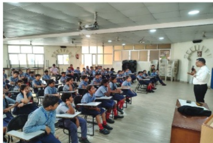
Delhi – Awareness Session on 'Maha-Swachhata Abhiyan'

In August 2025, the District Legal Services Authority, Udhampur, conducted a series of awareness programmes across Government Higher Secondary Schools focusing on child protection and gender empowerment. World Tribal Day was observed on 9 th August at Government Middle School, Panchgam Nard Kund, Qazigund, highlighting constitutional protections and welfare schemes for tribal communities. On 13 th August, an awareness session was held on the NALSA (ASHA – Awareness, Support, Help and Action) SOP 2025 aimed at eliminating child marriage. Additionally, on 21 st August, another session addressed drug addiction, accompanied by an essay competition under the Beti Bachao Beti Padhao initiative. These initiatives fostered awareness among students on key social, legal and gender-based issues while promoting sensitivity, responsibility and informed citizenship.