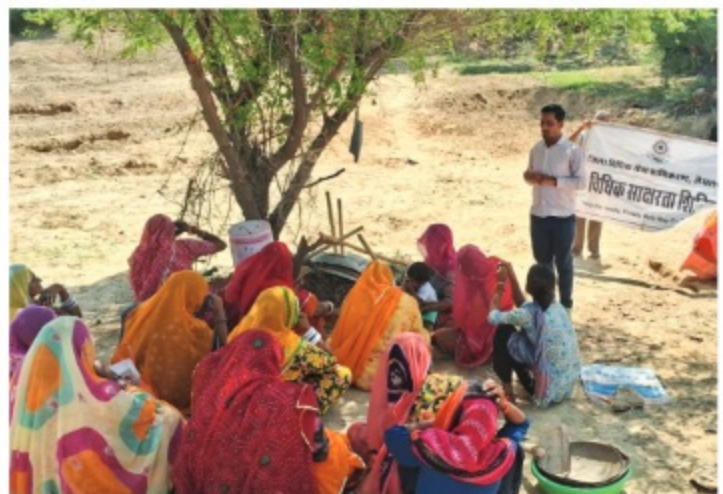
Rajasthan – Legal Literacy Camp on Women's Rights, Jaisalmer

Throughout July and August, extensive community-level outreach was conducted under the aegis of NALSA and the Nagaland State Legal Services Authority (NSLSA) as part of the NALSA SAMVAD Scheme, 2025 . Across Kohima, Dimapur, Longleng, Mokokchung and Peren, District Legal Services Authorities organized village meetings, interactive discussions and door-to-door legal awareness drives on issues such as child marriage, drug abuse, education rights, welfare entitlements, domestic violence and access to free legal aid. Special emphasis was placed on reaching marginalized Adivasi, Denotified and Nomadic Tribes to ensure their meaningful inclusion within legal and welfare systems. The coordinated outreach strengthened legal literacy, promoted social protection and deepened access to justice for communities that have historically remained underserved.