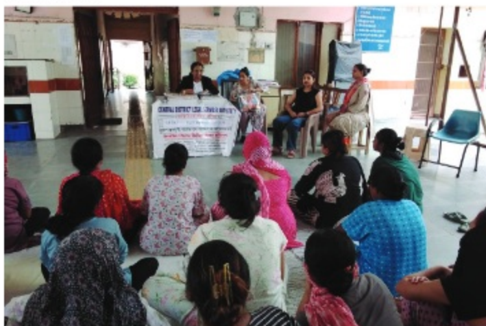
Delhi – Legal Rights & Mental Health Support for Women Inmates

On 22 nd August 2025, the Central District Legal Services Authority conducted an interactive legal awareness session at Central Jail No. 6, Tihar Jail, focused on “Help and Rights for Women with Mental Health Challenges in Jail.” Led by a Legal Aid Counsel, the session explained key protections under the Mental Healthcare Act, provisions for treatment and rehabilitation, grievance-redress mechanisms and entitlements to free legal aid. Women inmates were encouraged to seek support through jail legal services clinics for issues concerning case follow-ups, appeals and mental health services. The programme reassured inmates that their rights and dignity remain safeguarded under the law. The participating women gained practical awareness on legal protections and available support systems.