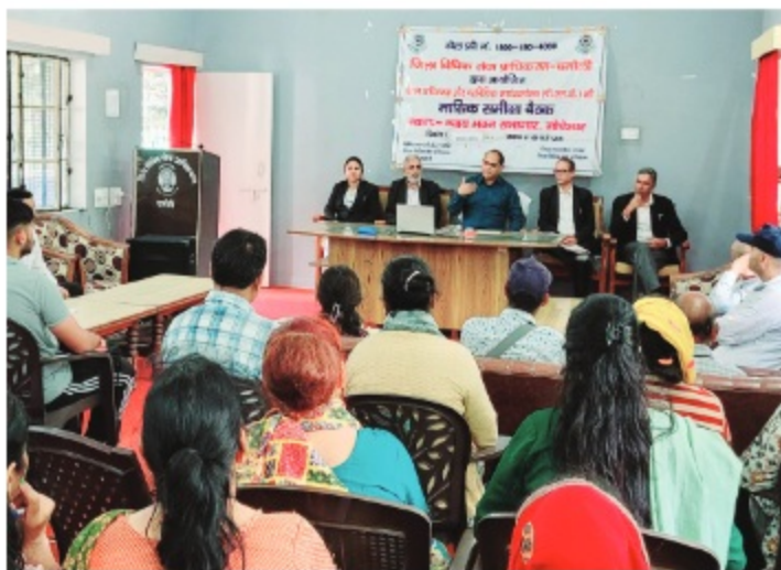
Uttarakhand – Training on NALSA Portal (LSMS & LAIS) and NALSA Schemes, DLSA Chamoli

The District Legal Services Authority, Jind, organized a two-day training programme for Para Legal Volunteers (PLVs) focusing on the NALSA (Victims of Trafficking and Commercial Sexual Exploitation) Scheme, 2015; the NALSA (Effective Implementation of Poverty Alleviation) Scheme, 2015; voting rights under the “Haq Hamara Bhi Hai” campaign; rights and rehabilitation of persons affected by leprosy; and the Juvenile Justice (Care and Protection of Children) Act, 2015. The sessions enhanced their understanding of vulnerable groups’ entitlements, field-level identification, referral mechanisms and documentation. The training strengthened PLVs’ capacity to serve as first responders at the grassroots, improving outreach and early intervention for marginalized individuals.