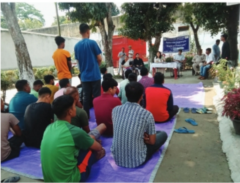
DLSA, Majuli (Assam) at District Jail, Majuli

March 26, 2025: DLSA, Majuli (Assam) organized an awareness programme at the District Jail, Majuli, focusing on key aspects of the Premature Release, Parole, and Furlough of Prisoners, along with the broader Rights of Prisoners. The programme was focused on generating consciousness amongst the inmates and prison authorities about legal safeguards and mechanisms available under the law to ensure humane and just treatment of incarcerated individuals. It provided valuable information on the procedures for applying for premature release, parole, and furlough, helping inmates understand their rights and avenues for seeking temporary release. The initiative also emphasized the importance of ensuring fair treatment for prisoners, promoting rehabilitation, and encouraging better access to legal remedies. By addressing these critical issues, the programme aimed to significantly enhance legal awareness among inmates and reinforce the principles of justice and human dignity within the prison system.