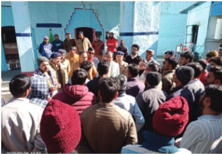
DLSA Nainital (Uttarakhand) at District Jail Nainital and Sub Jail Haldwani

February 13, 2025: A Special Campaign and Legal Awareness Programme was conducted at District Jail, Lunglei (Mizoram) in collaboration with the Healthy Lunglei Campaign. The initiative included a health screening drive to address the legal and medical needs of the inmates, ensuring their holistic well-being and access to justice. In addition to providing legal awareness on topics such as prisoner rights, legal aid, and available support schemes, the programme aimed to promote health and wellness among the inmates. The session offered a holistic approach to care, addressing both an individual's physical health concerns and legal entitlements, ensuring they are informed and empowered in seeking justice and support. This multifaceted and rehabilitative campaign underscored the critical and often overlooked link between legal empowerment and physical well-being within custodial settings.