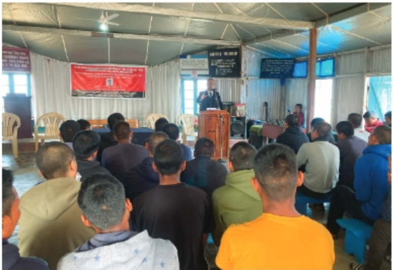
Glimpse from a Legal Awareness Programme at District Jail, Lunglei (Mizoram)

January 6, 2025: A legal awareness camp was organized by DLSA Nainital (Uttarakhand) at District Jail Nainital and Sub Jail Haldwani, where prisoners' concerns were addressed by the Hon'ble Chairman, DLSA. Inmates were informed about National Lok Adalat, compounding, remission, commutation, the e-Prison portal, e-true copy, and sensitization was done regarding various schemes and prisoner rights. It emphasized the importance of legal support and dignity for incarcerated individuals. The benefits of skill development were highlighted, with discussions focusing on how acquiring new skills can significantly contribute to the rehabilitation and reintegration of prisoners into society post-release. Jail PLVs were sensitized on the NALSA Prison Legal Aid Clinic SOP to ensure effective implementation of legal aid services inside prisons. A survey on caste-based discrimination in jail work allotment was also conducted.