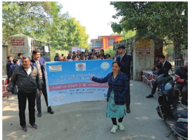
DLSA, Dehradun (Uttarakhand) at Shri Guru Ram Rai Public School, Bindal

January 30, 2025: DLSA, Dehradun (Uttarakhand), organized a legal awareness camp at Shri Guru Ram Rai Public School, Bindal, to educate students on important legal and social issues. The session covered the POCSO Act, Cybercrime, Social Media fraud, the ill effects of drug addiction, and introduced students to the NALSA toll-free legal aid helpline 15100. In addition to the awareness programme, a cleanliness rally was conducted by the students to mark National Cleanliness Day, promoting hygiene and social responsibility. The event witnessed enthusiastic participation and served as a meaningful initiative towards empowering youth through legal knowledge and civic awareness. Resource persons from the legal fraternity and police department engaged with the students, addressing their queries and encouraging proactive legal awareness. The session adopted a student-friendly approach, making complex legal topics more relatable for the young audience.