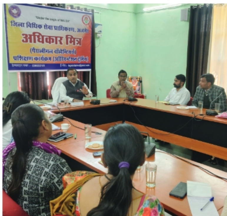
Glimpse from Orientation Training Organized by DLSA, Ajmer (Rajasthan)

March 23, 2025: A One-Day Refresher Training Programme was organized for Legal Aid Defense Counsels at the Chhattisgarh State Judicial Academy. The training aimed to strengthen the legal knowledge, courtroom skills, and procedural understanding of Legal Aid Defense Counsels to ensure effective representation of beneficiaries with professionalism, empathy & a strong commitment to justice under the legal aid system. The programme included expert-led sessions, interactive discussions, and practical insights on recent developments in criminal law and defense strategies. Participants also had the opportunity to engage in case studies to apply the knowledge gained in real-world scenarios. This initiative forms an integral part of the ongoing and concerted efforts to enhance the quality and efficiency of legal aid services across the state.