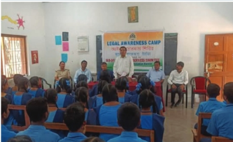
DLSA, Andaman & Nicobar Islands at VKV Zilla Parishad School, Basantipur

February 24, 2025: DLSA, Dibang Valley (Arunachal Pradesh), organized a one-day Free Legal Awareness Camp at the Government Residential School in Punli. The session aimed to enlighten students and staff about key legal safeguards for children, focusing on the Protection of Children from Sexual Offences (POCSO) Act, 2012, and the Prohibition of Child Marriage Act, 2006. The camp sought to enhance awareness and understanding of child protection laws, promoting legal literacy among young learners and empowering them with knowledge about their rights and protections under the law. It also encouraged open discussions about challenges faced by children in the community and highlighted the importance of reporting any form of abuse. The session was designed to ensure that the students and staff are equipped with the essential information and practical knowledge to protect themselves and those around them.