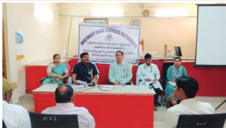
Glimpse from Capacity Building Programme Organized by DLSA, KB Asifabad (Telangana)

February 15 & 16, 2025: DLSA, KB Asifabad (Telangana), conducted an Orientation Training Programme for members of the Legal Services Unit for Persons with Mental Illness and Persons with Intellectual Disabilities under the NALSA (LSUM) Scheme, 2024. The training was held at the Senior Civil Judge Court Hall in Asifabad. The session was designed to provide the members with comprehensive knowledge and practical skills to effectively assist individuals with mental illnesses and intellectual disabilities in navigating and accessing legal services. The programme also focused on engaging participants in understanding the legal challenges faced by these individuals and provided insights into their rights and the legal provisions available for their protection and empowerment.