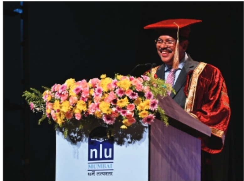
Glimpse from MNLU Convocation: MoU signed for a one-month internship programme with MNLU

With the approval of Hon'ble Mr. Justice B.R. Gavai, Judge, Supreme Court of India and Executive Chairman, NALSA, a significant boost was given to clinical legal education through the approval of proposals submitted by select universities. At MNLU Nagpur, an exclusive one-month internship at Legal Services Institutions was approved as a mandatory component of the B.A. LL.B. (Hons. in Adjudication and Justicing) five-year degree programme. At MNLU Mumbai, a four-week Internship Programme on Legal Research, Drafting, and Practical Exposure to Governance Mechanisms was approved for first and second-year law students, aimed at fostering a deeper understanding of the functioning of legal services authorities and judicial institutions. NLU Delhi has also been granted approval to involve students in various projects under NALSA and legal aid framework, offering them valuable experiential learning opportunities.