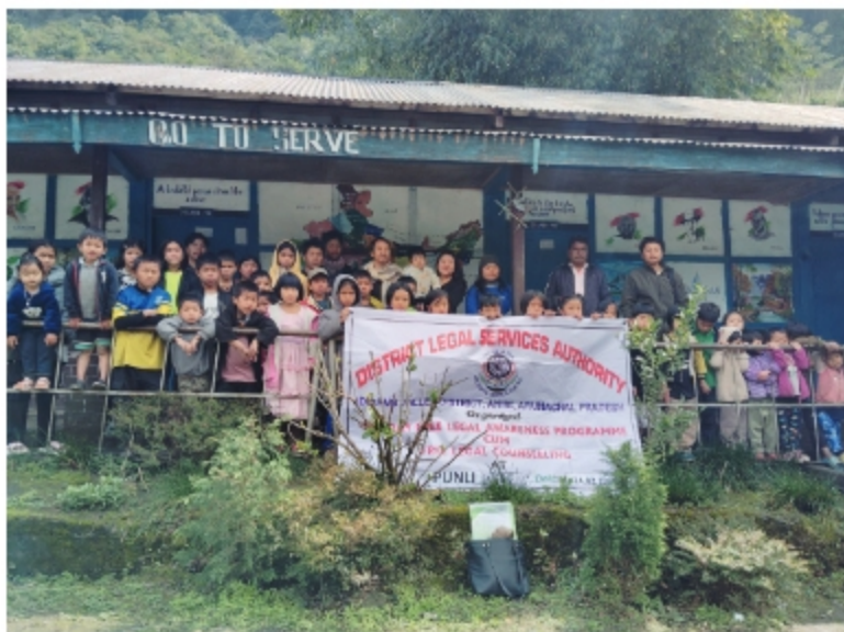
DLSA, Dibang Valley (Arunachal Pradesh) at Government Residential School, Punli

At Colleges & Schools : Empowering the Future Leaders through Knowledge