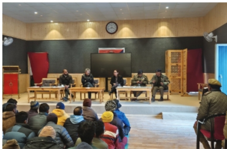
DLSA, Leh (Ladakh) at District Jail, Leh

March 27, 2025: DLSA, Leh (Ladakh) organized an awareness programme at the District Jail, Leh, focusing on the rights and entitlements of prisoners. As part of the initiative, the DLSA also conducted a screening to identify undertrial prisoners who were unrepresented, in order to extend free legal aid and ensure access to justice. This outreach programme aimed to create awareness among inmates about their legal rights while reinforcing the commitment of the DLSA to safeguard the rights of undertrial prisoners. Additionally, the programme highlighted the importance of legal representation in ensuring fair trial and preventing prolonged detention without proper legal recourse. The initiative emphasized the DLSA's role in promoting legal literacy and fostering a more inclusive justice.