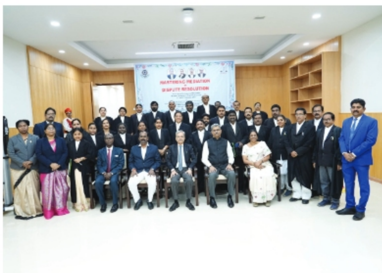
Glimpse from a Training Programme Organized by Andhra Pradesh SLA

February 17, 2025: A 40-hour Mediation Training Programme was conducted at the premises of the Hon'ble High Court, organized by the Andhra Pradesh SLA, Andhra Pradesh HCLSC, and the Mediation and Conciliation Project Committee (MCPC). The programme was inaugurated by Hon'ble Mr. Justice Ravi Nath Tilhari, who emphasized the importance of mediation in resolving disputes efficiently and reducing court caseloads. The Master Trainer provided participants with hands-on training in mediation techniques. The training aimed to enhance participants' mediation skills, enabling them to resolve disputes amicably and contribute to a more efficient justice system. The programme received an enthusiastic response from participants, reflecting a growing recognition of mediation as a vital tool in access to justice. Such initiatives are instrumental in building a cadre of trained mediators to support alternative dispute resolution mechanisms across the country.