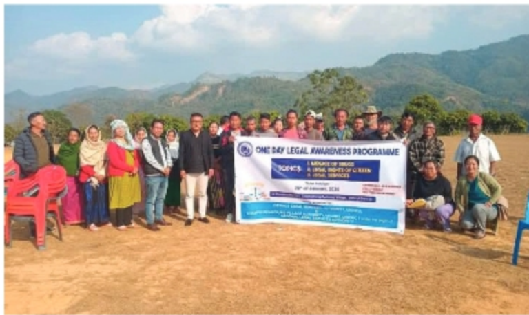
DLSA, Ukhrul (Manipur) at Champhung/Aphung Village

At Community Level : Empowering Communities through Knowledge