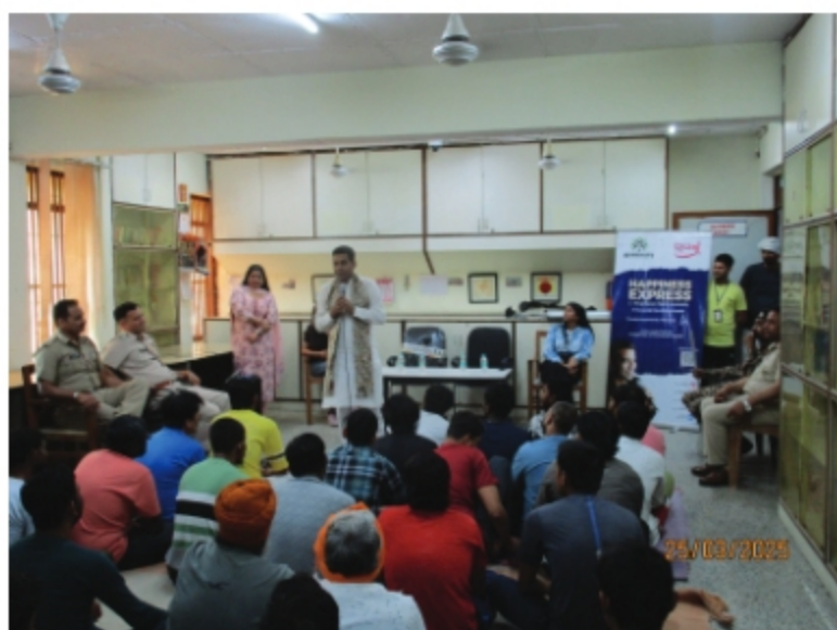
DLSA, North (New Delhi) at Central Jail No. 10, Rohini

March 25, 2025: DLSA, North (New Delhi) organized a mental health awareness session titled "From Isolation to Connection" at Central Jail No. 10, Rohini, for inmates, Para Legal Volunteers (PLVs), legal sewadars, and staff. The session emphasized the importance of mental well-being, offering coping strategies for stress, isolation, and anxiety, along with mindfulness techniques and information on available psychological support within the correctional system. Around 40 inmates actively participated, sharing their experiences in an open and supportive environment. The session aimed to destigmatize mental health issues and promote emotional resilience, ensuring inmates were aware of the mental health resources available to them. The session concluded with one-on-one counseling and guidance for the inmates on accessing ongoing mental health resources, empowering participants to take proactive steps toward improving their mental well-being.