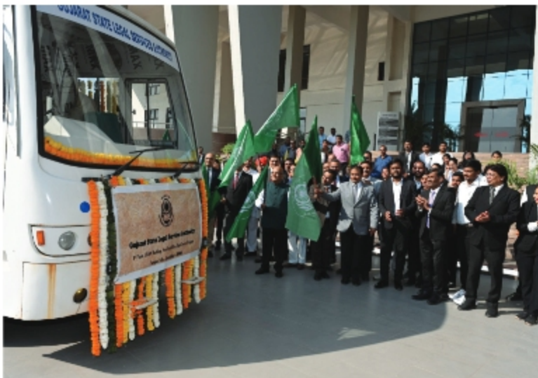
Glimpse from the Flag - Off Ceremony of the Mobile Van for Legal Awareness in Districts - Morbi and Kachchh