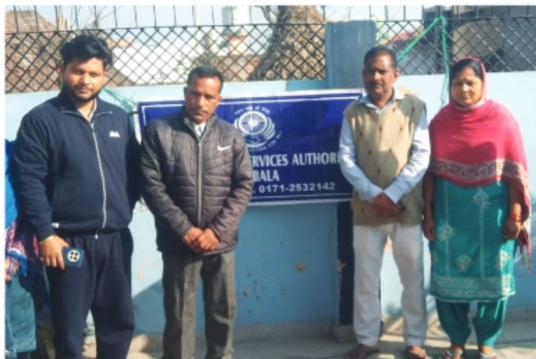
Glimpse from a Legal Awareness Programme conducted by DLSA, Ambala (Haryana)

February 18, 2025: DLSA, Ambala (Haryana), in collaboration with the Women and Child Development Department, organized an awareness campaign under the NALSA (Victims of Trafficking and Commercial Sexual Exploitation) Scheme, 2015, across various villages. The initiative was conducted by Para-Legal Volunteers (PLVs) and it was aimed at sensitizing the community about the rights and protections available to victims. The campaign received an encouraging response, with around 300 individuals participating and engaging in the sessions. Informational materials were distributed, and PLVs used storytelling and real-life examples to foster deeper understanding. Emphasis was laid on early identification, community support, and available government schemes for rehabilitation. The campaign not only raised awareness but also encouraged vigilance and reporting within the community.