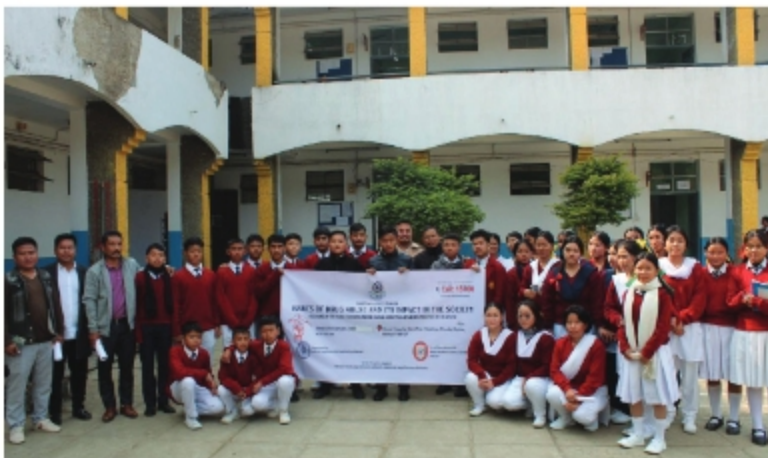
DLSA, Chandel (Manipur) at Jawahar Navodaya Vidyalaya (JNV)

January 30, 2025: DLSA, Dehradun (Uttarakhand), organized a legal awareness camp at Shri Guru Ram Rai Public School, Bindal, to educate students on important legal and social issues. The session covered the POCSO Act, Cybercrime, Social Media fraud, the ill effects of drug addiction, and introduced students to the NALSA toll-free legal aid helpline 15100. In addition to the awareness programme, a cleanliness rally was conducted by the students to mark National Cleanliness Day, promoting hygiene and social responsibility. The event witnessed enthusiastic participation and served as a meaningful initiative towards empowering youth through legal knowledge and civic awareness. Resource persons from the legal fraternity and police department engaged with the students, addressing their queries and encouraging proactive legal awareness. The session adopted a student-friendly approach, making complex legal topics more relatable for the young audience.