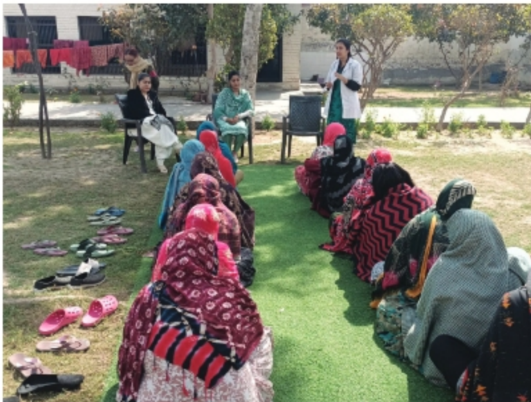
DLSA, Kaithal (Haryana) at District Jail, Kaithal

January 17, 2025: DLSA, Kaithal (Haryana), in collaboration with the Legal Aid Defence Counsel Office, organized five awareness programmes for female inmates of District Jail, Kaithal. The inmates were informed about their rights, including access to free legal aid, bail, parole, furlough, education, and the procedure for applying for legal assistance under the Legal Services Authorities Act, 1987. The sessions were specifically designed to empower the female inmates by providing them with crucial legal knowledge and practical insights, enabling them to better understand and navigate the complexities of the justice system. A total of 24 female inmates benefited from these sessions, gaining a clearer understanding of their rights and available resources. The initiative aimed to create an environment of legal literacy, ensuring that the inmates were aware of the legal support they could access for their rehabilitation, overall well-being and to assert their rights and seek justice.