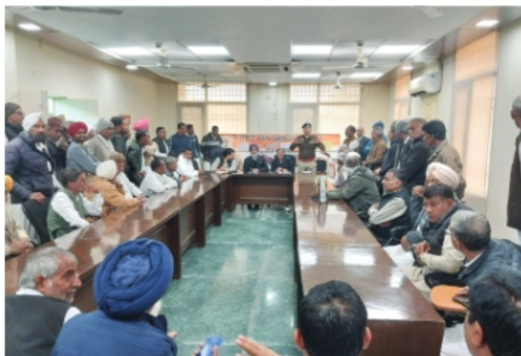
Glimpse from a Capacity Building Programme Organized by DLSA, Sirsa (Haryana)

January 17, 2025: DLSA, Sirsa (Haryana), conducted a meeting with Para-Legal Volunteers (PLVs) to review their work and discuss various NALSA Schemes. During the meeting, PLVs shared the challenges they face while organizing legal aid camps in remote areas in reaching marginalized communities. Panel Advocates, briefed the PLVs on two important NALSA Schemes: the NALSA (Effective Implementation of Poverty Alleviation Schemes) Scheme, 2015, which helps people access government poverty alleviation programmes, and the NALSA (Legal Services to Workers in the Unorganized Sector) Scheme, 2015, which focuses on providing legal support to workers in the unorganized sector. The session aimed to equip PLVs with the knowledge and tools to effectively implement these schemes in their respective areas. The meeting concluded with a renewed commitment to strengthen grassroots legal outreach.