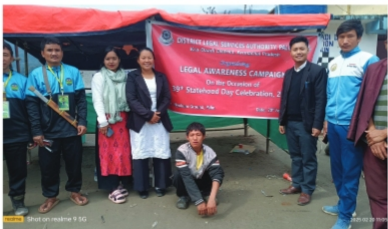
DLSA, Kra-Daadi (Arunachal Pradesh) at Nyokum Ground, Palin

January 28, 2025: DLSA, Ukhrul (Manipur), in collaboration with Tora Legal Aid Clinic, organized a Legal Awareness Programme at Champhung/Aphung village in Ukhrul District. The programme focused on three key topics: the menace of drug abuse, legal rights, and the availability of legal services. Advocates from Ukhrul District served as the Resource Person, delivering insightful guidance on these important issues. A total of 50 participants attended the session, which aimed to empower the local community with knowledge of their rights and available legal remedies while also addressing the growing concern of drug abuse. Resource persons engaged in interactive discussions with community members, encouraged them to speak openly about challenges faced within their locality.