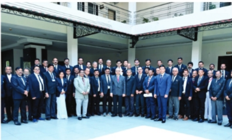
Glimpse from Refresher Training Programme conducted at Chhattisgarh State Judicial Academy

March 6, 2025: DLSA, Ajmer (Rajasthan), organized a Training-cum-Sensitization Session titled “PLV Orientation Training.” The session aimed to enhance the knowledge and capacity of Para Legal Volunteers (PLVs) by providing in-depth insights into the Para Legal Volunteer Scheme, its objectives, and implementation framework. The training focused on equipping participants with the necessary legal awareness and practical skills to effectively serve their communities and assist in promoting access to justice. It emphasized the vital role PLVs play in supporting marginalized groups and facilitating legal aid. Through interactive discussions and case studies, the session aimed to prepare PLVs to address common legal issues and provide assistance in legal matters such as domestic violence, women’s rights, and access to government schemes. This initiative contributed to building a stronger, more knowledgeable network of volunteers dedicated to enhancing legal awareness and access to justice within the community. Participants also shared field experiences, allowing for collective learning and exchange of strategies to address grassroots legal challenges. The session reinforced the importance of empathy, vigilance, and accountability in PLVs’ day-to-day roles.