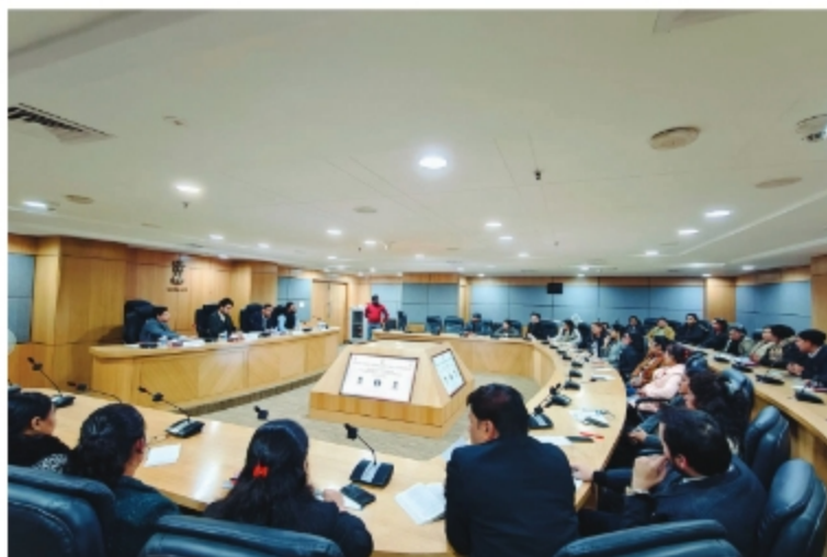
Glimpse from a Training Programme Organized by Delhi SLA