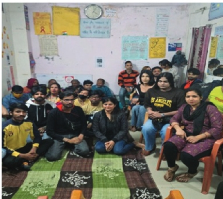
Glimpse from a Legal Awareness Programme conducted by DLSA, South-East (New Delhi)

March 5, 2025: DLSA, South-East (New Delhi), in collaboration with Bal Vikas Dhara NGO, organized an awareness session for transgender individuals and sex workers on the topic “Legal Rights of Sex Workers & Fundamental Rights.” The session witnessed the participation of approximately 40 individuals. The initiative aimed to raise awareness about the legal provisions and protections available to sex workers and transgender persons, including their fundamental rights and access to justice. The Participants were also informed about available support systems such as the NALSA Helpline (15100) and DSLSA Helpline (1516), both of which are operational 24x7. The session not only fostered open dialogue but also addressed individual concerns, and emphasized the importance of dignity, equality, and legal empowerment for marginalized communities. Through an interactive format, the initiative created a safe and inclusive space for participants to share their experiences and better understand their legal rights. It also reinforced the commitment of legal services institutions to extend meaningful support to those who are often on the fringes of the justice system.