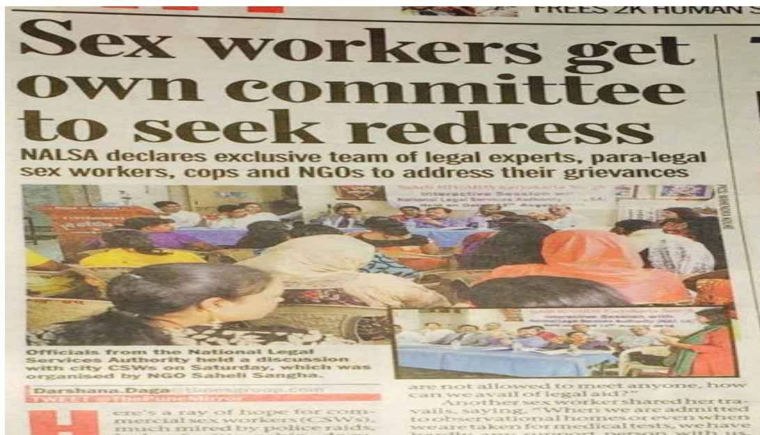
Newspaper clipping covering the Interaction with Sex Workers at Pune

for them with the District Legal Services Authorities and the police authorities in the said two districts. As part of the visit, the Officers of NALSA also interacted with the lawyers at Sangli and informed them about the various NALSA Schemes and motivated them to take up work as legal services lawyers.