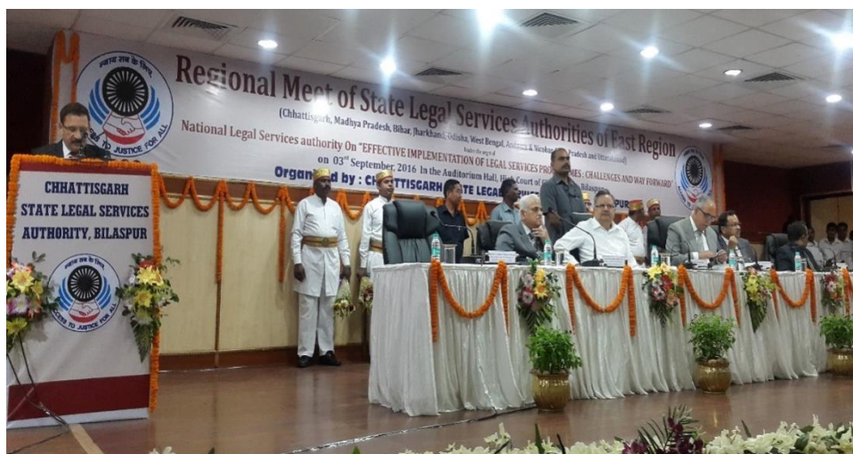
Inaugural Programme of the Regional Meet at Chhattisgarh