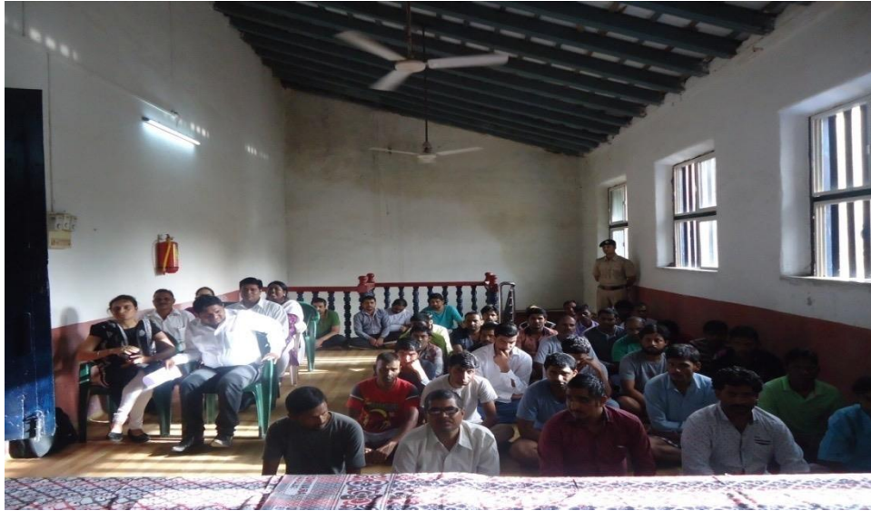
Inmates at Sub-Jail

An awareness programme on Rights of Prisoners and Provisions of Bail, Plea Bargaining” was organized on 03.09.2016 at Sub – Jail, Moti Daman.