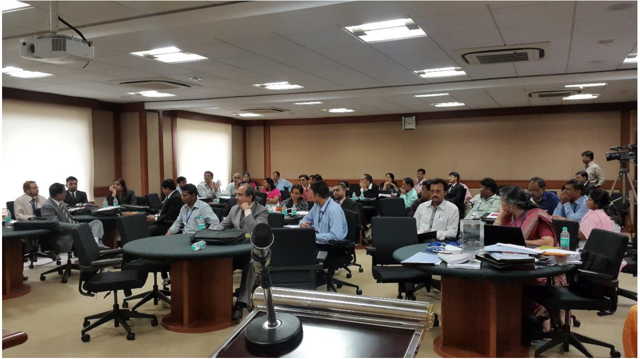
Pilot Training Programme in Progress