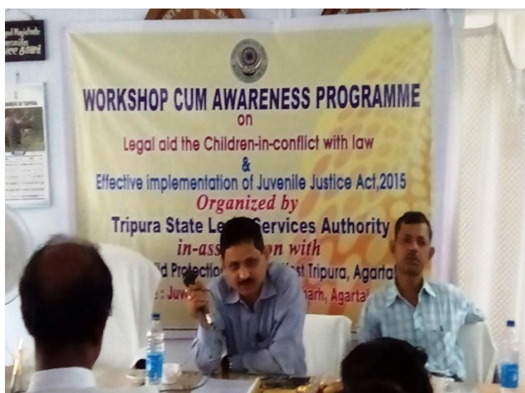
Workshop in-collaboration with District Child Protection Unit, West Tripura on Juvenile Justice (Care and Protection of Children) Act, 2015 on 20.07.2016 in the State Juvenile Home, Narasinghar, Agartala

In July, 2016 65 legal awareness camps were organized throughout the State and 8286 persons attended the same. In August, 2016 13 legal awareness camps were organized throughout the state in which 1049 persons participated. In September, 2016, 120 legal awareness camps were organized throughout the State in which 8286 participated.