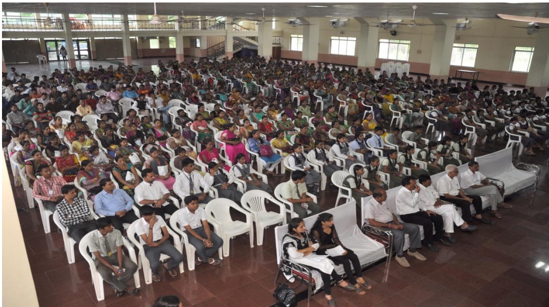
Advocates, Students of various schools