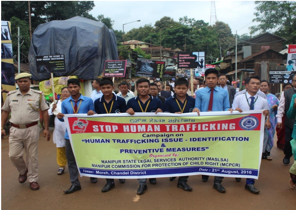
Mass Rally against Trafficking organized by Manipur State Legal Services Authority at Moreh, Chandel District on 21.8.2016

Manipur SLSA in association with SAATHII (NGO) organized an Inter-Departmental Workshop to discuss the issues of Transgender/ Implementation of guidelines of Hon'ble Supreme Court on the issue of Transgender Rights, etc. on 11.08.2016 at the High Court of Manipur. Representatives from various Government Departments/Stakeholders attended the function.