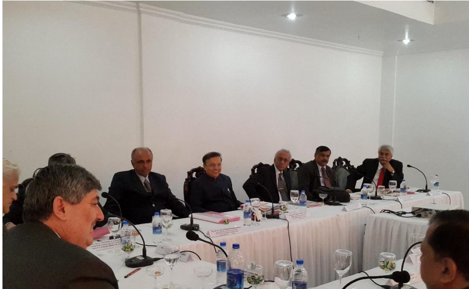
Regional Meet in Progress