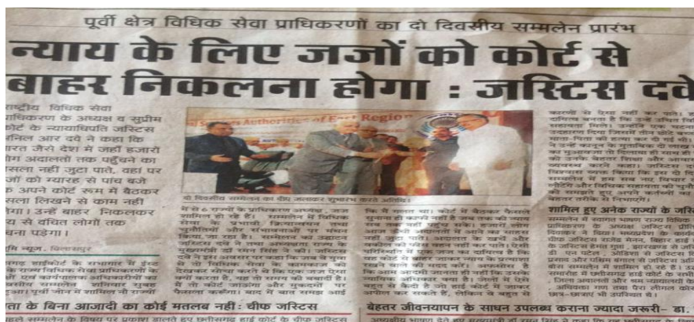
Newspaper clippings covering the Inaugural Programme of the Regional Meet at Chhattisgarh

On the second day of both the Regional Meets, a Meeting of all the Member Secretaries of the concerned SLSAs was held.