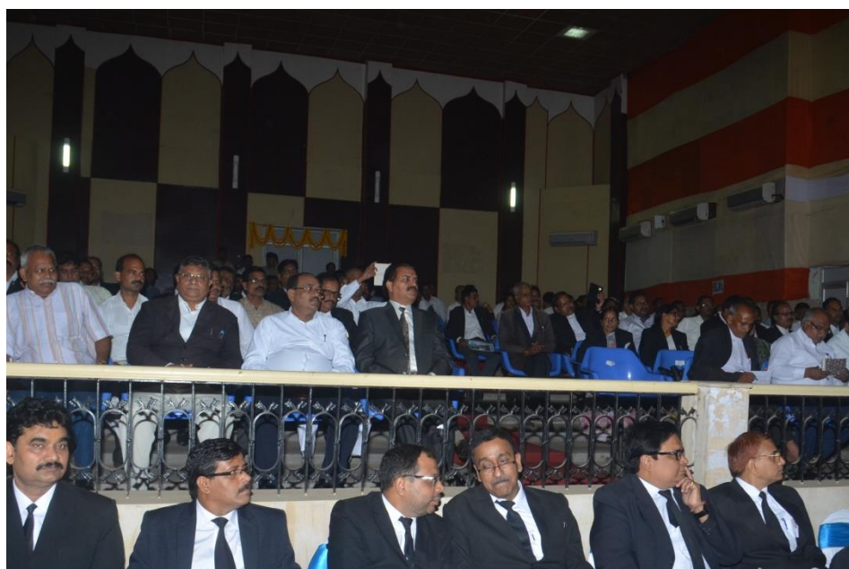
Participants at the Plenary Meeting at Deogarh