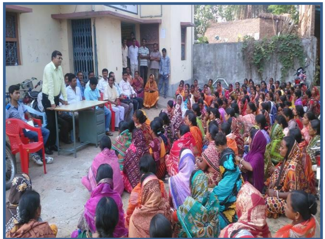
DLSA Secretary Hooghly speaking to the villagers about Legal aid services

The West Bengal State Legal Services Authority (WBSLSA) organised its first dissemination campaign on the NALSA Scheme on Human Trafficking and Commercial Sexual Exploitation