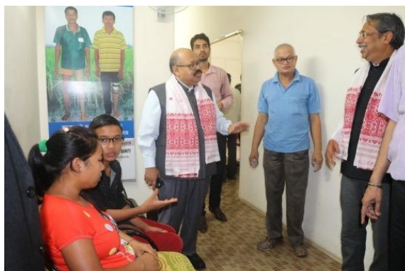
Hon'ble The Chief Justice of Gauhati High Court & Patron – in-Chief, ASLSA and Hon'ble Executive Chairman, ASLSA were present while the lady was being fitted with the prosthetic leg.

30,000 people had already been identified for providing prosthetic and assistive devices. The Government of Assam had agreed to provide logistical support to carry out the programme with the help and cooperation of the Social Welfare Department of the State.