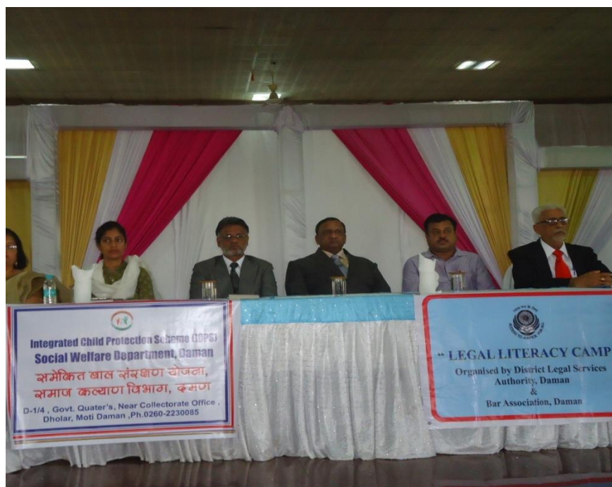
The Chairman, DLSA with other dignitaries

A programme on Scheme and Laws related to Senior Citizens, Rights of Children and related laws, Beti Bachao Beti Padhao, Child Friendly Legal Services to Children (Juvenile Justice Act)” was organized on 27.07.2016 at Koli Patel Samaj Hall, Nani Daman.