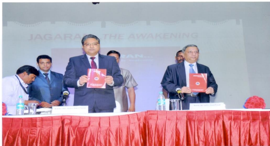
Hon'ble the Chief Justice, Orissa High Court and Hon'ble the Executive Chairman, OSLSA releasing the Book let "Jagarana"-the Awakening in the Commendation Ceremony of Best DLSA & Best PLV & Prize Giving Ceremony of State Level Competition for School & College Students organized by OSLSA at Odisha Judicial Academy, Cuttack on 6.8.2016.

members of Student Legal Literacy Clubs and Debates in selected colleges and then at District levels in the month of July, 2016. The winners of the District Level Competitions participated in the Zonal Level Competitions. The State Legal Services Authority organized a State Level Essay and Drawing competition and Debate amongst the Zonal Level Winners chosen across the State. The winners of State Level Competition were felicitated in a Prize Giving Ceremony graced by Hon'ble the Chief Justice, Orissa High Court-cum-Patron-in-Chief, OSLSA, Hon'ble Executive Chairman, OSLSA and Hon'ble Judges of the Hon'ble Court on 06.08.2016 at Odisha Judicial Academy, Cuttack. A short play, "Kuna Ra Kahani" was staged by the members of School Legal Literacy Clubs.