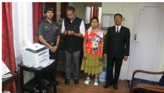
On her two legs with The Hon'ble Chief Justice of Gauhati High Court & Patron- in-Chief, ASLSA