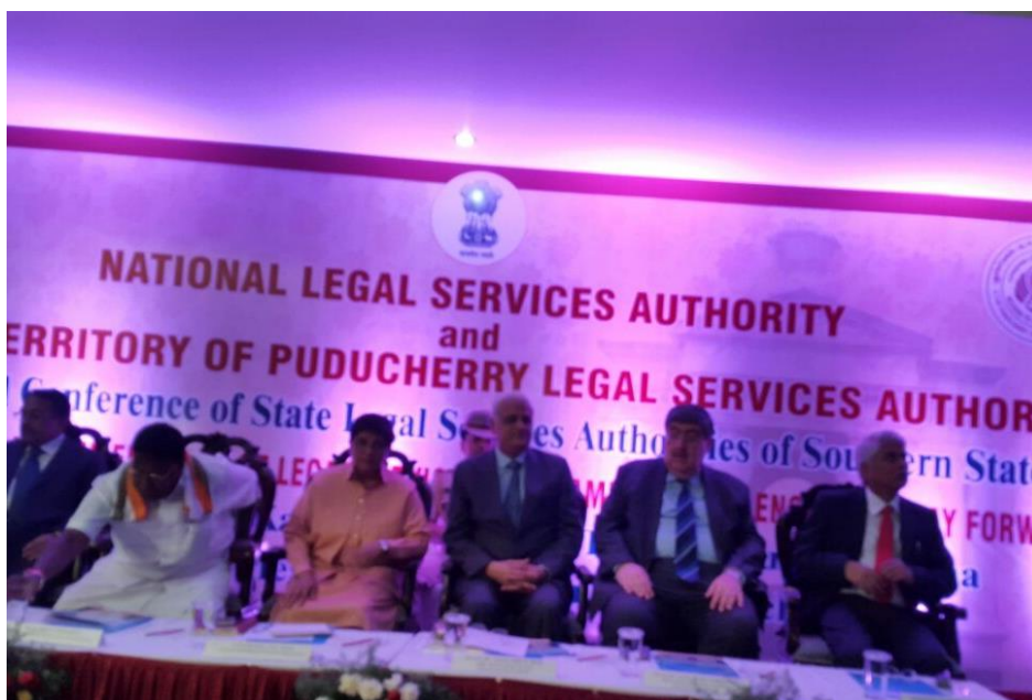
Inaugural Function of the Regional Meet at Puducherry