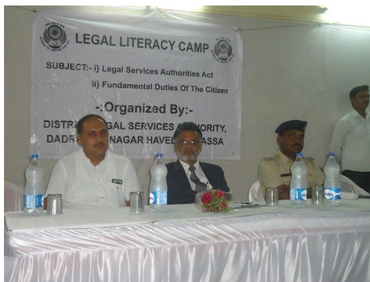
The Chairman, DLSA with other dignitaries

A Programme on “NALSA Schemes, Right to Education, Rights to Women, Transgender – Legal Problems & Solutions, ADR Methods and its benefits, Fundamental Duties of the Citizens” was organized on 27.09.2016 at Community Hall, Dadra.