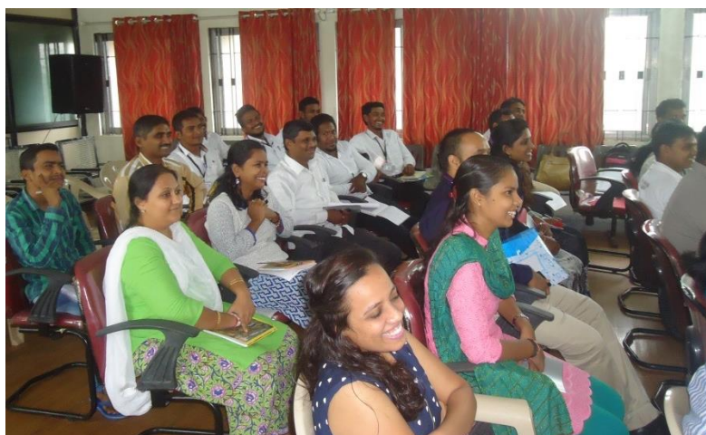
Para Legal Volunteers & Advocates participating in the training

One day Orientation Training for newly selected Para-legal Volunteers was held on 10.09.2016 at Consumer Forum Hall, District Court Complex, Silvassa.