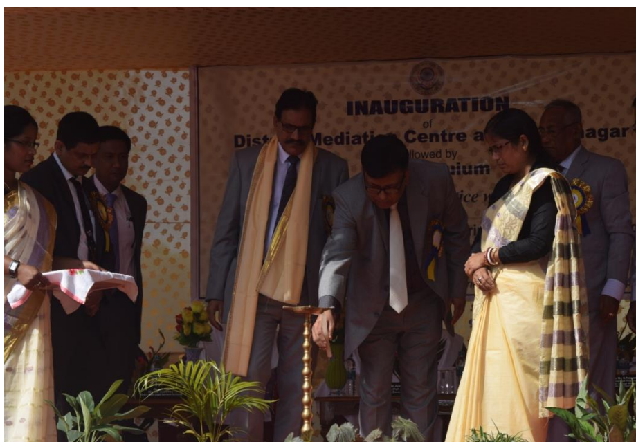
Inauguration of District Mediation Centre in the North Tripura District, Dharmanagar under DLSA, North on 24 th September, 2016.