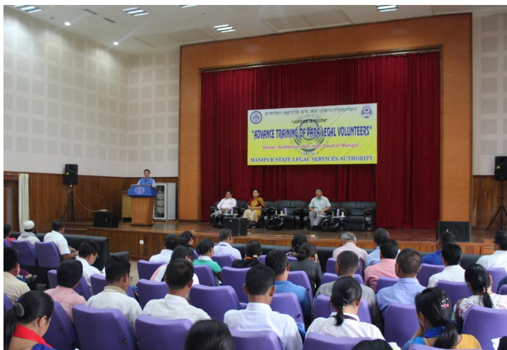
Advance Training Programme for PLVs on 2.7.2016 at Auditorium, High Court of Manipur