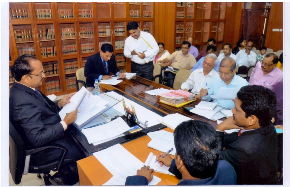
Hon'ble Shri Justice Sangam Ku.Sahoo, Judge, Orissa High Court presiding over a bench of monthly National Lok Adalat on 9.7.2016