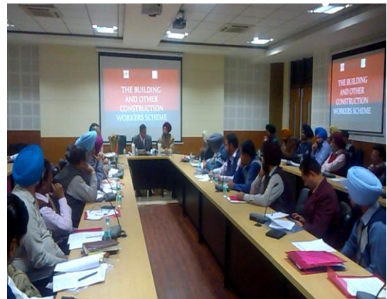
An Awareness programme and registration of Workers in Unorganized Sector and Awareness programme of officials of various departments engaged in employing workers in unorganized sector held by DLSA Patiala.

On 30.08.2016, a tree plantation programme was organized in every district in the State under the guidance of the Chairpersons of District Legal Services Authorities for making people aware about environment protection. More than 5500 trees were planted in one single day, all over the State during the programme.