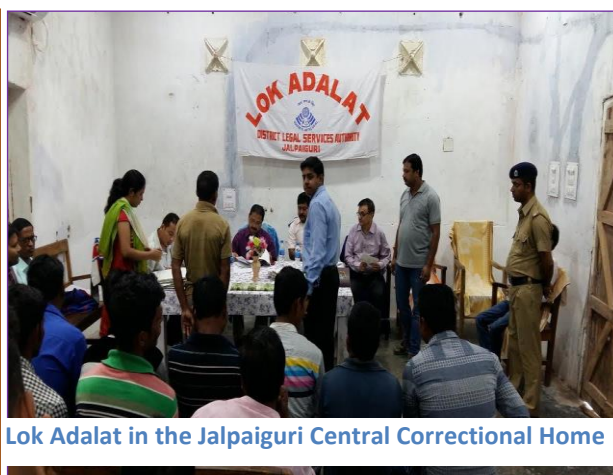
Lok Adalat in the Jalpaiguri Central Correctional Home

A Special Lok Adalat was organised at Jalpaiguri Central Correctional Home on 18.09.2016. About 25 G.R. cases relating to compoundable matters were taken up and 9 cases were disposed of.