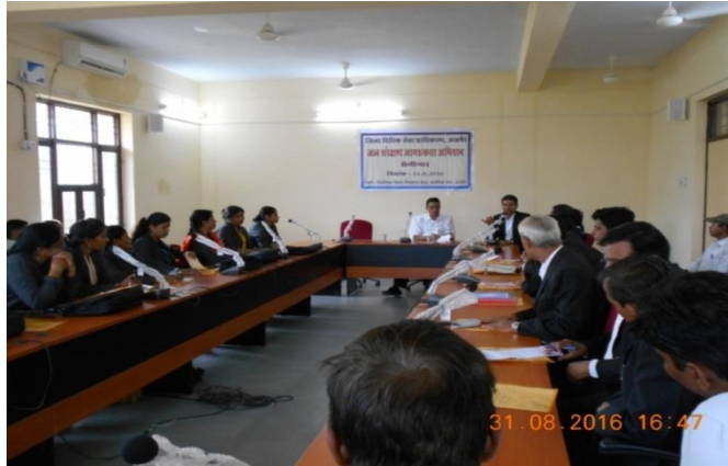
ADJ No.3 Ajmer and FTS, DLSA Ajmer addressing the participants at seminar of preservation of water resources