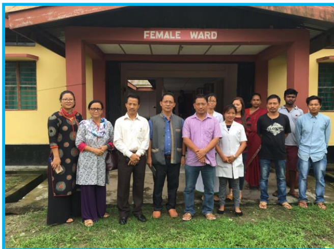
23 RD SEPTEMBER 2016: ARUNACHAL PRADESH STATE LEGAL SERVICES AUTHORITY TEAM VISITED MENTAL HEALTH CENTER, MIDPU