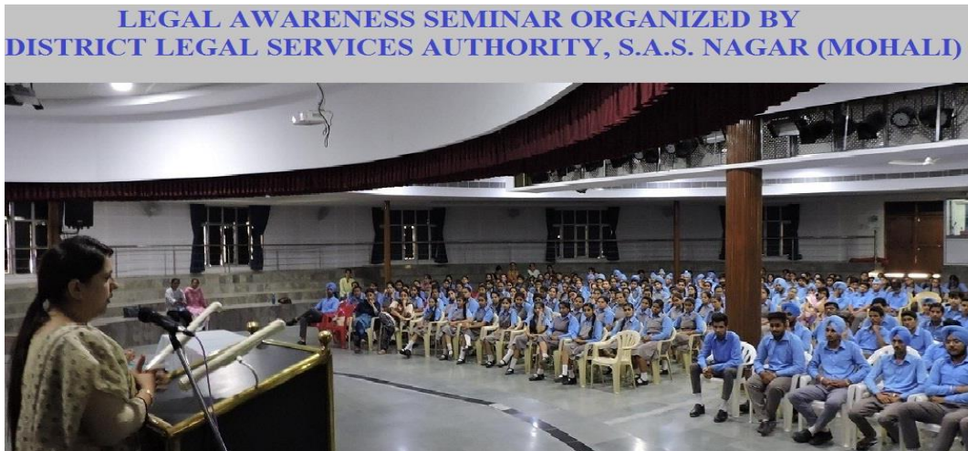
Awareness programme in a school conducted by Secretary, DLSA, SAS Nagar (Mohali).

As per the directions of NALSA, Legal Literacy Clubs are being established in Schools and Colleges to impart legal knowledge to students and to make them aware of their rights and duties. The enlightened students would be the light house of Legal Literacy. Till September, 2016 PULSA had established 2,258 Legal Literacy Clubs in Schools and Colleges in the State.