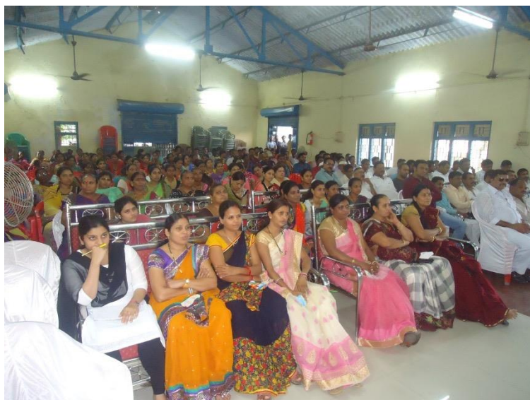
Advocates, Gram Panchayat Members & Villagers