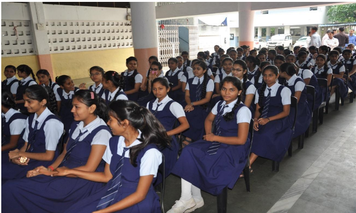
Students of Machhi Mahajan School, Nani Daman.

A programme on “Transgender – Legal Problems & Solutions, ADR Methods and its benefits, Fundamental Duties of the Citizens” was organized on 20.09.2016 at Machhi Mahajan School Hall, Nani Daman.