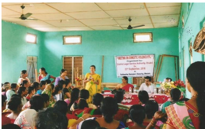
Awareness Camp on Domestic Violence organized by District Legal Services Authority, Dhubri.