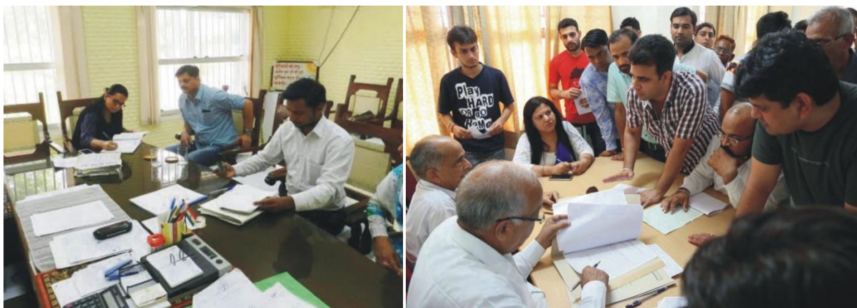
National Lok Adalat being held in different districts of Haryana