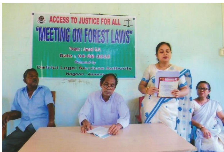
Awareness Camp on “Forest Laws” organized by District Legal Services Authority, Nagaon.

A total of 695 awareness programmes were organized by DLSAs with 56,295 beneficiaries. Some of the topics on which such programmes were organized included POCSO, beneficial schemes of the Government, JJB, CWC, Tribal Rights, Women Empowerment, Domestic Violence, Legal Literacy in Jails, Fundamental rights, Fundamental Duties, Anti-Ragging, Right to Education, Human Rights, NALSA Schemes etc.