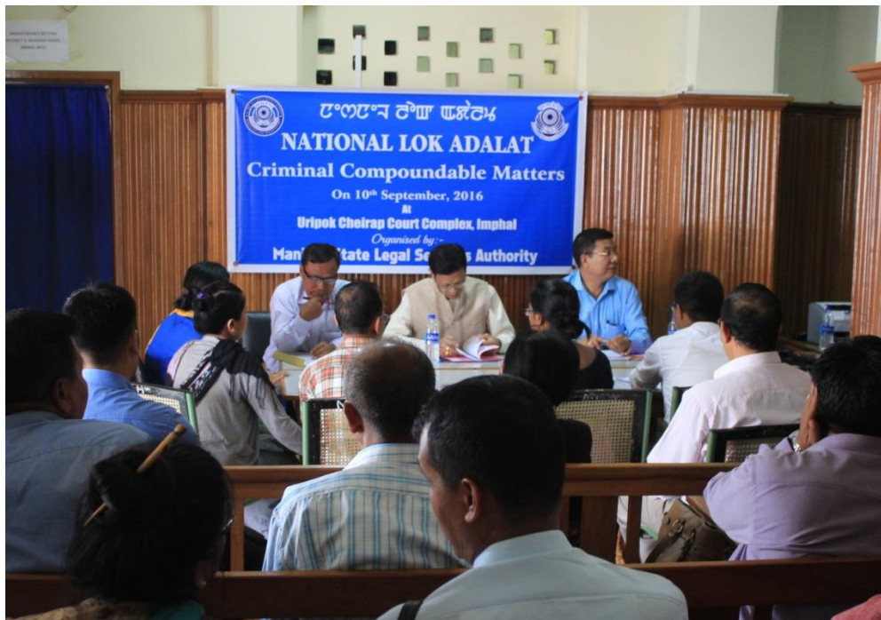
National Lok Adalat held on 10.9.2016 at Cheirap Court Complex, Uripak, Imphal