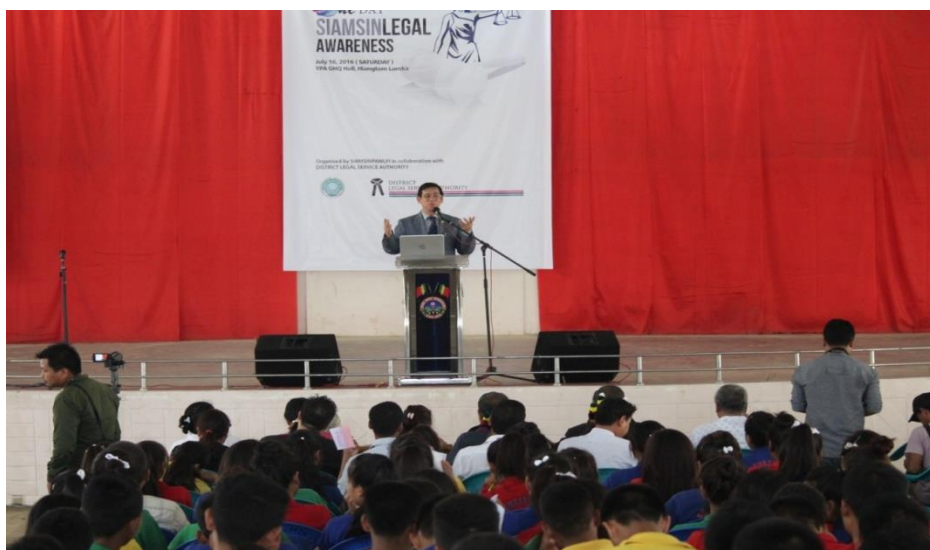
Hon'ble Executive Chairman, MASLSA during a Legal Awareness Programme at Churachandpur District, Manipur on 16.7.2016

Mizoram State Legal Services Authority and the District Legal Services Authorities organized legal awareness campaigns in both urban and rural areas by way of addresses to the public, circulation of pamphlets, etc. Leaflets/booklets were distributed to the participants in the course of the campaign. Awareness functions were held at schools, jails and other places. During the quarter, legal awareness programmes were held in 45 Community Centres/Villages; 8 Schools/Colleges; 4 Jails; 2 Two Talk Show/Dialogues were arranged through Local TV Channels on the topics of Rights of women and children; Corruption laws, The Mizo Marriage, Divorce and Inheritance of Property Act, 2014, POCSO Act, Life Skills, Cyber Crime, PLV & LAC, MLPC Act, ND&PS Act, etc.