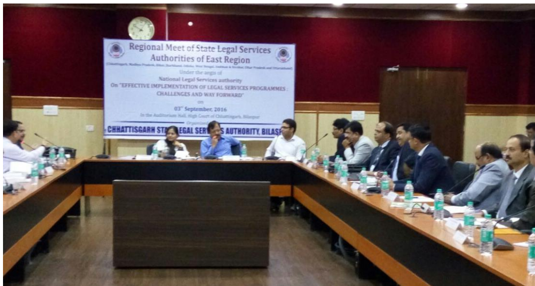
Meeting of the Member Secretaries of the Eastern States including Uttar Pradesh and Uttarakhand with the Member Secretary, NALSA at Chhattisgarh