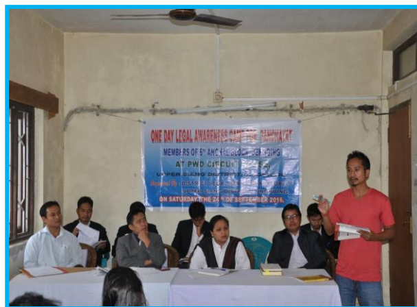
24 TH SEPTEMBER 2016: DLSA ORGANISE ONE DAY LEGAL WARENESS CAMP FOR PANCHAYAT AT YINGKIONG, UPPER SIANG

The Arunachal Pradesh State Legal Services Authority participated in the 50 th Mega Solung Festival Celebration at Pasighat wherein a Legal Services stall was setup with 6 Legal Aid Advocates everyday attending the stall and providing on the spot counselling and aid regarding availability of free legal aid services, schemes and activities available for the citizens in the State. As part of awareness, brochures on subjects such as Arunachal Pradesh Victims Compensation Scheme, Para Legal Volunteers Scheme, Legal Aid Clinics, Lok Adalats, Women's Right to Protection From Domestic Violence, Child Rights, Fundamental Rights, Access to Justice for All under Legal Services Authorities Act, 1987 and Plea Bargaining were distributed to nearly 1469 registered visitors who had visited the stall during the 5 days festival and a documentary film titled "Apne Ajnabe" a film dealing with racial discrimination of North- Eastern people produced by the State Authority was screened for the public.