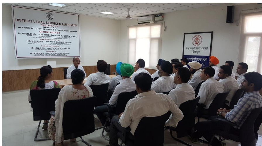
Training of panel lawyers of DLSA, Ferozepur by Master Trainer.