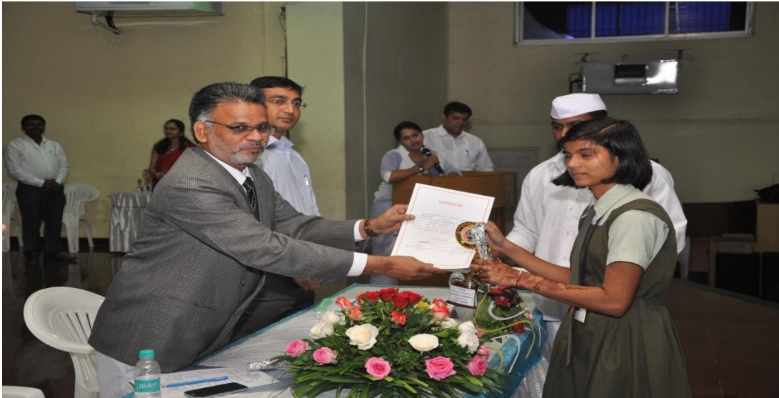
The Chairman, DLDA with Participants of Drawing/Essay Competition

An awareness programme on NALSA Schemes, Right to Education, and Rights to Women was organized on 23.08.2016 at Koli Patel Samaj Hall, Nani Daman.