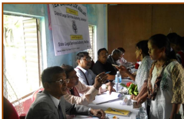
Tea garden Lok Adalat at Bagrakote Tea garden, Jalpaiguri

After the success of the previous Tea Garden Lok Adalats, WBSLSA organised more such Lok Adalats at Bagrakote Tea Garden, Malbazar, Jalpaiguri and Bandapani Tea Gardens, Alipurduar, Jalpaiguri on 24.07.16 and 24.09.16. About 3610 matters were disposed of. The matters varied from old age pension, widow pension to P.F., gratuity, non-issuance of ration card, etc.