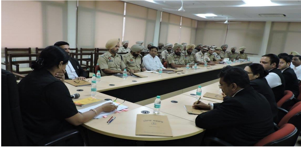
Sensitization programme taken by the District and Sessions Judge-cum-Chairperson, DLSA, SAS Nagar (Mohali) of Police officers of the District.

As per the directions of NALSA, Legal Literacy Clubs are being established in Schools and Colleges to impart legal knowledge to students and to make them aware of their rights and duties. The enlightened students would be the light house of Legal Literacy. Till September, 2016 PULSA had established 2,258 Legal Literacy Clubs in Schools and Colleges in the State.