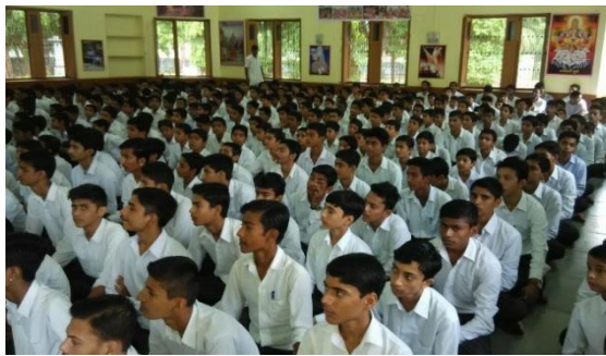
Glimpses of Camps held for preservation of water resources