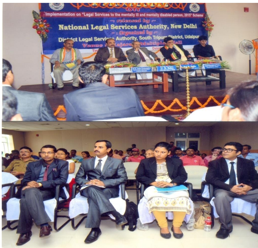
Seminar cum Workshop cum Awareness Programme