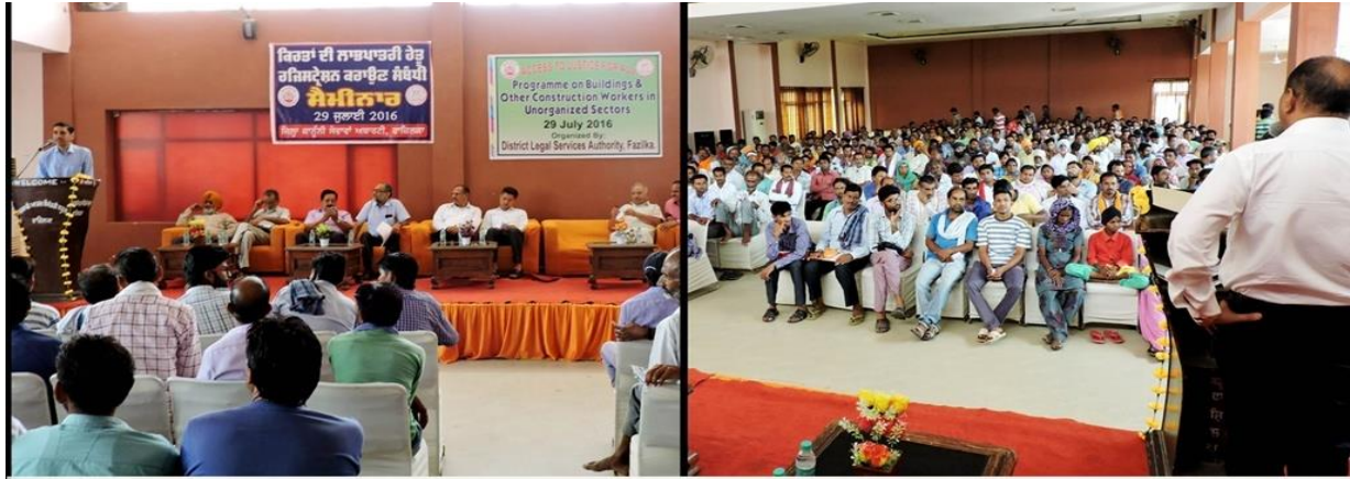
Seminar on Welfare of Workers in unorganized sector held at Fazilka on 29.07.2016.