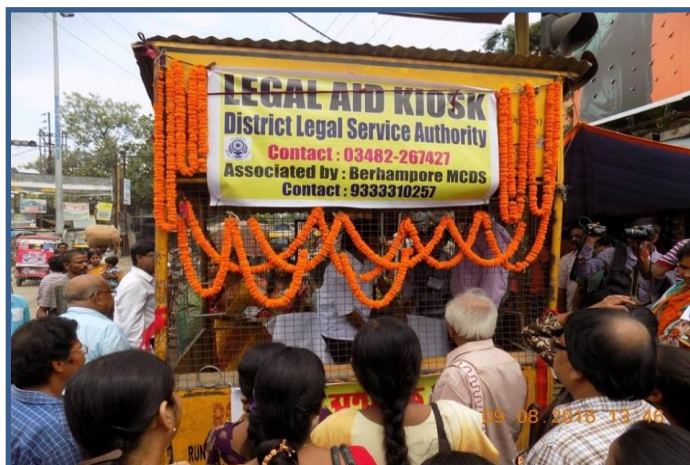
Permanent Legal Aid Kiosk, the first of its type in West Bengal set up at Berhampore Bus Stand at the endeavour of DLSA, Murshidabad on 09.08.2016

Legal aid services during this quarter were given by way of various activities. The District Secretaries paid visits to Homes and Jails. One of the Districts – Murshidabad set up a Legal Aid Kiosk in the vicinity of a busy thoroughfare – a bus stand to render legal aid services especially relating to Motor Vehicles Act.