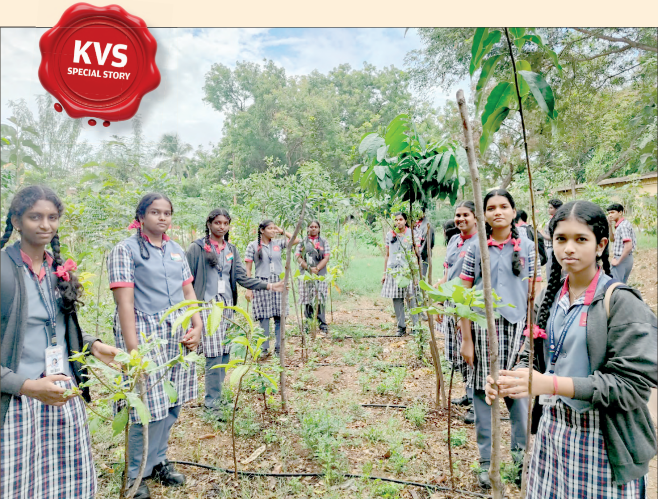
Students of KV Chennai Region Turning Unused Land into Vibrant Miyawaki forests

Sular – A Forest of New Beginnings PM SHRI KV Sular began its Miyawaki project by converting 6,000 sq. ft. of unused land into a green zone. With support from the Indian Oil Corporation, the land was cleared, enriched, and planted with 600 native saplings.