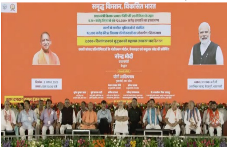
Hon'ble Prime Minister of India Shri Narendra Modi releases 20 th instalment of PM-KISAN in Varanasi, Uttar Pradesh on 2 nd August 2025.