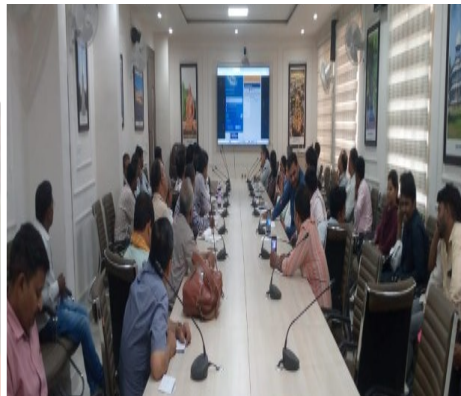
NIC Prayagraj District Centre, Uttar Pradesh: Driving Digital Transformation through eOffice Implementation