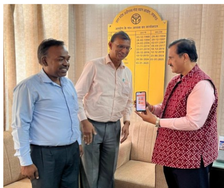
UPSC (Uttar Pradesh Subordinate Services Selection Commission) Mobile App – NIC UP initiative.