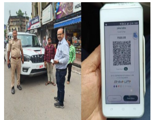
PoS Machine Based Payment System started in Transport Department Uttar Pradesh