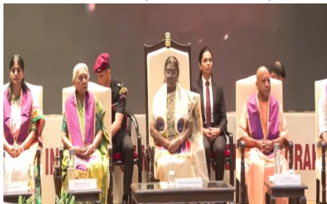
Hon'ble President of India Smt. Droupadi Murmu graces the First Convocation Ceremony of AIIMS Gorakhpur via VC on 30 th June' 2025.

NIC UP conducted more than 1,500 Video Conferences during the last 6 months. These include 46 VC sessions for the VVIPs (Hon'ble PM, Hon'ble Governor, Hon'ble CM & MPs), 1127 VCs were conducted for the Central Information Commission (CIC) and rest for various offices of the State Government including Chief Secretary Office, Home Department, Department of Women & Child Development etc.