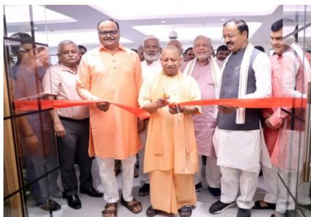
Hon'ble CM, Yogi Adityanath inaugurated NexGen DARPAN and the CM Command Centre at Shastri Bhawan, Lucknow.

NexGen DARPAN is generic, configurable and bilingual copyright product of NIC and provides administrations with at-a-glance insight into departmental activities and scheme monitoring.