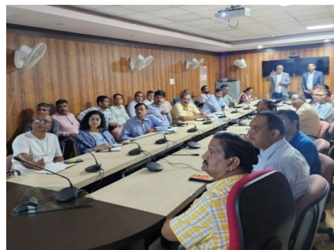
Training by Accops | Exploring IT Solutions for NIC UP - Remote Access, & Security on 20 June 2025