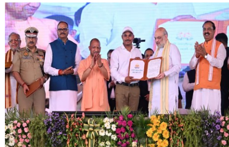
Hon'ble Home Minister Shri Amit Shah and Hon'ble CM UP, Yogi Adityanath distributed 60,244 appointment letters of UP Police, Lucknow (15 th June 2025)