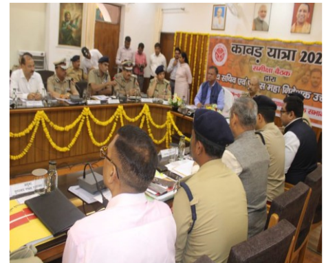
Technical support of NIC UP in Inter-State Meeting for preparation of Kavand Yatra.