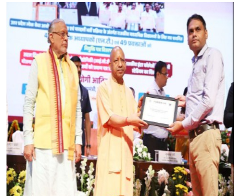
Hon'ble CM Yogi Adityanath distributed appointment letters to Secondary schools new Assistant Teachers via Online Portal developed by NIC Uttar Pradesh.