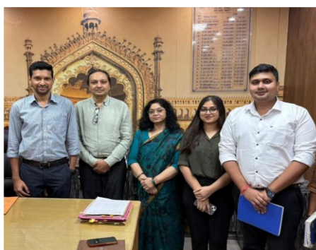
Visit of NIC HQ Delhi Team to NIC UP to study the Digital product E-TuLA (E-Transformation of Legal Metrology Administration) during 22-23 July'2025