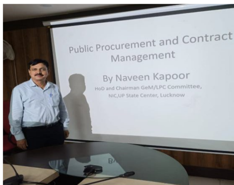
Presentation on Public Procurement and Contract Management NIC, UP State Centre, Lucknow on 11th August 2025