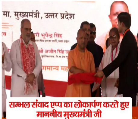
सम्भल संवाद एप्प का लोकार्पण करते हुए माननीय मुख्यमंत्री जी Sambhal SAMWAD App, developed by NIC Sambhal, launched by Hon'ble CM, Yogi Adityanath on 07 August 2025.