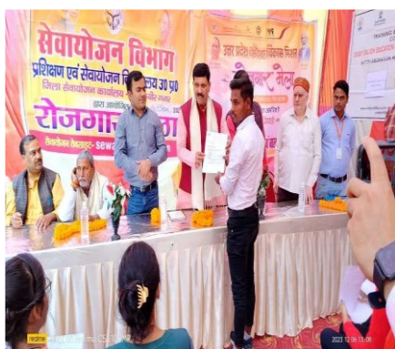
Sewayojan Portal: Empowering Employment in Uttar Pradesh