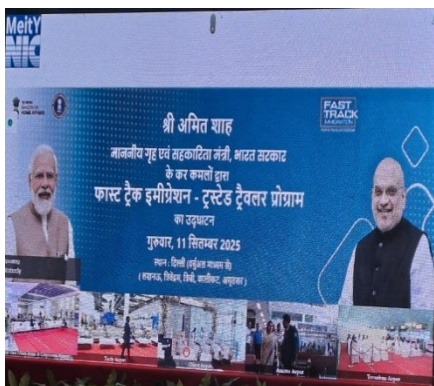
Virtual inauguration of eGate FTI-TTP for Lucknow Airport by Hon'ble Home Minister Shri Amit Shah.