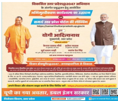
Hon'ble CM UP launched the Portal "Viksit Uttar Pradesh Samarth Uttar Pradesh @ 2047" (samarthuttarpradesh.up.gov.in) on 3 rd Sept' 2025