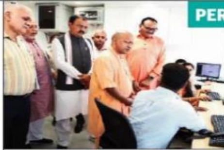
CM Yogi and DyCMs during the launch of dashboard on Sunday