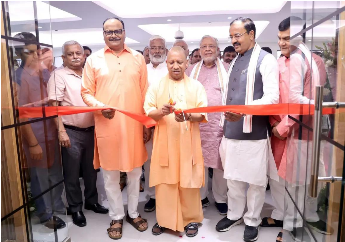
(L-R Dy CM Shri Brajesh Pathak Ji, Shri Swatantra Dev Singh Ji, Hon'ble Yogi Adityanath Ji, Shri Suresh Kumar Khanna Ji, Shri Keshav Prasad Maurya Ji, Shri Arvind Kumar Sharma Ji)