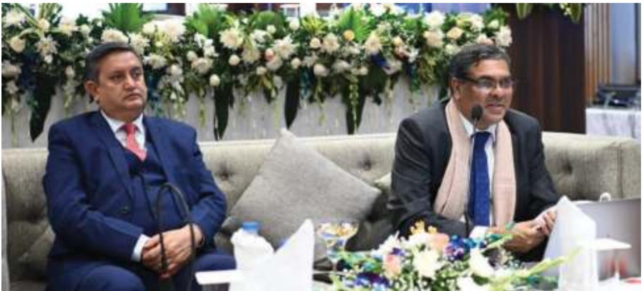
Vignette from State Conference of DLSAs of Himachal Pradesh, Punjab, Haryana & Chandigarh at Dalhousie, Himachal Pradesh

pivotal role of the legal aid functionaries guiding those who find themselves entangled in the complex web of the justice system. He outlined the importance of legal aid at the pre-arrest and arrest stage, while advocating provisioning of legal aid at those stages. He also highlighted the importance of the Under Trial Review Committees which ensure that their incarceration is not needlessly prolonged, especially for petty offences. He also highlighted the important role played by the Legal Aid Defence Counsels and called for further expansion within the system. He also stressed on the transformative power of digital platforms such as the Legal Services Management System and the Legal Aid Case Management System. He called for wider publicity of NALSA's National Helpline No. 15100.