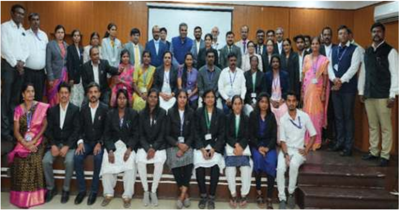
Vignette from interactive session with Panel Lawyers, LADC Counsels and Paralegal Volunteers during the visit to City Civil Court in Bengaluru on 23 rd March, 2024