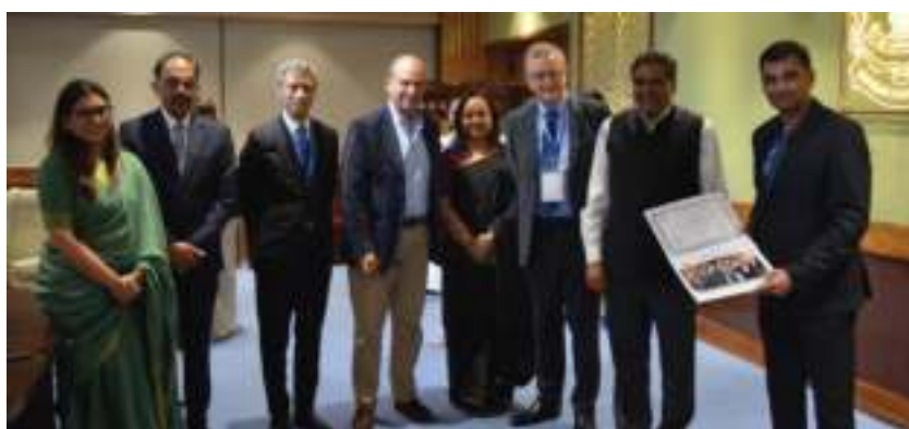
Vignette from the Valedictory Ceremony of the 15-Hours Advanced Commercial Mediation Training Program on 16 th October, 2024

NALSA in collaboration with the International Academy of Mediators, successfully conducted a 15-hours Advanced Commercial Mediation Training Program from 14 th to 16 th October, 2024, at the Supreme Court of India. This three-day event brought together esteemed legal professionals, mediators, and judges to enhance their mediation skills, particularly in managing complex commercial disputes. The program was inaugurated by Hon'ble Mr. Justice Sanjiv Khanna, Judge, Supreme Court of India & Executive Chairman, NALSA in the august presence of Hon'ble Mr. Justice M.M. Sundresh, various members of the Supreme Court Mediation and Conciliation Project Committee, along with representatives from the National Legal Services Authority and the Supreme Court Legal Services Committee. The