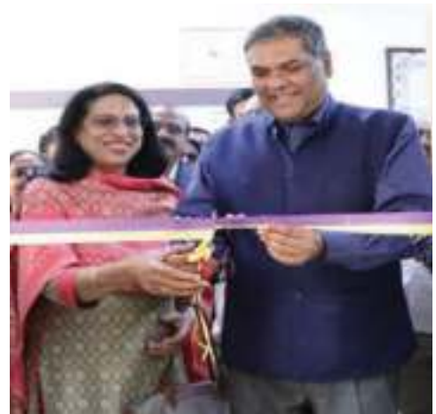
Vignette from the inaugural ceremony of the Legal Service Centre at Panchayat Building at Jalige Village, Devanahalli Taluk, Bengaluru Rural District on 25 th March, 2024