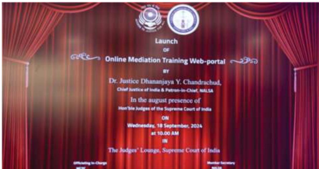
Vignette from the Inaugural Ceremony of the Online Mediation Training Web Portal at The Judges' Lounge, Supreme Court of India