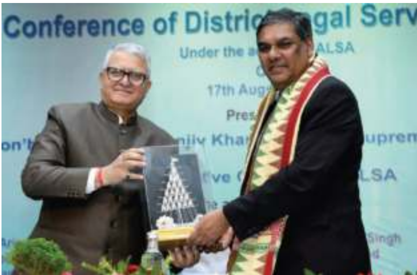
Vignette from State Conference of DLSAs of Odisha on 17 th August, 2024 at the Odisha Judicial Academy, Cuttack, Odisha

On 17 th August, 2024, Odisha State Legal Services Authority organized the Conference of District Legal Services Authorities of Odisha at the Odisha Judicial Academy, Cuttack. The said Conference was presided over by Hon'ble Mr. Justice Sanjiv Khanna, Judge, Supreme Court of India and Executive Chairman, NALSA in the presence of Hon'ble Mr. Justice Chakradhari Sharan Singh, Chief Justice, High Court of Orissa and Patron-