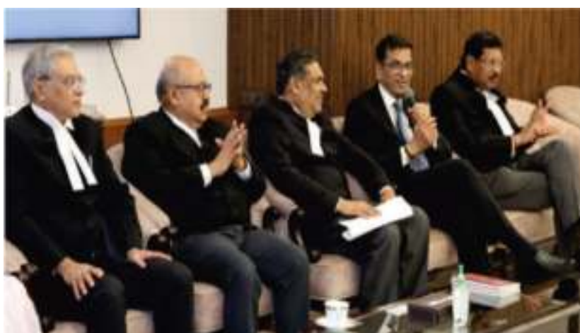
Vignette from the Inaugural Ceremony of the Online Mediation Training Web Portal at The Judges' Lounge, Supreme Court of India

It is one of the institutional mandates of NALSA to advance the use of alternative dispute resolution mechanisms. In line with this, the Online Mediation Training Web-Portal was officially launched on 18 th September, 2024, by Hon'ble Dr. Justice D.Y. Chandrachud, Chief Justice of India & Patron-in-Chief, NALSA along with Hon'ble Justice Sanjiv Khanna, Judge, Supreme Court of India & Executive Chairman, NALSA at the Supreme Court of India. This significant initiative was developed by NALSA in collaboration with the Mediation and Conciliation Project Committee of Supreme Court of India with a view to promote