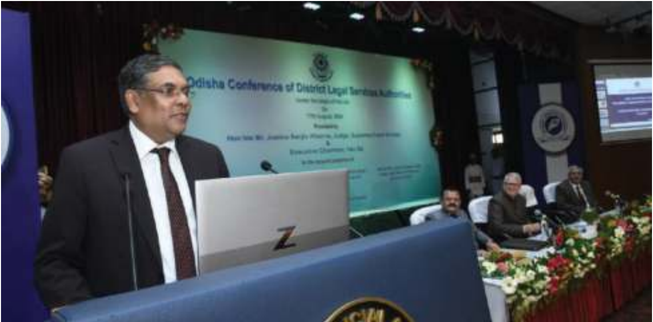
Vignette from State Conference of DLSAs of Odisha on 17 th August, 2024 at the Odisha Judicial Academy, Cuttack, Odisha