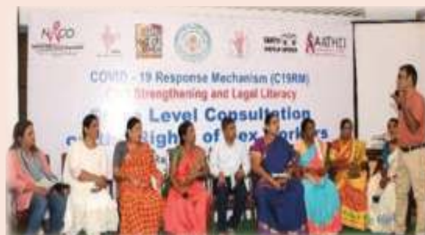
led a session on the Transgender Persons (Protection of Rights) Act, 2019.