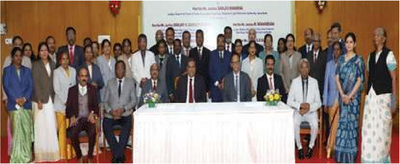
Vignettes from the Conference of DLSAs of Tamil Nadu and Puducherry at Chennai, Tamil Nadu on 28 th April, 2024

for improvement and explore means to increase the outreach and acceptability of Legal Services Institutions and services offered by them. During the visit, the Hon'ble Executive Chairman, NALSA, visited the barracks for the inmates; the Prison Hospital; the kitchen; the Vocational Training Centre; the Prison Legal Services Clinic etc. He also interacted with the prison inmates, jail officials, doctors and counsellors posted at the Prison Hospital.