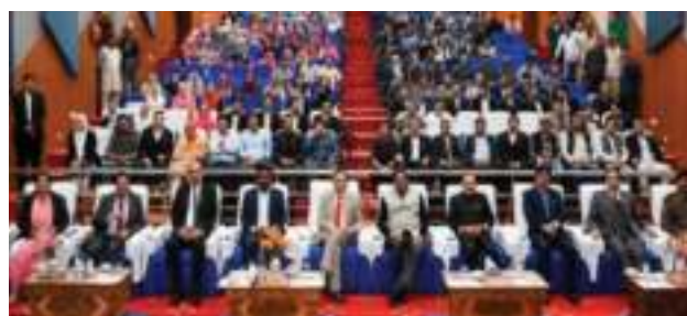
Vignettes from the Conference of DLSAs of Jammu & Kashmir and Ladakh in June, 2024