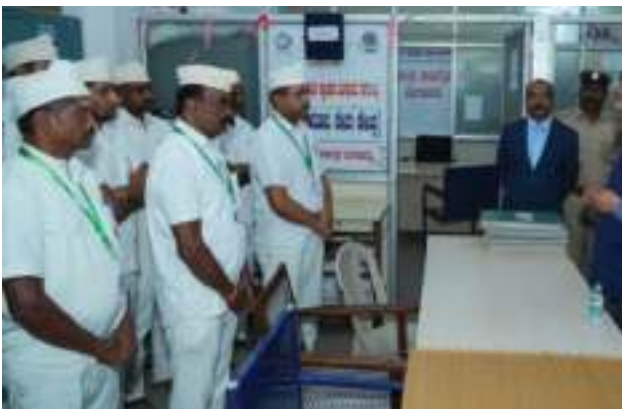
Vignette from visit to the Parappana Agrahara Central Prison in Bengaluru on 23 rd March, 2024