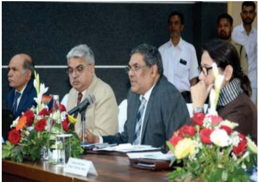
Vignette from the State Conference of DLSAs of Madhya Pradesh on 13 th January, 2024 at Bhopal, Madhya Pradesh

Hon'ble Mr. Justice Sanjiv Khanna, Judge, Supreme Court of India & Executive Chairman, NALSA chaired the State Conference of DLSAs of Madhya Pradesh on 13 th January, 2024 at Bhopal, Madhya Pradesh. This Conference was attended by the Member Secretary, NALSA; Member Secretary, M.P. SLISA; Chairmen and Secretaries of DLSAs of Madhya Pradesh. The Conference agenda was to discuss the ground level challenges, concerns, solutions, and get feedback from the Legal Services functionaries.