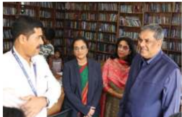
Vignette from the visit to Jalige Village, Devanahalli Taluk, Bengaluru Rural District on 25 th March, 2024