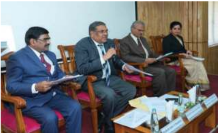
Vignette from State Level Conference of DLSAs of Karnataka on 24 th March, 2024