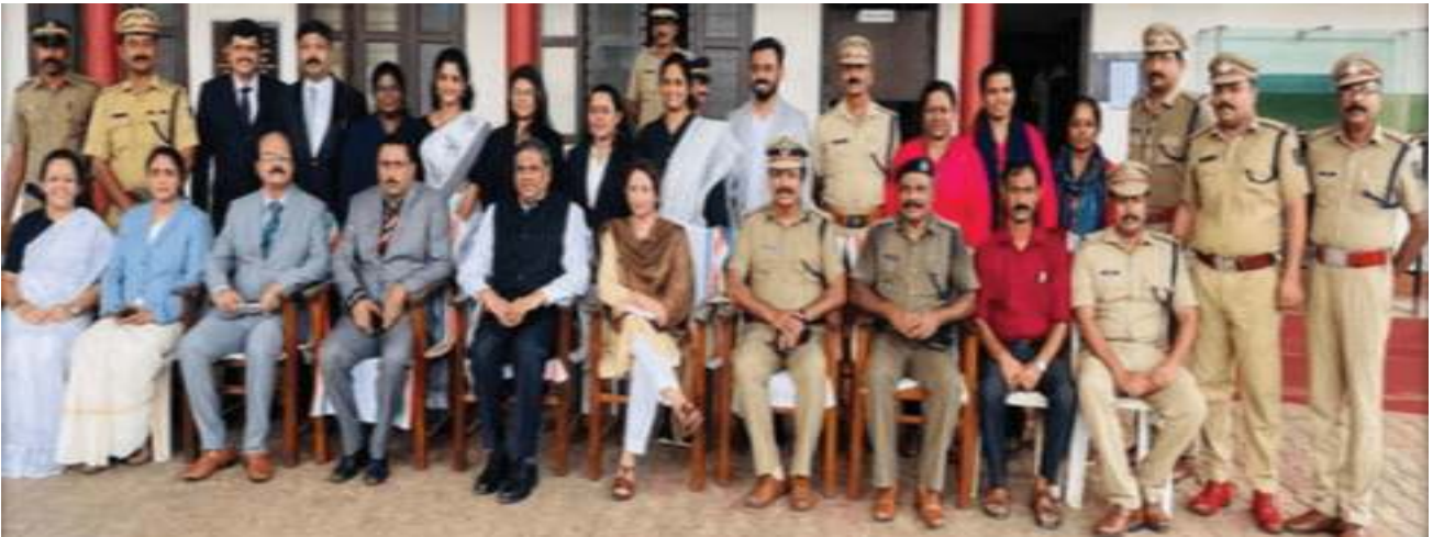
Vignettes from the Conference of DLSAs of Kerala and Lakshadweep on 6 th June, 2024