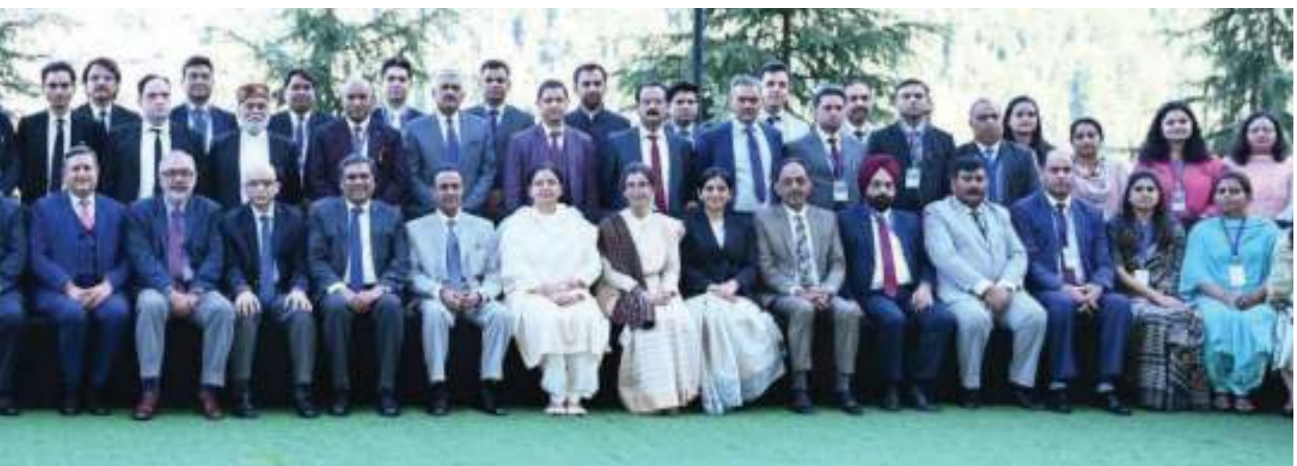
Vignette from State Conference of DLSAs of Himachal Pradesh, Punjab, Haryana & Chandigarh at Dalhousie, Himachal Pradesh

During the session, Justice Khanna also interacted with the Para Legal Volunteers (PLVs), who have recently been given an alternative nomenclature “ Adhikar Mitr ”, Anganwadi Workers, Legal Aid Defence Counsels etc. He commended them for their unwavering dedication and discussed the hurdles being faced by them, offering words of encouragement and strategies for overcoming challenges. Justice Khanna emphasized the crucial need to place PLVs at key junctures—Legal Aid Clinics, Police Stations, and public offices—where their presence could directly benefit the common citizen. He encouraged them to utilize Government e- Seva Kendras and Mobile Vans to raise legal awareness, extending the reach of justice to the farthest corners of the land.