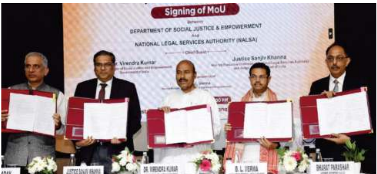
Vignette from the MoU Signing Ceremony on 30 th September, 2024 at Dr. Ambedkar International Centre, Janpath, New Delhi