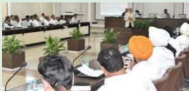
Assistant Legal Aid Defense Counsels from Punjab, Haryana, and U.T. Chandigarh.

In June and July 2024, the State Legal Services Authority, U.T. Chandigarh, conducted capacity-building programs for Legal Aid Defense Counsels, following the directives of the National Legal Services Authority. The training sessions, held in collaboration with the Chandigarh Judicial Academy, focused on critical topics such as framing charges, electronic evidence, the rights of suspects, bail applications, and provisions under the POCSO and NDPS Acts, enhancing the skills of Chief, Deputy Chief, and