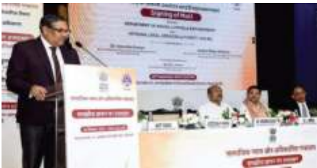
Vignette from the MoU Signing Ceremony on 30 th September, 2024 at Dr. Ambedkar International Centre, Janpath, New Delhi