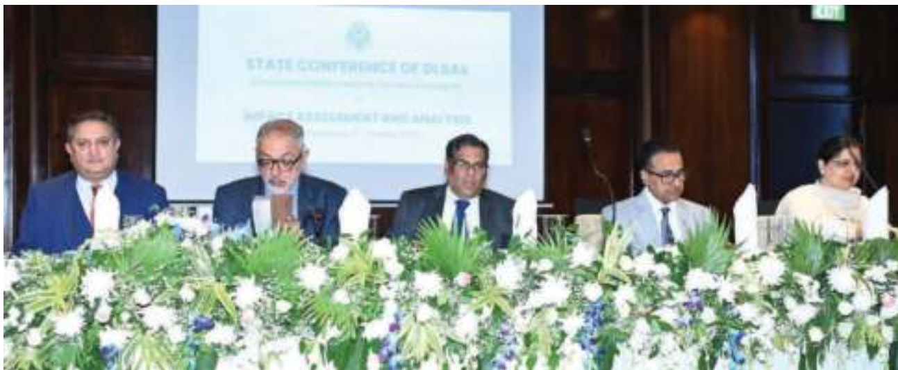
Vignette from State Conference of DLSAs of Himachal Pradesh, Punjab, Haryana & Chandigarh at Dalhousie, Himachal Pradesh

On 6 th October, 2024, the State Conference of District Legal Services Authorities of Himachal Pradesh, Punjab, Haryana and Chandigarh, State Legal Services Authorities was organised at Dalhousie, Himachal Pradesh under the aegis of NALSA. The Conference aimed at enhancing coordination and collaboration amongst DLSAs and provided a platform for addressing common challenges, sharing best practices, and strengthening the implementation of legal aid and justice delivery services across the region.