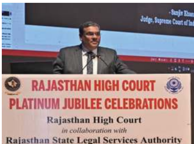
Vignettes from the Conference of DLSAs of Rajasthan at Jaipur, Rajasthan on 30 th March, 2024