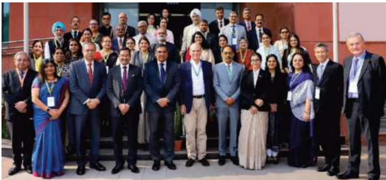
Vignette from the Inaugural Day of the 15-Hours Advanced Commercial Mediation Training Program on 14 th October, 2024 at the Administrative Buildings Complex, Supreme Court of India