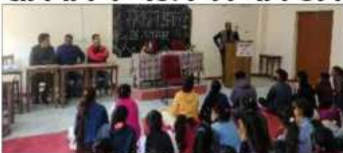
छात्रों को संविधान के महत्व के बारे में बताया गया