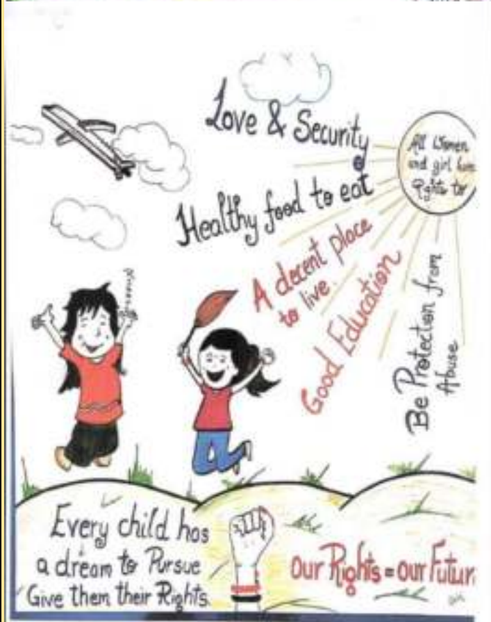
Tarvi Rawat Grade 8