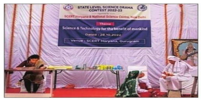
राज्य स्तरीय विज्ञान नाटक प्रतियोगिता में प्रस्तुति देते छात्र-छात्राएं।

राज्य स्तरीय विज्ञान नाटक प्रतियोगिता का आयोजन