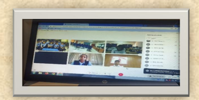
Dipstick Study on Low Performance of Class 3 Govt. School Students of Mahendergarh in Language (As per NAS 2021) (Report submitted to NCERT)