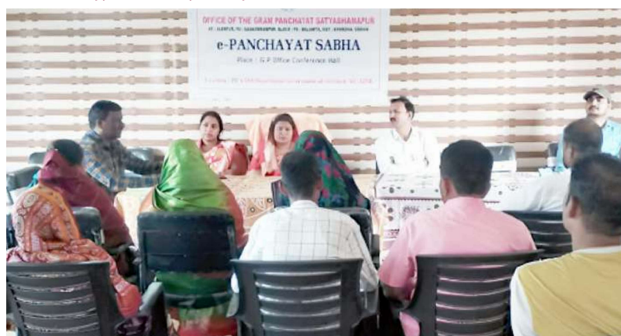
▼ Fig 7.2 : A glimpse of ePanchayat Sabha meeting scheduled using e-Panchayat Sabha Application at Satyabhamapur, Odisha