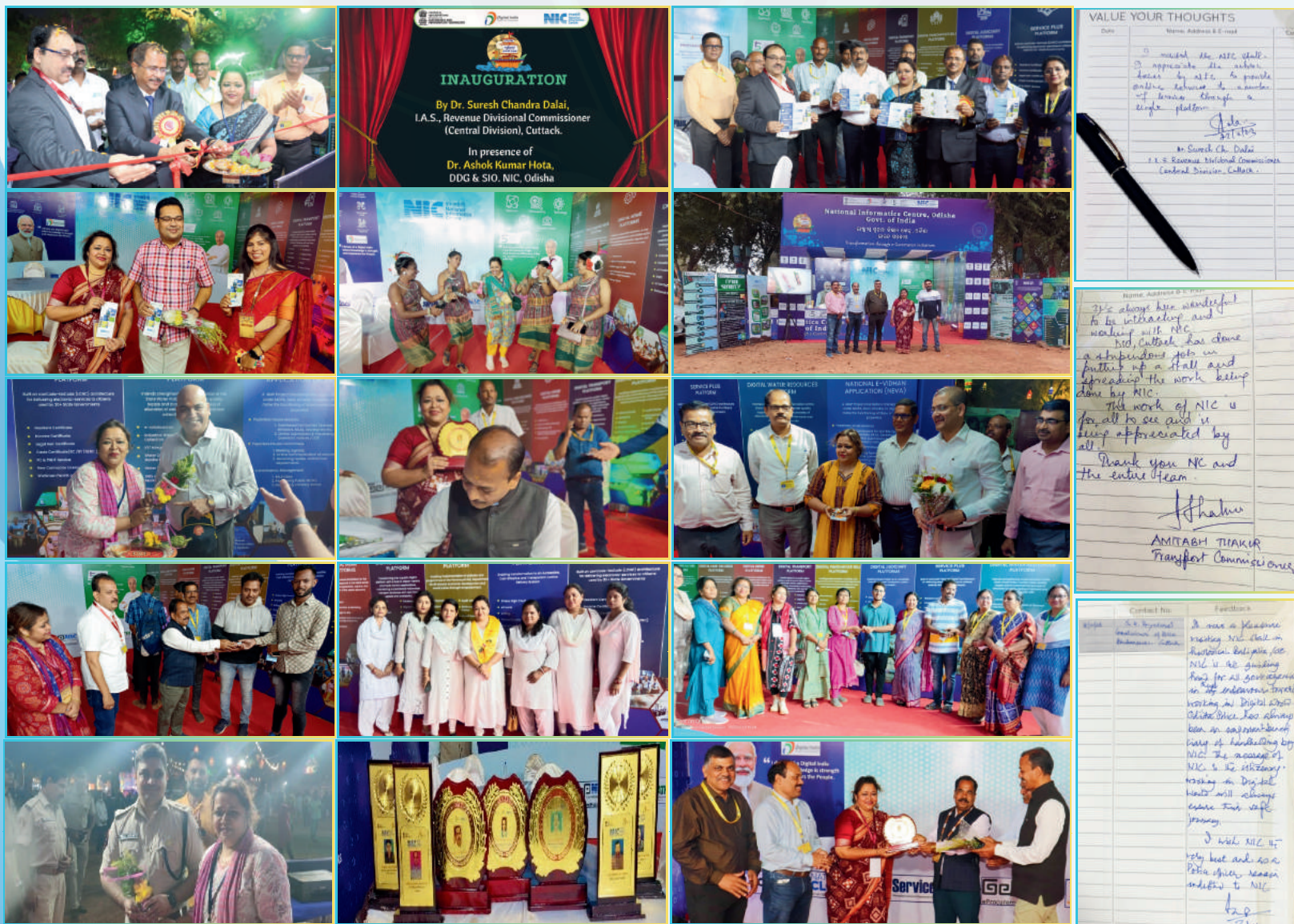
Glimpses from activities / visitors at NIC Pavilion and their views