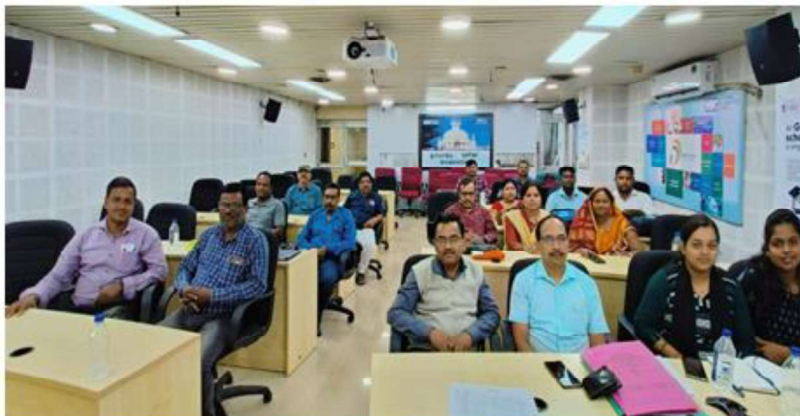
Training on 29.11.2022

Panchayats and officials of Panchayati Raj & Drinking Water Department, Government of Odisha have been conducted at NIC, Odisha State Centre, Bhubaneswar on 23.11.2022, 29.11.2022 and 14.12.2022.