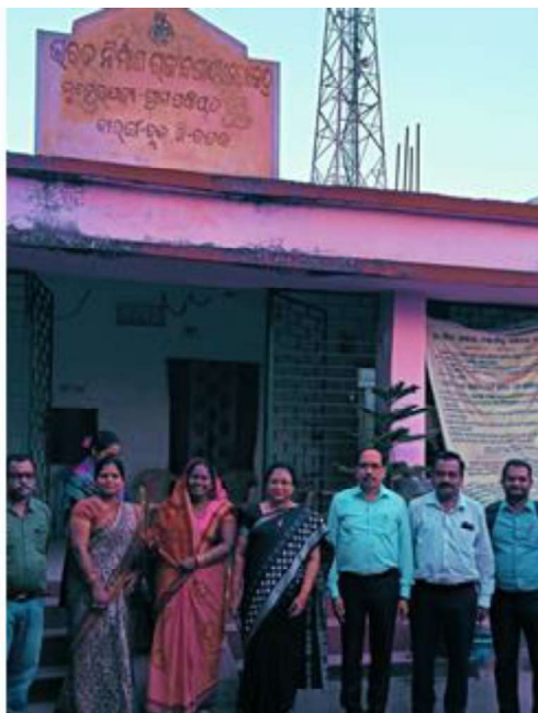
Sarapanch, Panchayat Executive officer and GRS with Development Team from NIC, OSC, Bhubaneswar on 26.12.2022