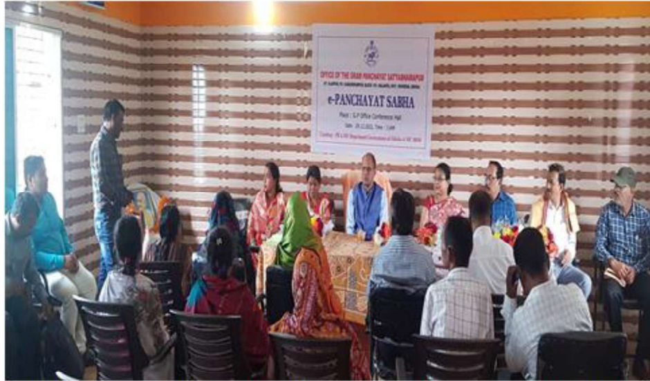
Panchayat Executive Officer is briefing the members of the Meeting regarding aim, objectives and benefits of e-Panchayat Sabha in presence of Development Team from NIC, OSC, Bhubaneswar and Officials of PR & DW Dept, Govt. of Odisha on 29.12.2022