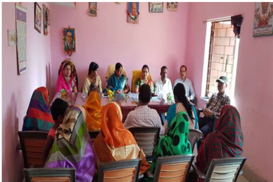
Sarapanch is briefing the members of the Meeting regarding aim, objectives and benefits of e-Panchayat Sabha in presence of Development Team from NIC, OSC, Bhubaneswar and Officials of PR & DW Dept, Govt. of Odisha on 27.12.2022