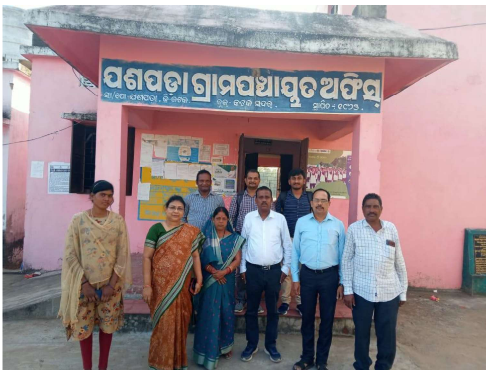
Sarapanch, Naib-Sarapanch, District Panchayat Officer, Panchayat Executive officer and GRS with Development Team from NIC, OSC, Bhubaneswar on 27.12.2022