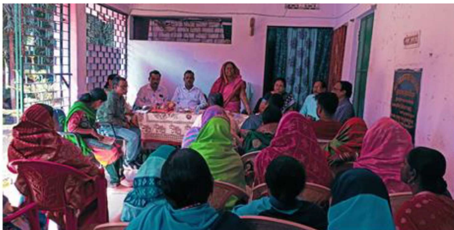
Sarapanch is briefing the members of the Meeting regarding aim, objectives and benefits of e-Panchayat Sabha in presence of Development Team from NIC, OSC, Bhubaneswar and Officials of PR & DW Dept, Govt. of Odisha on 26.12.2022