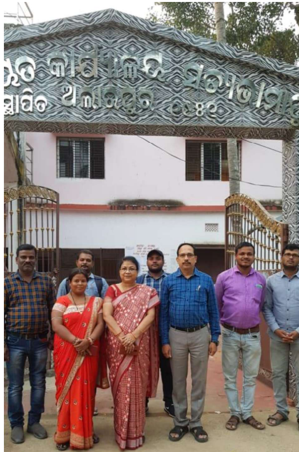
Sarapanch, Panchayat Executive officer and GRS with Development Team from NIC, OSC, Bhubaneswar on 29.12.2022