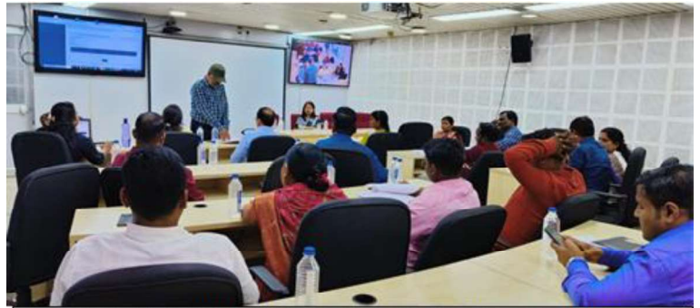
Officer from PR & DW Dept. briefing the objective on 23.11.2022

For smooth implementation of the application, the Panchayati Raj & Drinking Water Department, Government of Odisha has identified 04 Gram Panchayats namely Kunheipada & Jashapada of Cuttack district and Itipur & Satyabhamapur of Khordha district for pilot implementation of the application. 03 rounds of training for Sarapanchs, Panchayat Executive Officers and Gram Rojgar Sahayaks of these four Gram