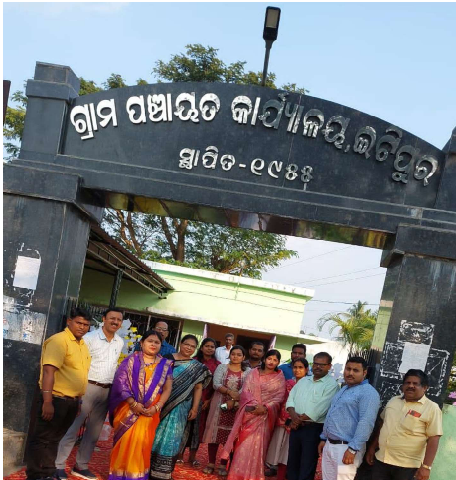
Director, PR and Other Officials of PR & DW Dept, Govt. of Odisha , Sarapanch, Panchayat Executive officer and GRS with Development Team from NIC, OSC, Bhubaneswar on 28.12.2022