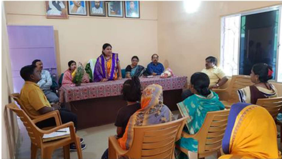
Sarapanch is briefing the members of the Meeting regarding aim, objectives and benefits of e-Panchayat Sabha in presence of Development Team from NIC, OSC, Bhubaneswar and Officials of PR & DW Dept, Govt. of Odisha on 28.12.2022