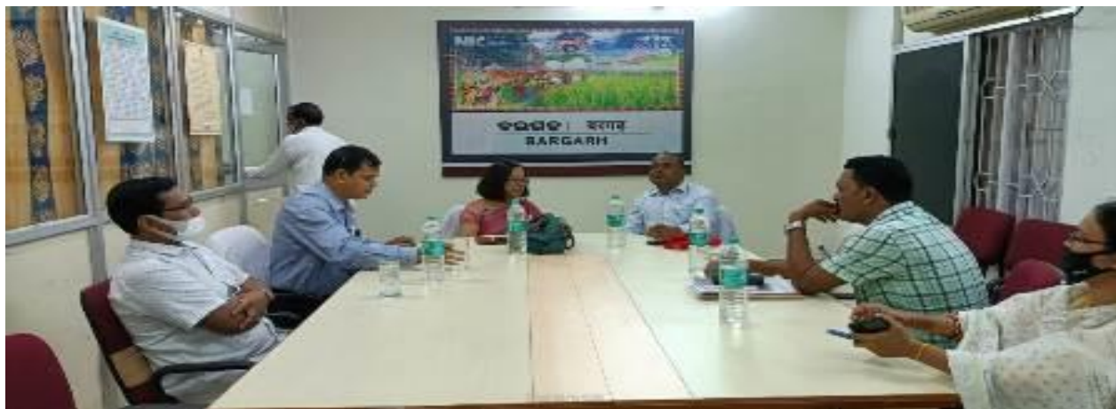
Meeting with ADM, RTO and other district level officers at Bargarh