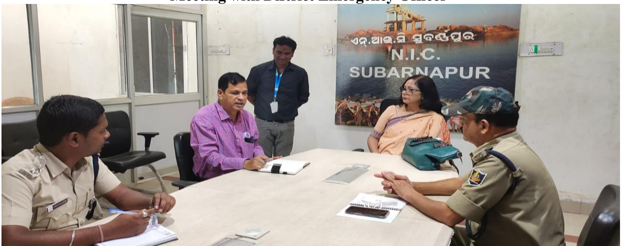
Meeting with Additional SP, RTO, MVI at Sonapur