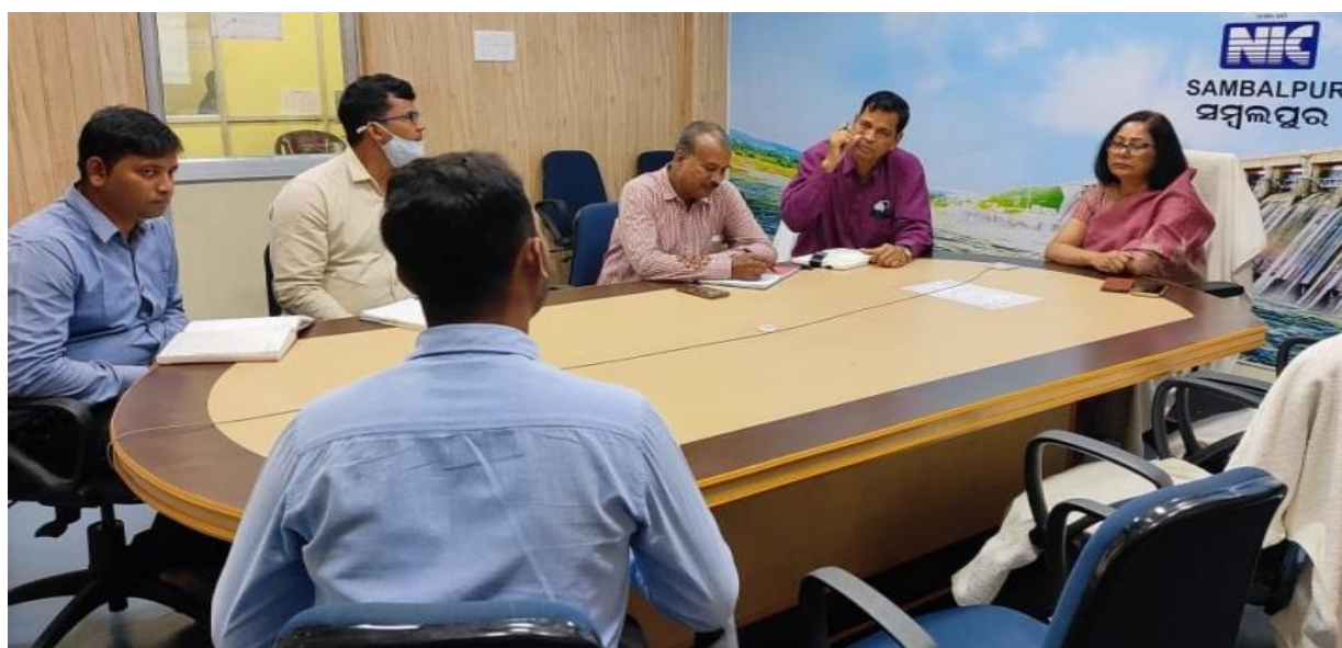
Review of iRAD Project with Additional RTO, MVI & DRM at Sambalpur