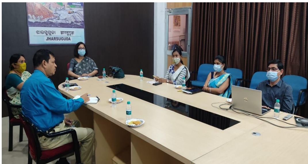
Meeting with District level officers, PD RR, DEO at Jharsuguda.

Collector suggested to implement e-Office in SamagraSiksha and DRDA, Jharsuguda. He requested for a demo of e-Hospital through VC with NIC which can be helpful for the district. He also requested SIO for development of a Portal to monitor the status of projects of the district including CSR projects.