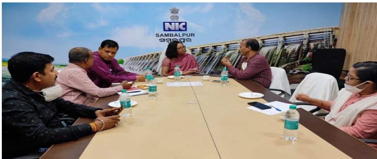
Meeting with ADM(revenue ) and officers and review on e-Pauti & eDistrict