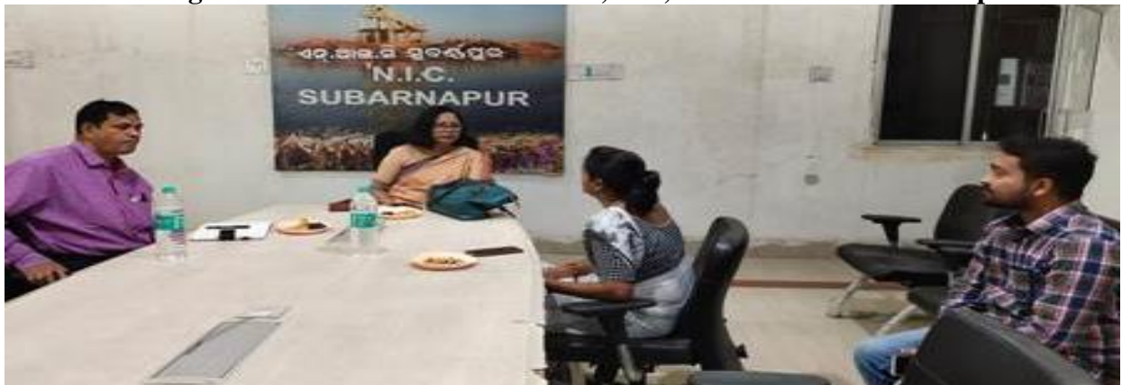
Meeting with District Emergency Officer