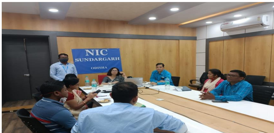
Review of different projects with District level Officers at Sundergarh

The Collector & DM, Sundargarh expressed his desire for computerization of Govt Medical College and Hospital, Sundargarh (e-Hospital, Dynamic web site, Student and Staff Management system and Leased line connectivity etc.), Unified Calendar for meeting schedule for Collector & District Magistrate, Sundargarh and implementation of e-Office upto Block, GP and Tahasil level.