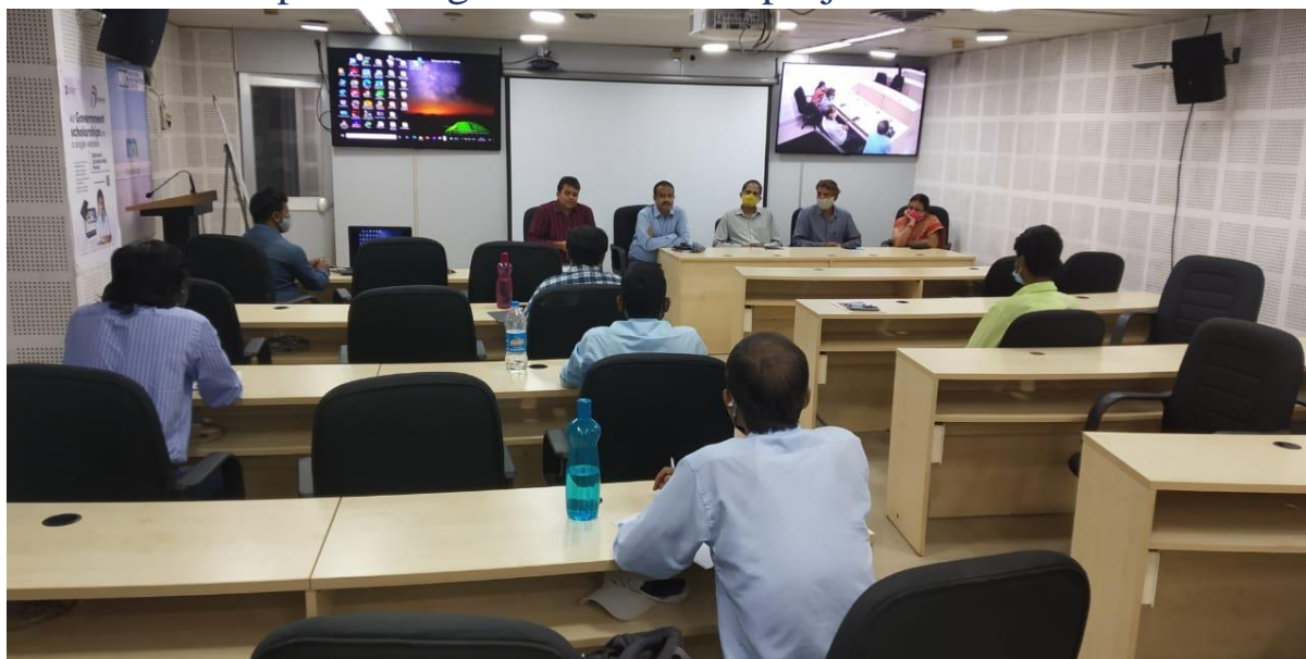
HODs presenting details of their projects and activities