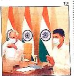
Chief minister Naveen Patnaik at the Jaunch of Online applications of the RTO in Bhubaneswar

Bhuhancswar: Different services at the regional transport offices (RTOs) are now just a click away as chief minister Naveen Patnaik on Wednesday rolled out nine online services related to the state transport authority (STA) under the ST initiative. Prominent among the ST unline services is UMANG, a mobile App, which is used to apply for leaner's licence (LL).