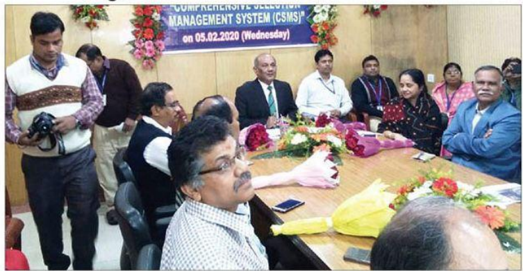
କଟକ, ୫୧୨ (ବୁଧବାର): ଓଡ଼ିଶା ଲୋକସେବା ଆୟୋଗ (ଓପିଏସ୍‌ସି) ଓ ଏନ୍‌ଆଇଏ ମିଳିତ ସହଯୋଗରେ ଓପିଏସ୍‌ସିର ନୂତନ ଡ୍ୱେବ୍ ପୋର୍ଟାଲ ଲୋକାର୍ପିତ ହୋଇଯାଇଛି।

କଟକ, ୫୧୨ (ବୁଧବାର): ଓଡ଼ିଶା ଲୋକସେବା ଆୟୋଗ (ଓପିଏସ୍‌ସି) ଓ ଏନ୍‌ଆଇଏ ମିଳିତ ସହଯୋଗରେ ଓପିଏସ୍‌ସିର ନୂତନ ଡ୍ୱେବ୍ ପୋର୍ଟାଲ ଲୋକାର୍ପିତ ହୋଇଯାଇଛି। ଓପିଏସ୍‌ସିର ଅନ୍ତର୍ଜାତୀୟ ଉଦ୍ଦେଶ୍ୟ ହେଉଛି ଲୋକସେବା ଆୟୋଗର ସେବାକୁ ଉନ୍ନତ କରିବା ଏବଂ ଲୋକସେବା ଆୟୋଗର ସେବାକୁ ଉନ୍ନତ କରିବା। ଓପିଏସ୍‌ସିର ଉଦ୍ଦେଶ୍ୟ ହେଉଛି ଲୋକସେବା ଆୟୋଗର ସେବାକୁ ଉନ୍ନତ କରିବା ଏବଂ ଲୋକସେବା ଆୟୋଗର ସେବାକୁ ଉନ୍ନତ କରିବା।