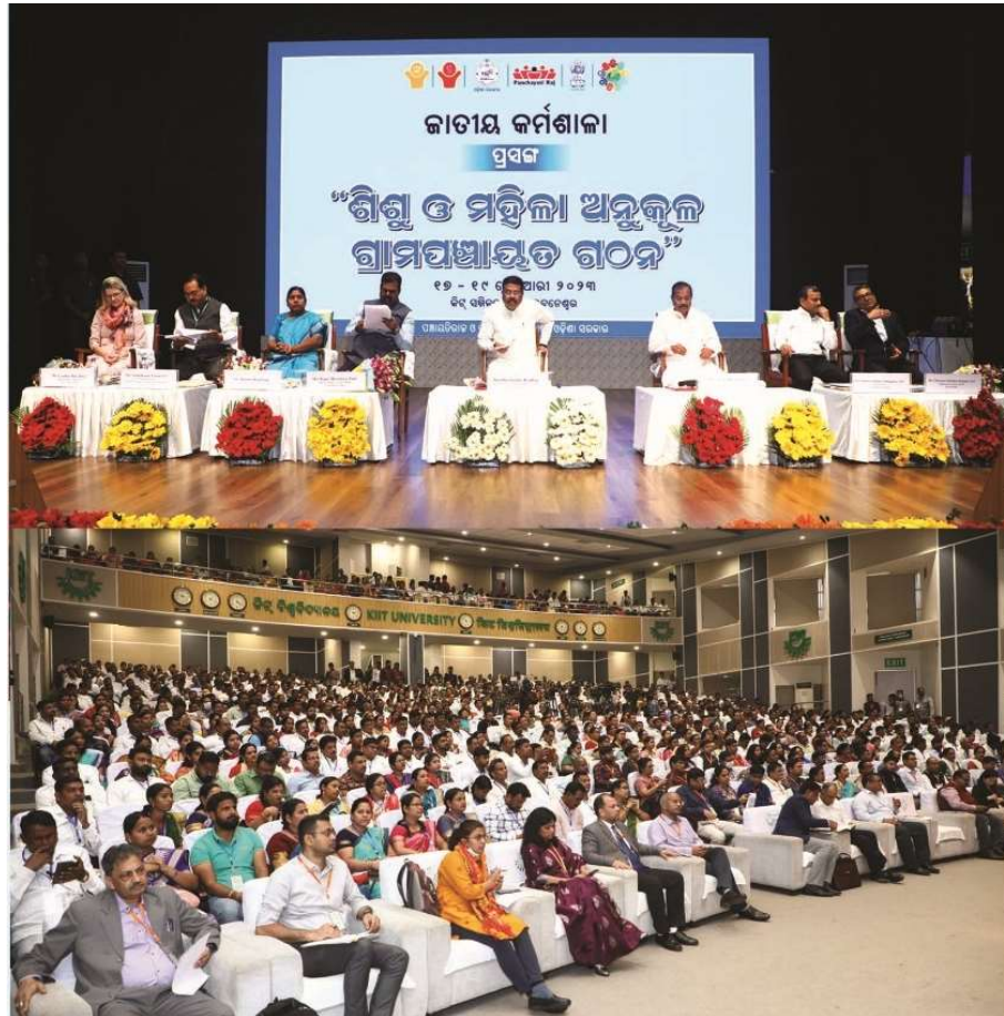
KIIT University Campus, Bhubaneswar, Odisha