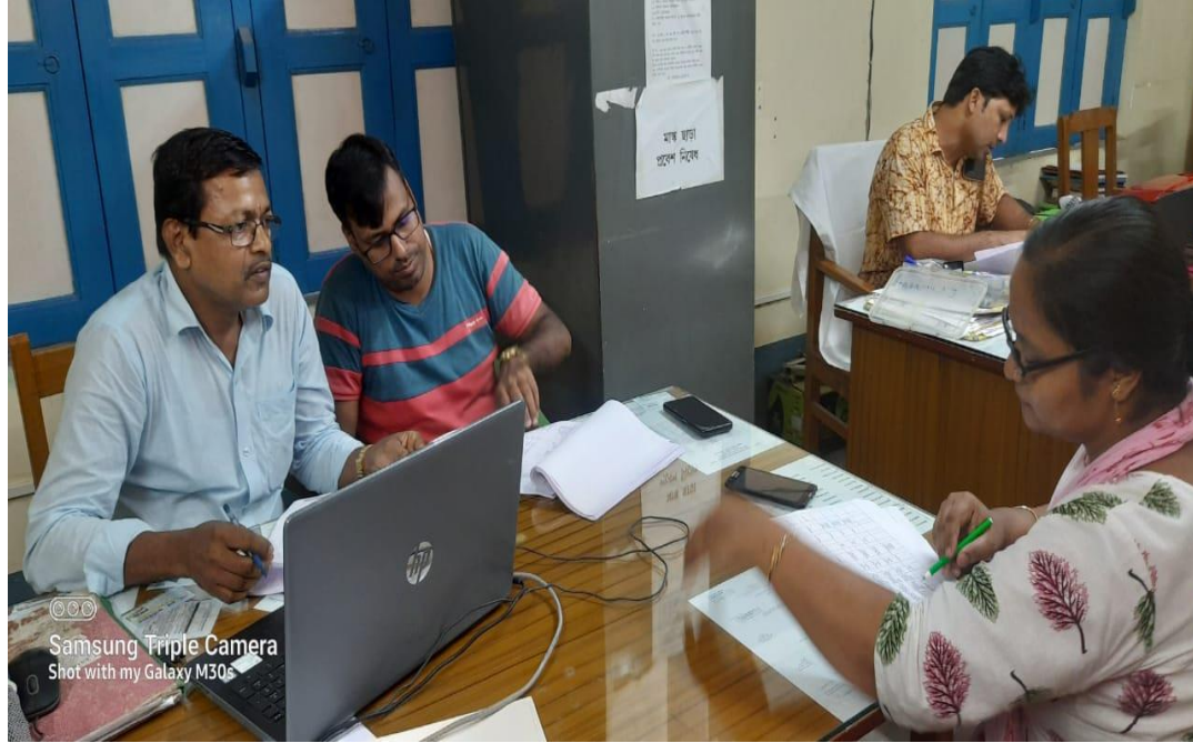
Madarat Gram Panchayat on 1/8/2023