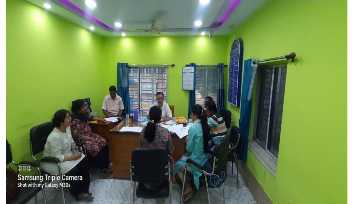
Ramnagar-I Gram Panchayat on 2/08/2023