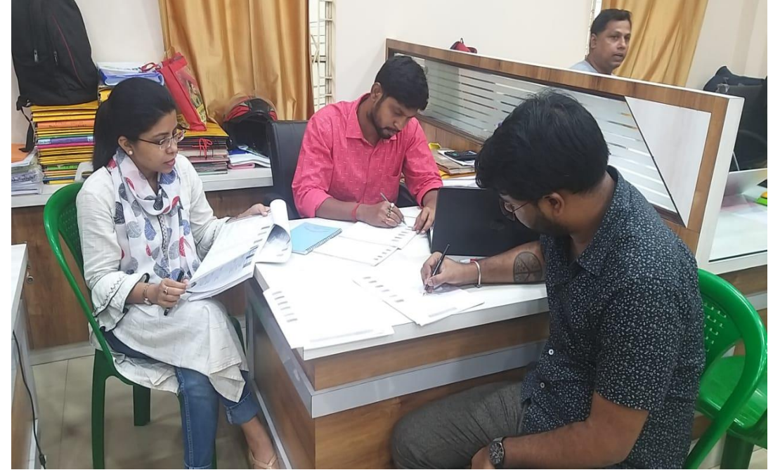
Champahati Gram Panchayat on 1/8/2023