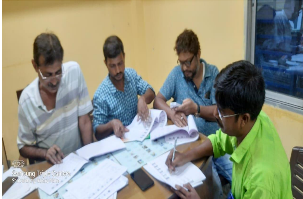
Hariharpur Gram Panchayat on 01/08/2023