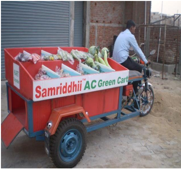
Samriddhii motorized vegetable vending cart