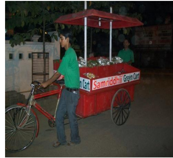
Samriddhii vegetable vending cart