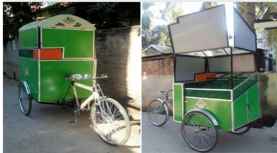
Rickshaw mounted vegetable vending cart