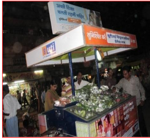
Solar vending cart