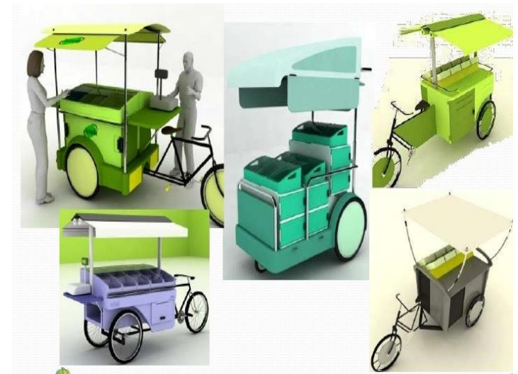
Innovative Designs of Thermal insulated Vending Cart developed earlier