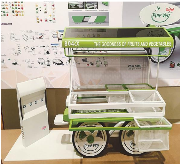
Safal vegetable vending cart