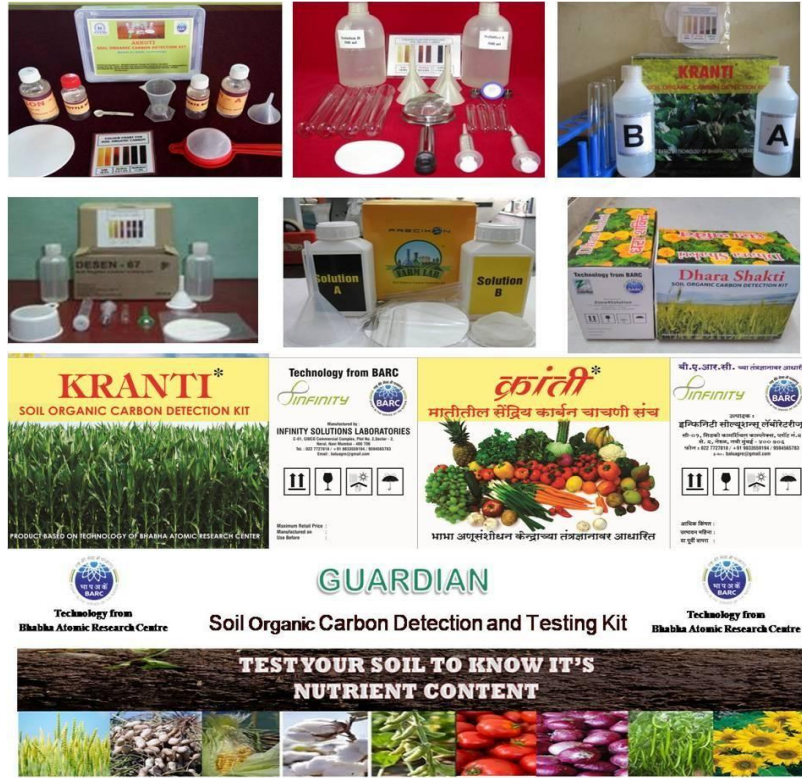
Fig 2: Different kits are available in the market based on BARC technology.

Farmers have become more aware about ill effects of chemical day by day and consumers are also demanding organic foods. This kit is an excellent tool to test the organic nature of soil. As this is quick method and all the farmers can perform it on the field, then farmer doesn't have to rely on other agencies for the results. Organic carbon detection kit has become an important tool in organic agriculture which is going to be agriculture of coming years.