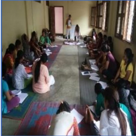
Concept Seeding of CLF, VO