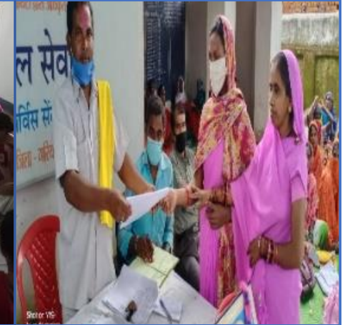
Presentation and submission of VPRP at Gram Sabhas