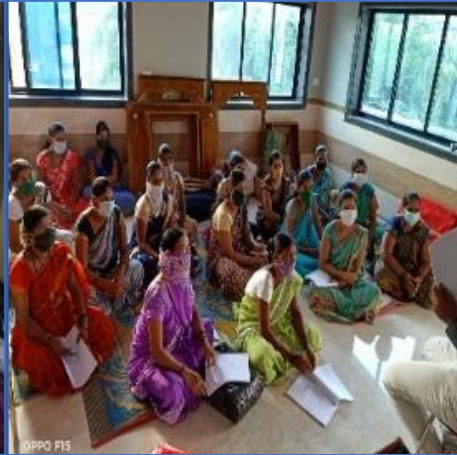
Development of SHG level plans