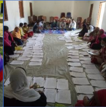
GP Level prioritization and consolidation of plans