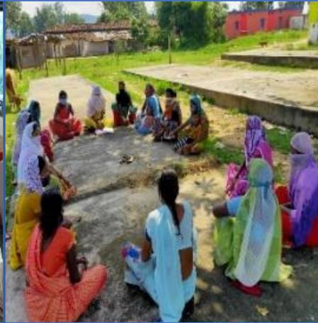
VO -level consolidation of SHG plans and development of VO level plans