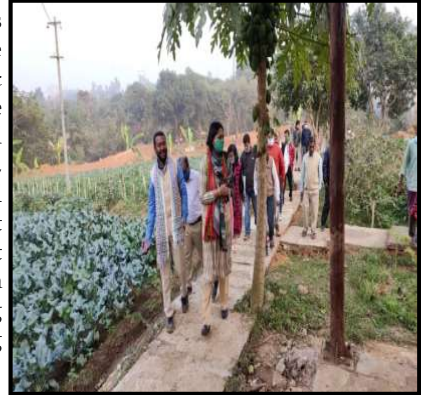
Dragon Fruit Garden

The Panchayat Samiti placed its fund to the Agriculture Department for Organic Farming & Fishery Department for the creation of water bodies and fingerling production. Last year, Panchayat Samiti earned Rs.95000/- by selling different vegetables, and this year Panchayat Samiti has already earned an amount of Rs.1,30,024/-by selling different vegetables from its selling corner.