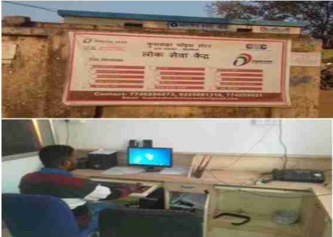
Image: Wi-fi Connection provided at Panchayat Bhawan

Overall, this GP has highlighted a great achievement through improvements in the sectors of revenue generation, education and digitization mostly through self perseverance showcasing a lesson for all.