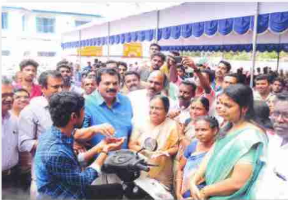
Image: Tri-wheelers being provided to differently abled