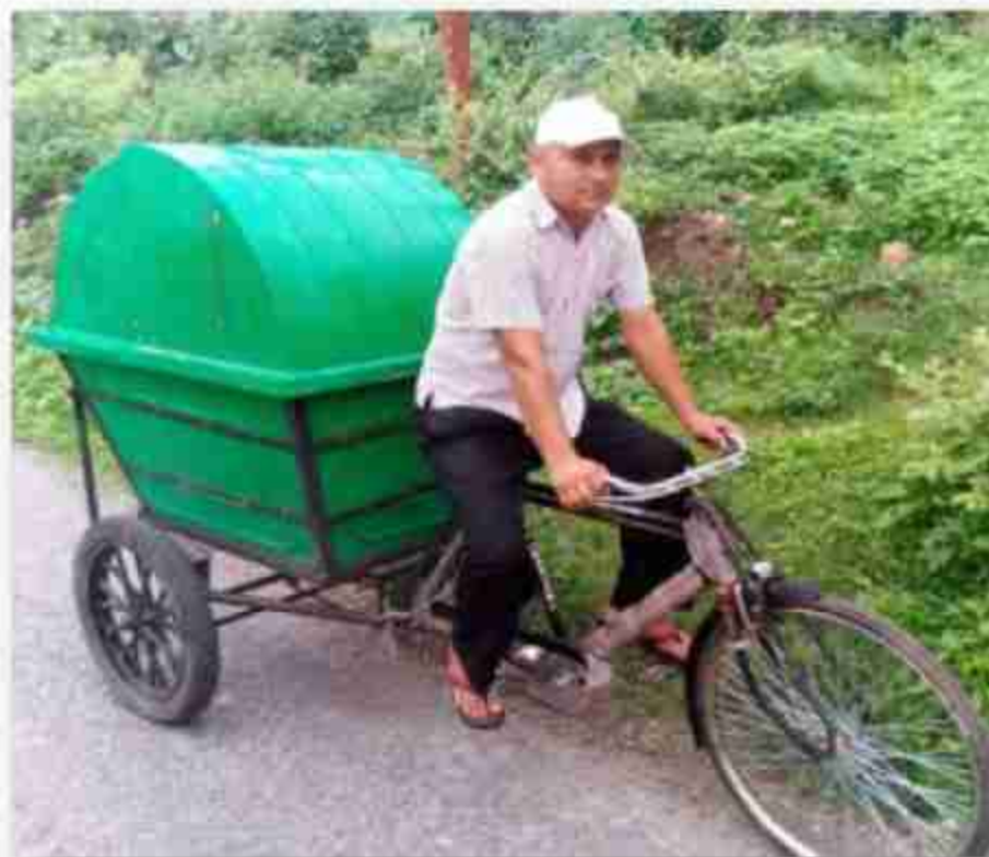
Image: Waste/ Garbage collection in closed bins

To ensure safety of the locals including women and children, 25 street lights have been installed in this GP.