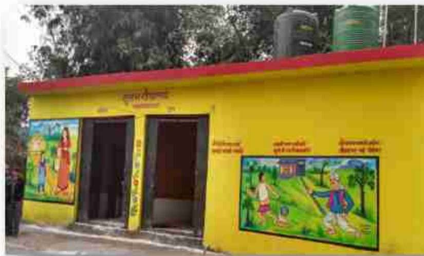
Image: Community toilet with water facility