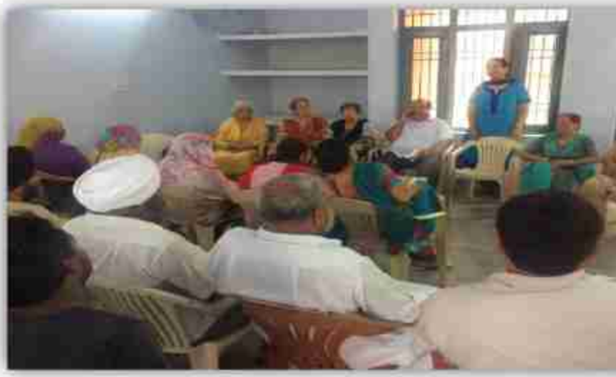
Image: Discussions being held between panchayat members and officials of Punjab University.