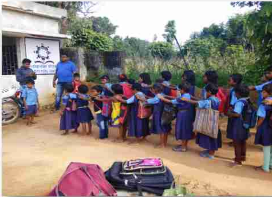
Image: Primary School with good participation from girl child