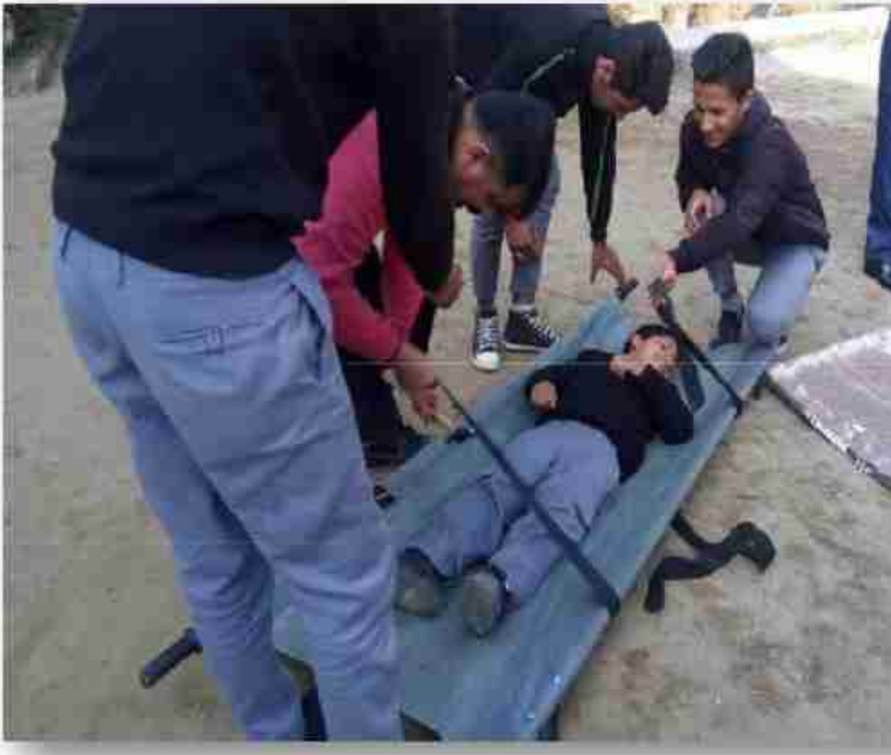
Image: Disaster Management mock drills being conducted in school