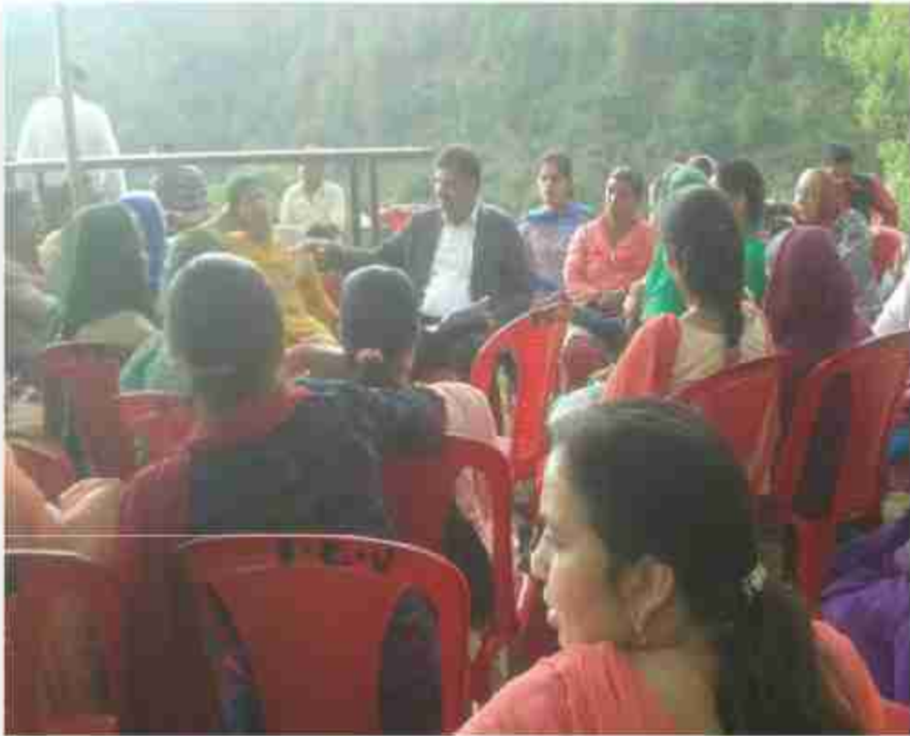
Image: Interaction between locals and State Govt.'s official.