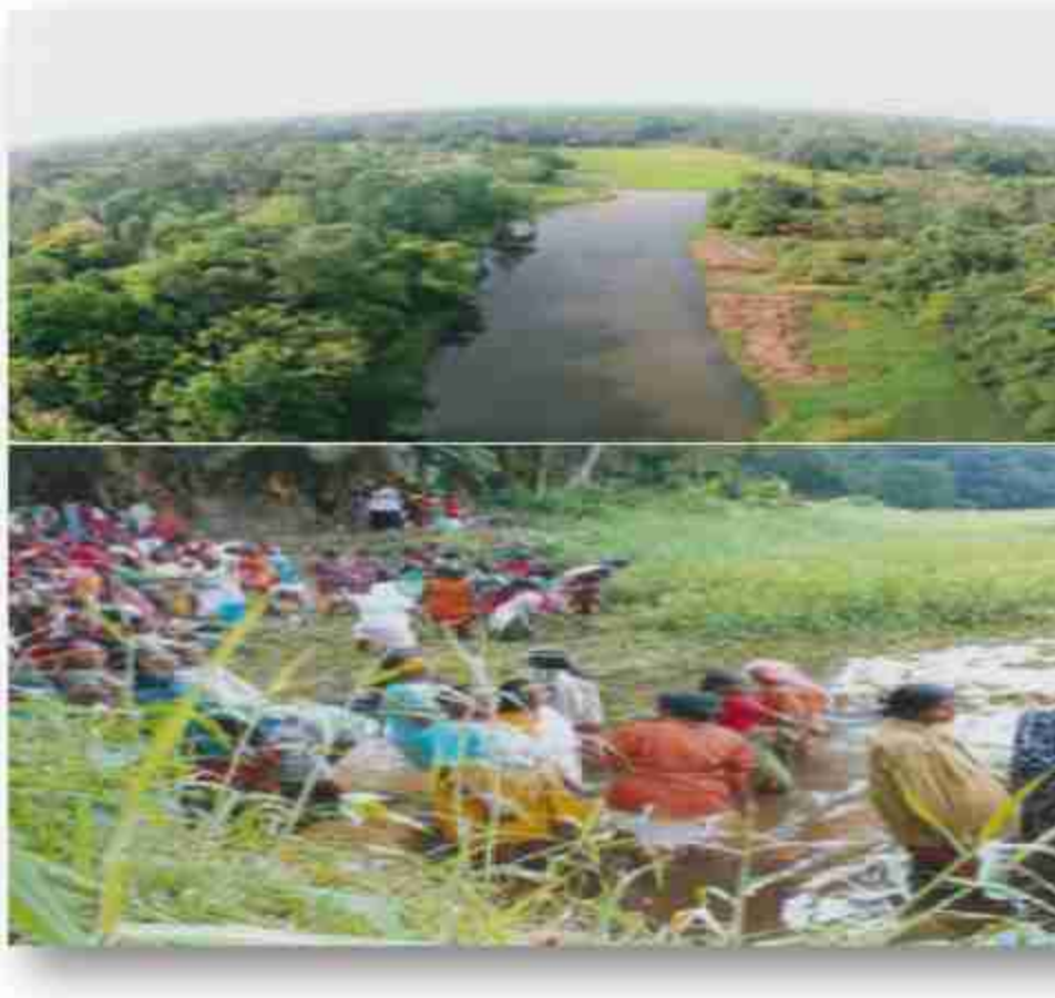
Images: Renovation of Kuttamperoor River done by locals

Further, it would be appropriate to mention that notably, Budhanoor Panchayat is ODF and every household has drinking water facilities and electricity. Locals understand the importance of natural resources available and sustaining their lives through it and thus undertook renovation of Kuttamperoor River. Hence, the locals have achieved a cordial relationship with the nature while earning a living out of it.