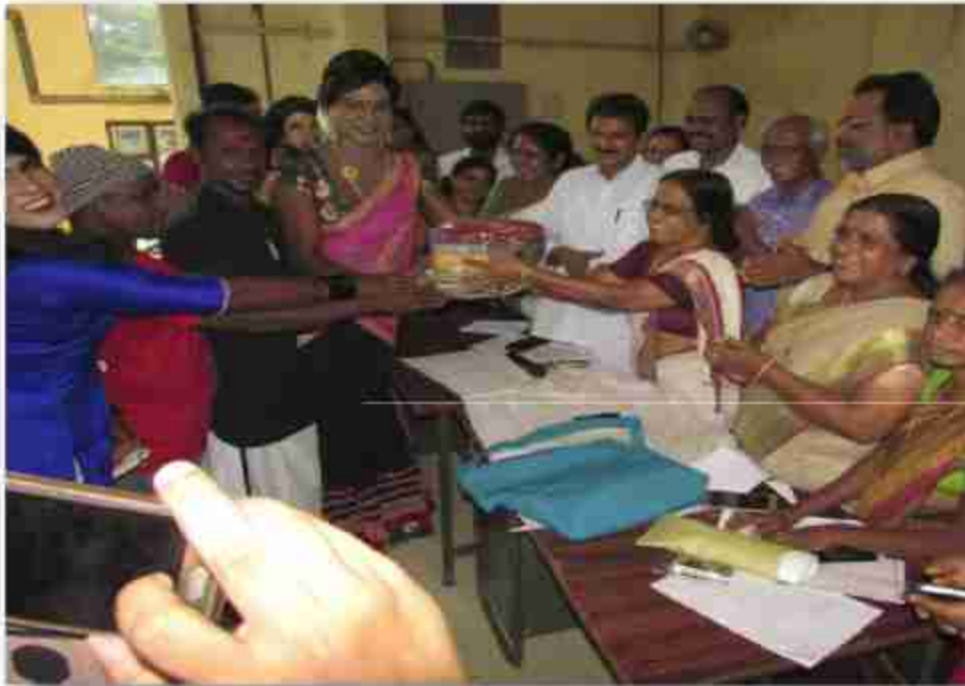
Image: Makeup materials being distributed to Transgender community

above it. This unit conducted 241 camps in 2016-17 and around 3,000 farmers were benefitted out of it.