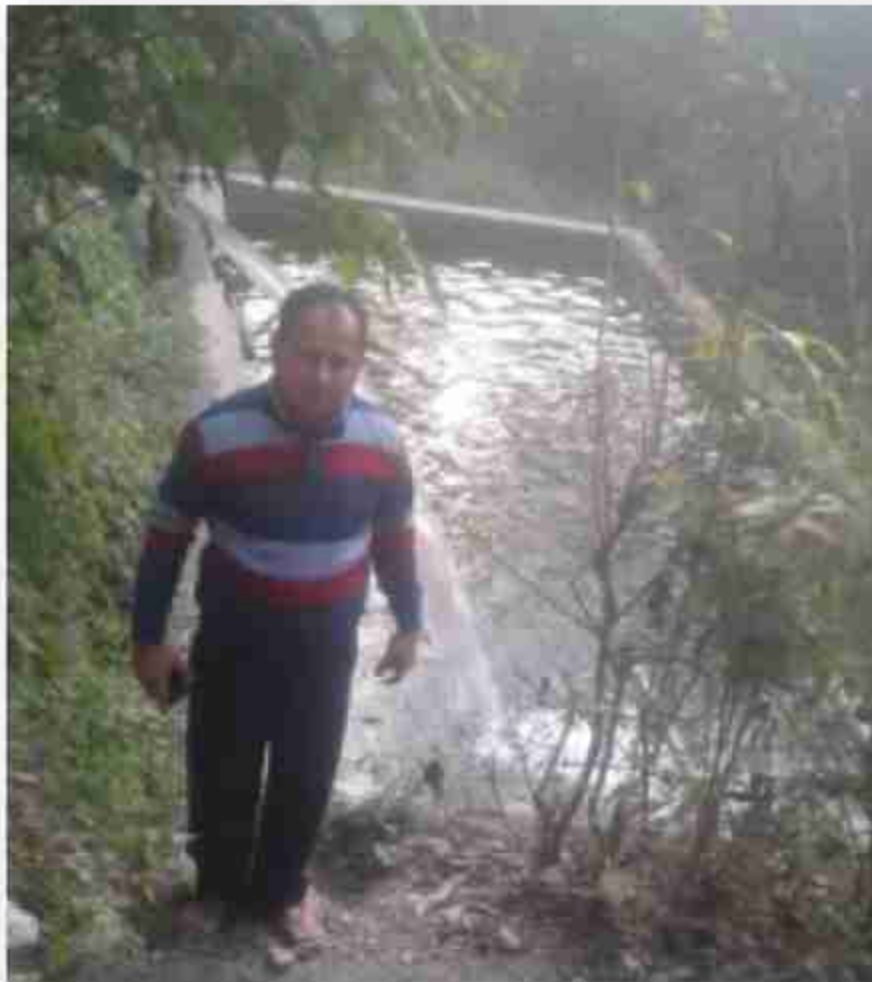
Image: Site of one of the source for irrigation