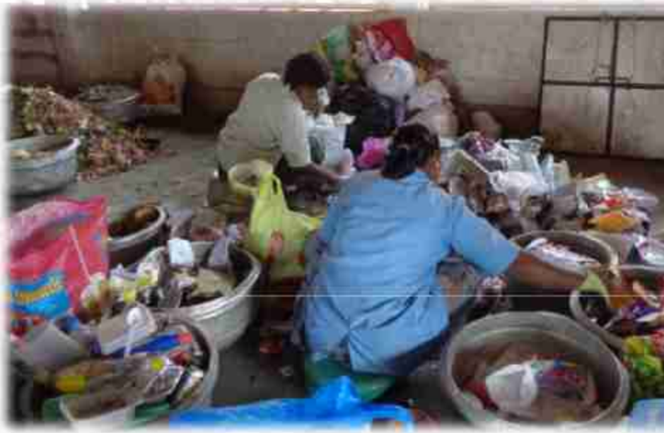
Image: Cleanliness activity under progress

This GP has set a fine example of collective efforts. Among many, a commendable positive outcome to mention is that skill education/trainings provided to women in jewelry making, stitching and embroidery etc. has proved to be an important and probably the only source of income through market sale of the products thus improving the rural economy as a whole.