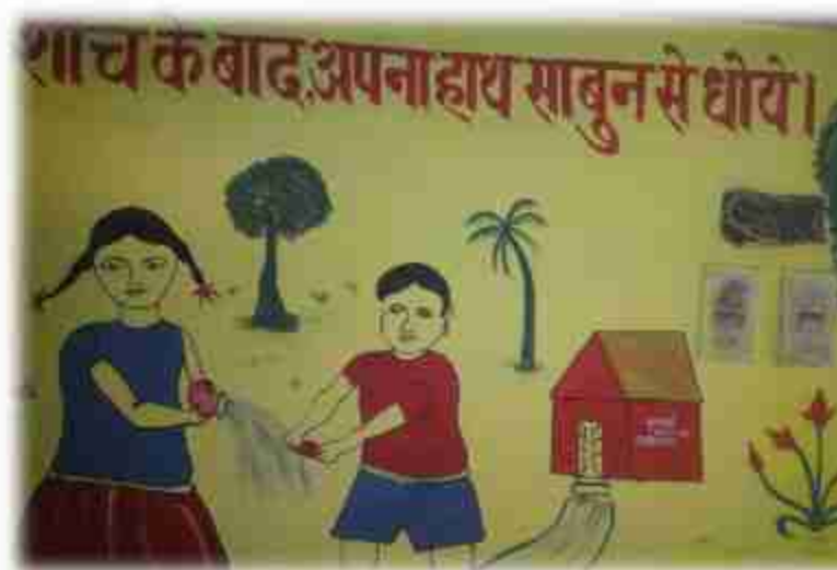
Image: Educating people about sanitation through wall paintings