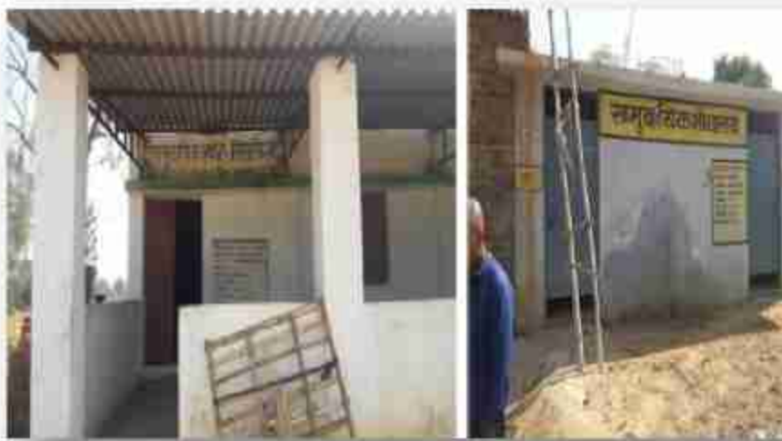
Images: Community centre and community toilet constructed for marginalized sections

In addition, another achievement of this village that needs to be highlighted is that it is the first digital village in Chhattisgarh with wi-fi connection. Earlier, people of Silphili were facing problems in filling online forms on a day-to-day basis. Applying for basic documents such as caste certificates, ration card, pensions, etc. was becoming difficult for them. They had to travel 25-30 Km away from the village, to get internet access. One of the local residents came forward and volunteered to provide help for setting up a Wi-Fi modem. Further, the Panchayat members of Silphili came forward for mobilization of resource and contributed around Rs. 15,000/- to Rs. 20,000/- for this purpose.