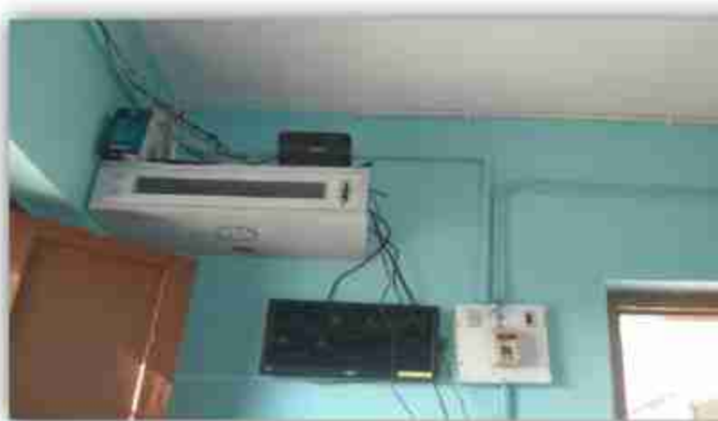
Image: Computer peripherals/Internet components available at the GP

KakiraKasba GP is playing a leading role in the State towards a modern era of panchayats by practicing efficient use of technology. It is the first GP of Himachal Pradesh which has maintained all the data online ensuring complete transparency of activities undertaken. Payments to the beneficiaries are also made through online payment modes. This panchayat has shown an entire new level of efficiency and excellence in their services. There is CCTV surveillance along with audio facility in the Panchayat Office and the conversations with officials are done through Skype. Videos of the works executed are uploaded on YouTube channel which shows the transparency of work done. Further, Minutes of Meetings are recorded and also circulated to all the concerned departments. Considering the use of digital technology impressed upon by the Government of India for transparency and efficacy, this GP can be considered a role model for all the Panchayats of the State or Nation as a whole.