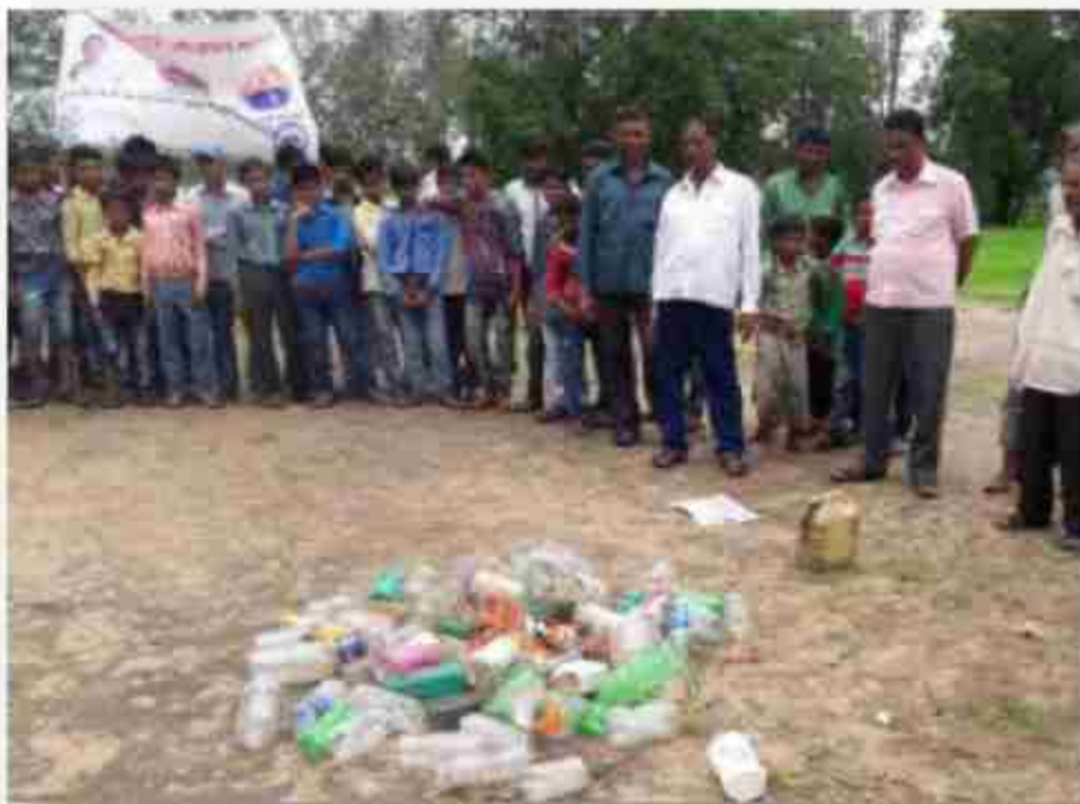
Image: Collection of plastic waste done by the locals