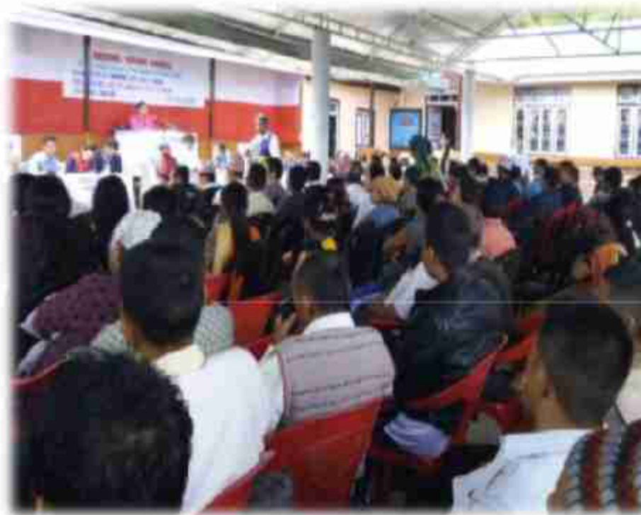
Image: Gram Sabha in procession