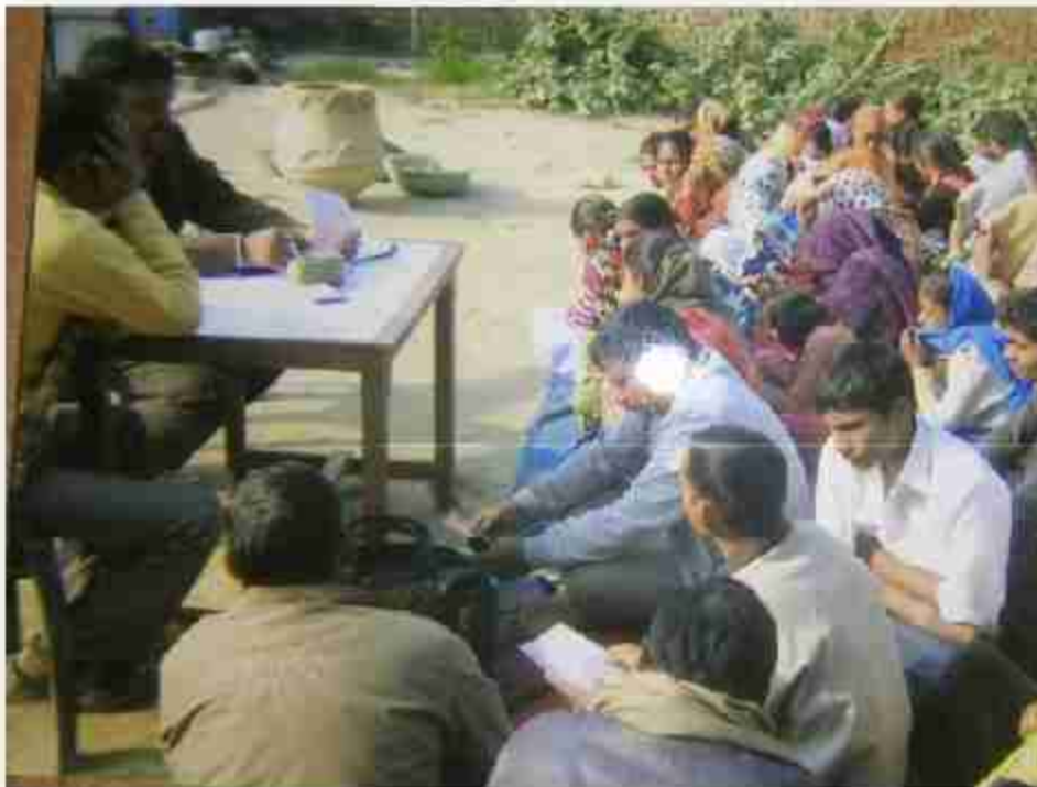
Image: Panchayat meeting in procession