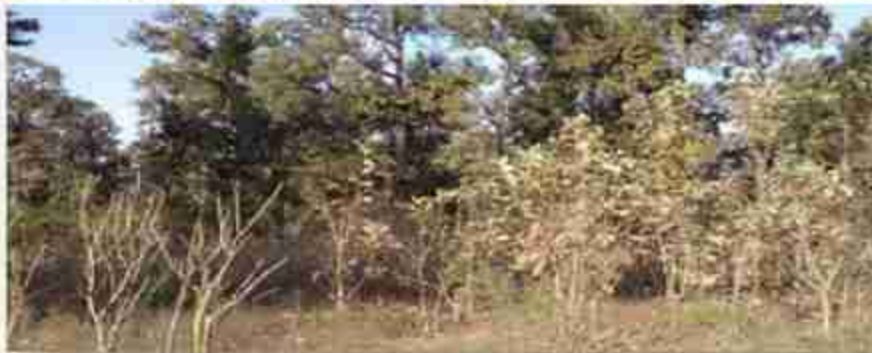
Images: Cultivation on the land provided to migrant ST Community