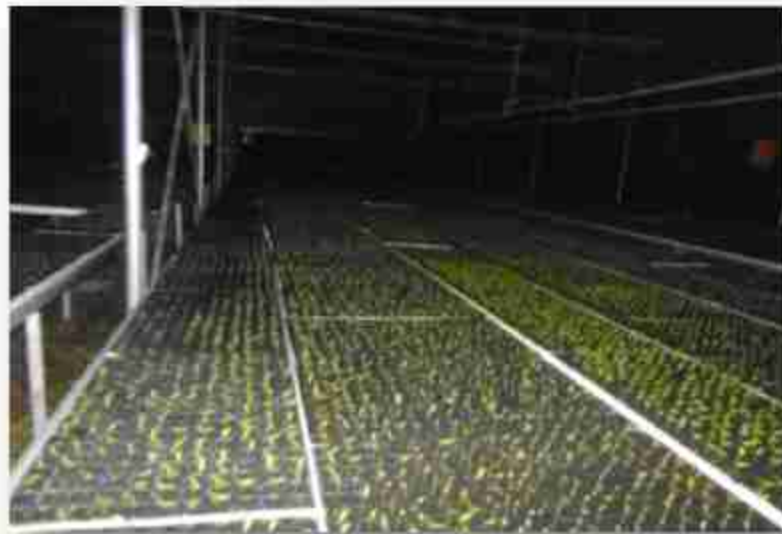
Image: Cultivation being done inside polyhouse

Earlier, due to menace/danger of wild animals, farmers were not able to cultivate vegetables without a fear of loss. However, with the efforts of GP and society, all the agricultural activities are now being undertaken in the greenhouses/polyhouses. Presently, total area of production covered is around 40,000 sq meter. As a result, the average income of the farmers has also increased many-fold. This society is also cultivating organic species of flower and exotic vegetables like red and yellow capsicum, iceberg and seedless cucumber and the farmers produce is being sold in the nearby markets. Technical support by the State Environment Science and Technology Department is also supplementing the efforts of this Panchayats. Further, the green houses for vegetable nursery production had also been setup by State's Agriculture Department.