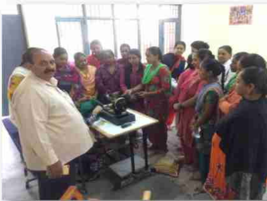
Image: Trainings being provided to women at Silai center organized by Punjab University