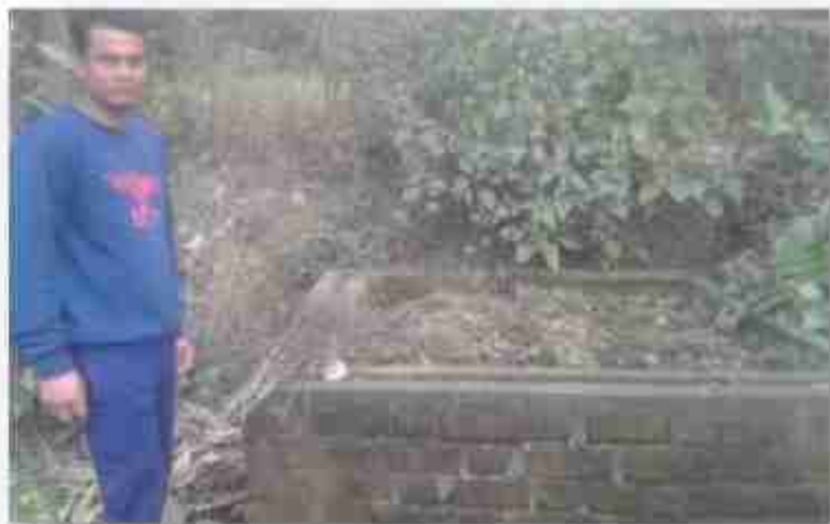
Image: Vermi-compost pit