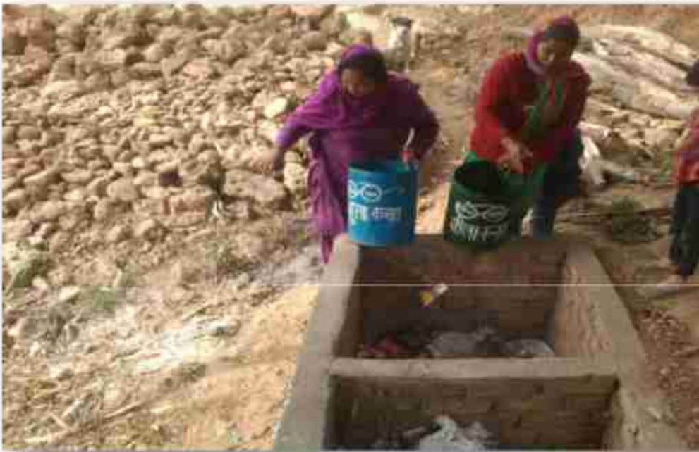
Image: Women segregating garbage in pits

Taking a step towards eradicating social evils, liquor eradication campaign are also organized in this Panchayat.