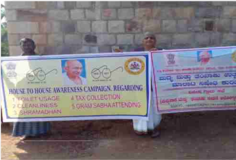
Image: Awareness camps being organized