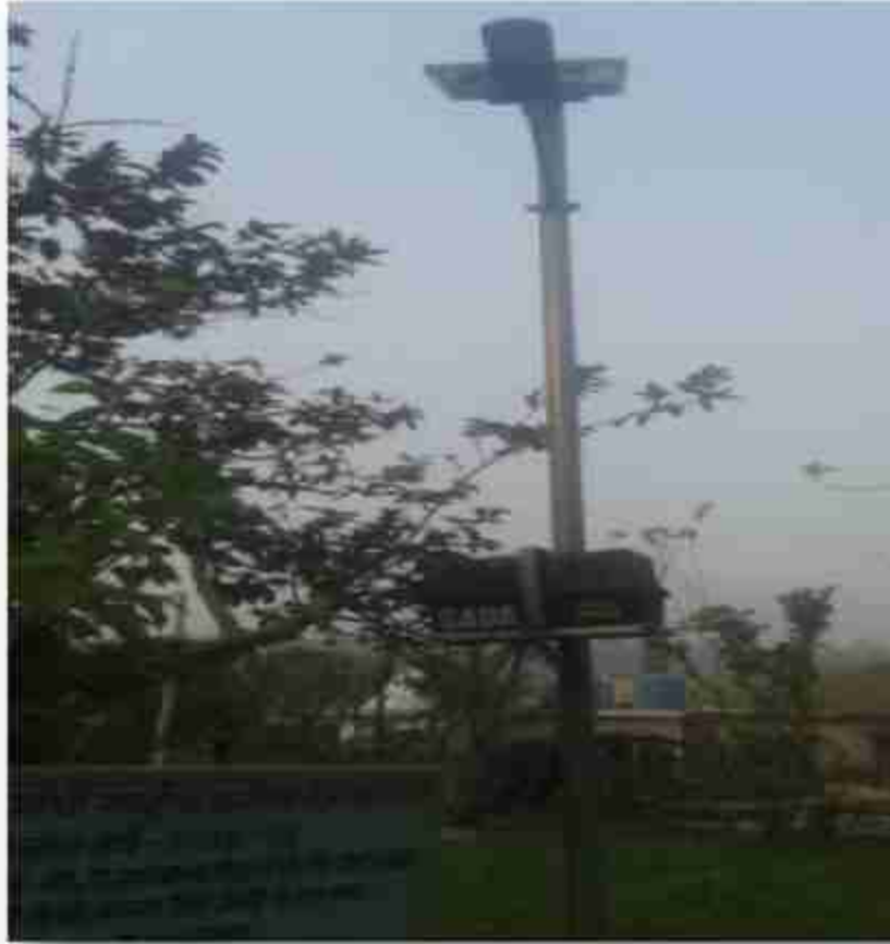
Image: Street Light installed in the GP