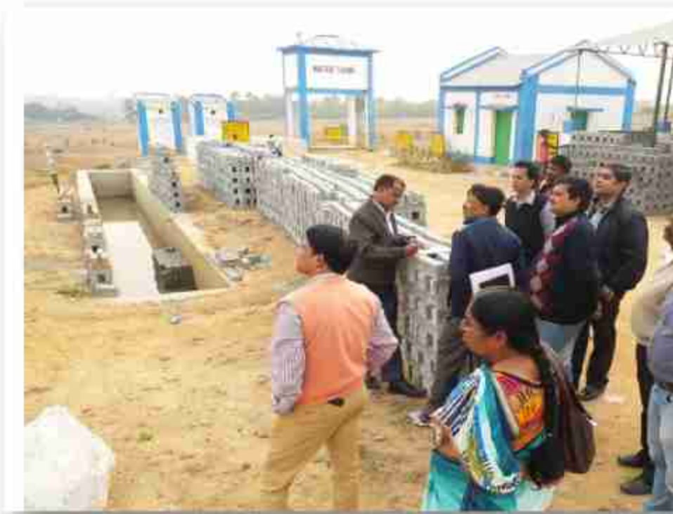
Image: Fly Ash Bricks factory at Nildiah GP of Raghunathpur-II Block, West Bengal

Hence, perseverance and concerted efforts of officials and elected representatives with developmental vision and mission broke the silence of development in this panchayat paving way for a better future.