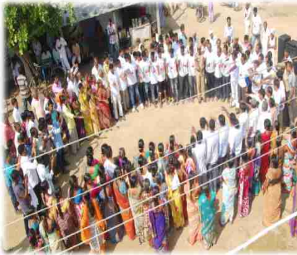
Image: Voluntary organization conducting survey and discussions alongwith Panchayat members