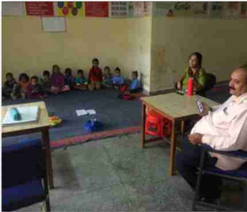
Image: Free counseling being provided to children