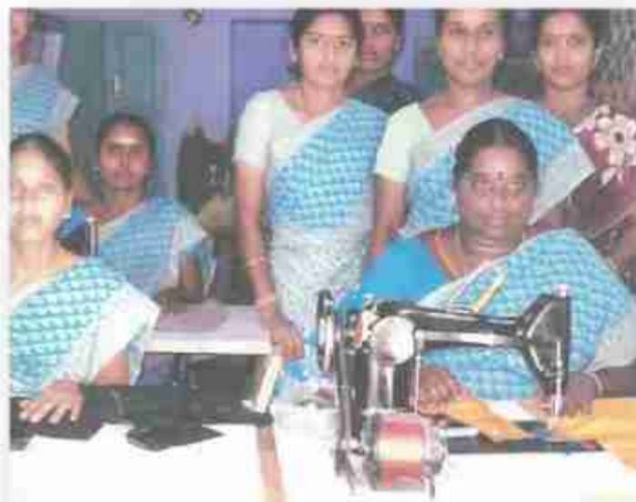
Image: Skill education being provided to women

This GP has set a fine example of collective efforts. Among many, a commendable positive outcome to mention is that skill education/trainings provided to women in jewelry making, stitching and embroidery etc. has proved to be an important and probably the only source of income through market sale of the products thus improving the rural economy as a whole.