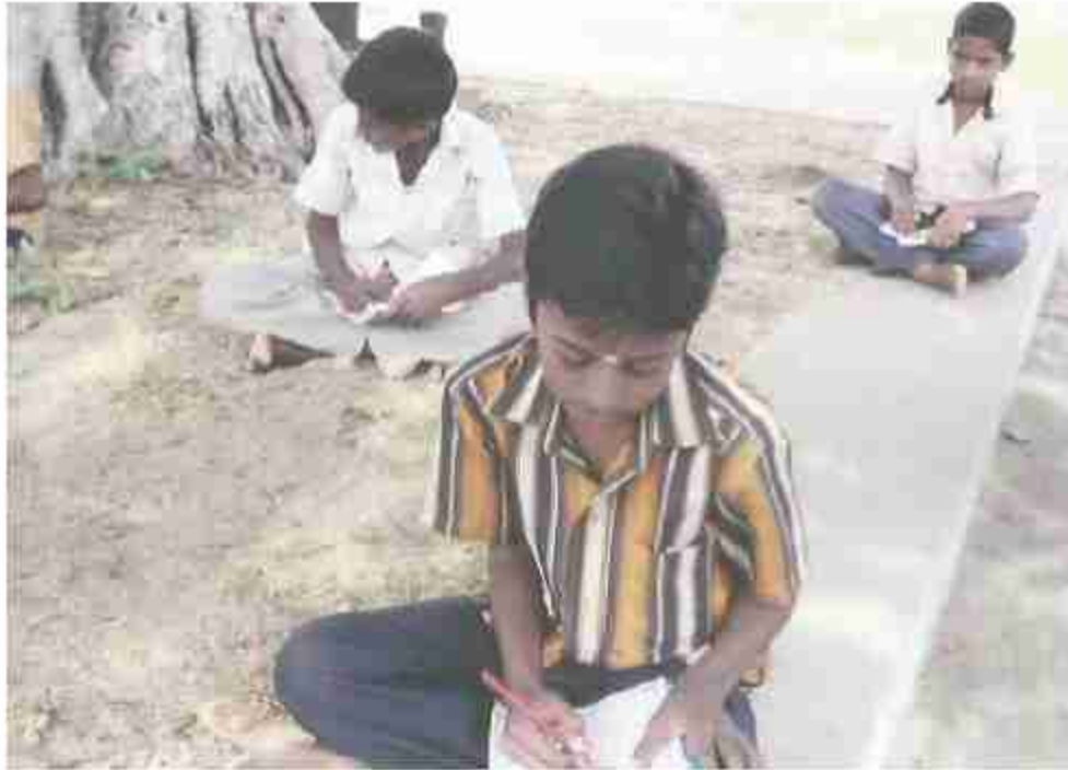
Image: Evening tuitions for children