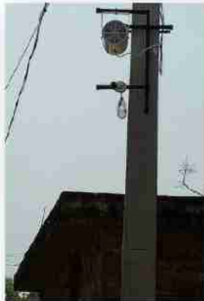
Image: Public announcement systems in place