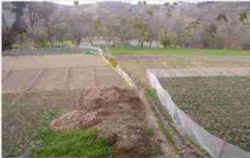
Image: Part of area under cultivation in the GP