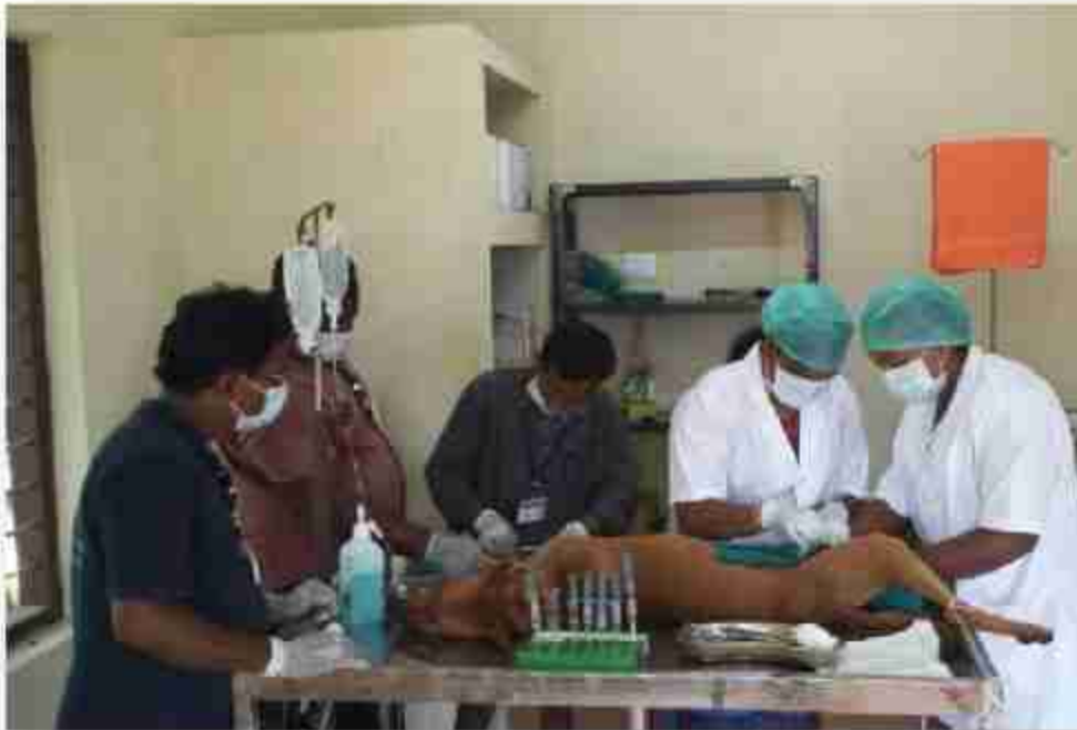
Image: Sterilization/ Animal birth control programme being undertaken