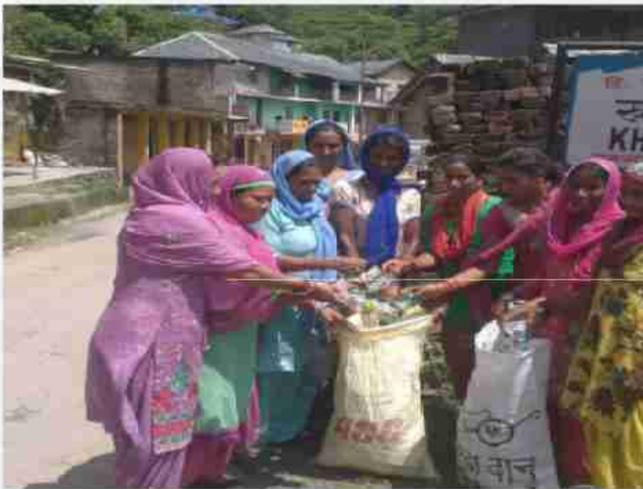
Image: Collection of garbage carried out by local women