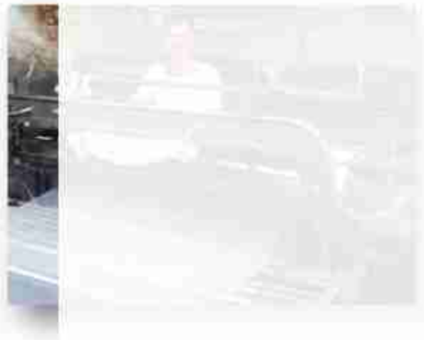
Image: Weaver working at the industry

Due to these efforts of Mustipally Gram Panchayat in association with Voluntary Organizations, not a single suicide was reported in the year 2016-17 and 2017-18.