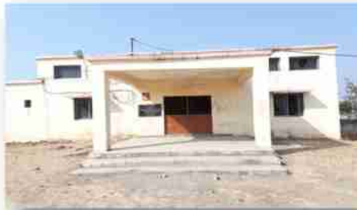
Image: One of the Community Centre built in the BalladiJanpad Panchayat