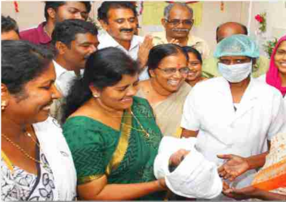
Image: Sterilized towels being distributed under Snehathooval scheme