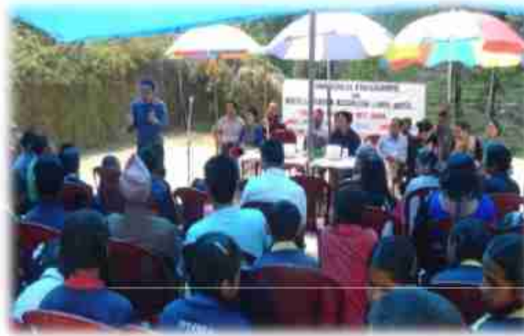
Image: Health awareness programme organized in school

Commendably, this GP has with cooperation from locals has left no stone unturned to make it a vibrant one among others in the State in terms of cleanliness and averting the possible health issues.