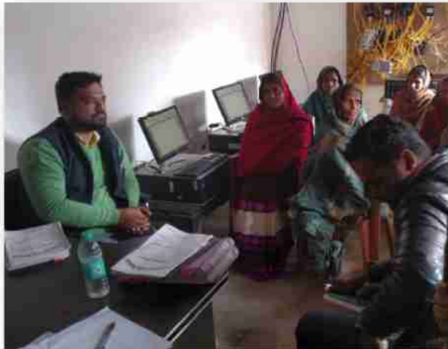
Image: GP Office well equipped with computers