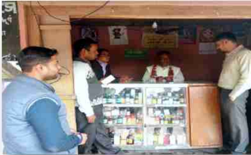
Image: Purchase being made through digital transaction at a chemist shop