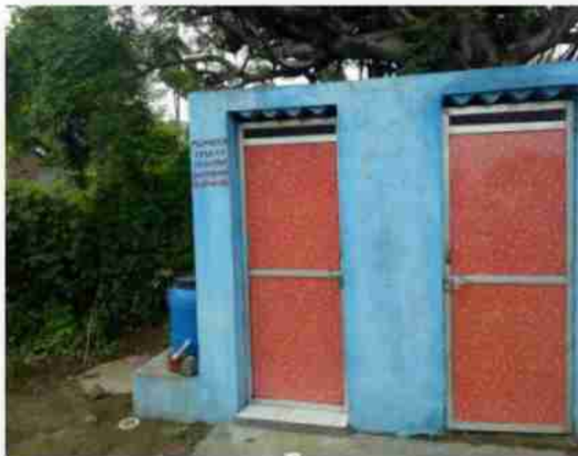
Image: Toilets constructed in the panchayat