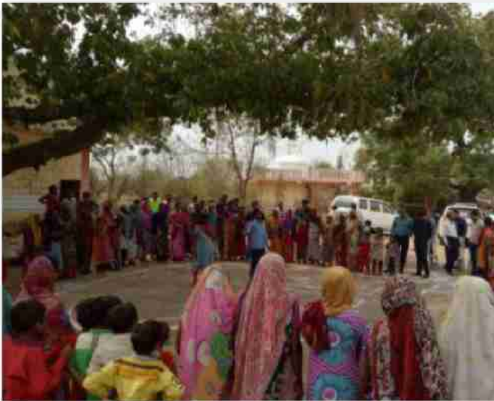
Image: One of the awareness camps organized for women and children.