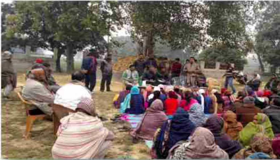
Image: Panchayat meeting in procession.

Overall, the Panchayat has achieved a praiseworthy status in the District and State as a whole in terms of its sanitation activities and providing a clean environment for its present and future generations.