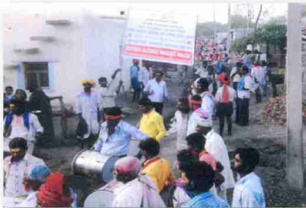
Image: Tax collection camp being conducted

Further, Panchayat provides awareness on sanitation, solid and liquid waste management, communicable diseases, preventive medicines etc are seen given through public address systems, wall writings, pamphlets, bit notices etc. Information of the schemes implemented, information on RTI etc. are displayed at the Panchayat office. Street plays ,seminars , and workshops are also conducted for sensitizing on the issues of child labour ,child marriage, Protection of Children from Sexual Offences Act,2012 (POSCO Act), full enrolment, sanitation, conservation of environment, maintenance of water bodies and organic farming etc.