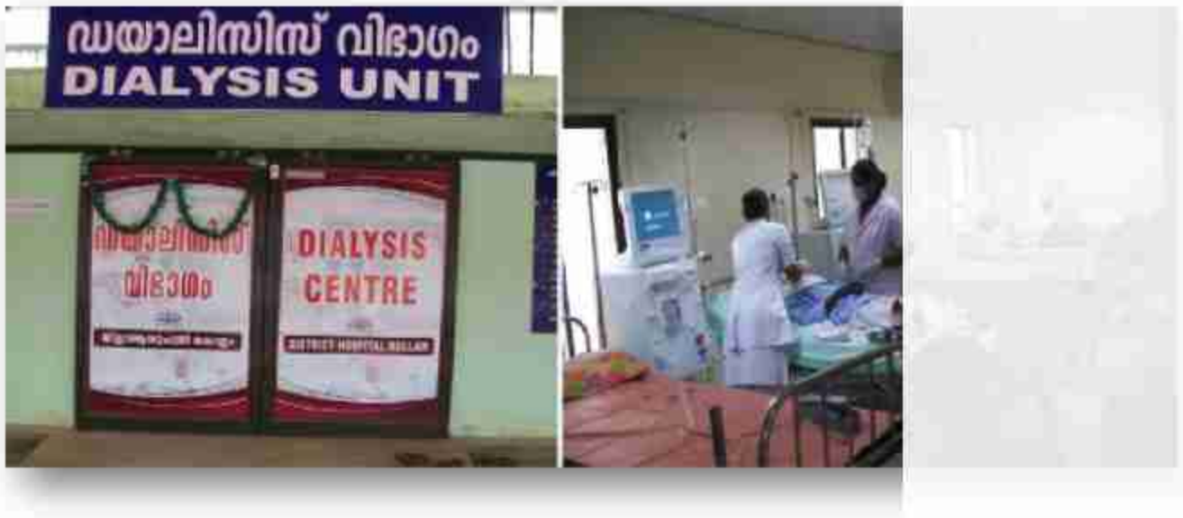
Image: Dialysis centre