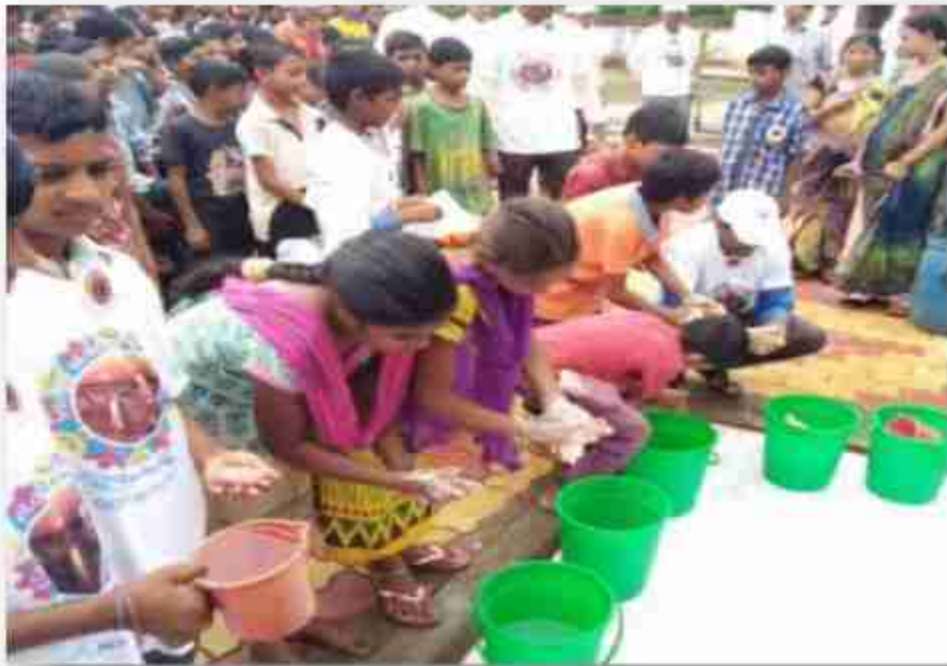
Image: Sanitation camps being organized for school children