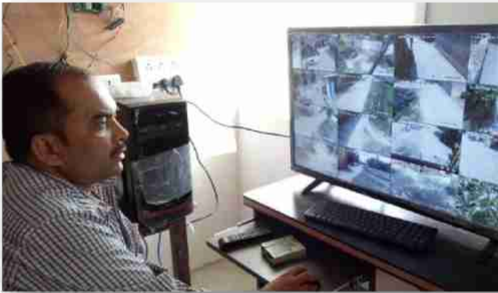
Image: Surveillance through CCTV