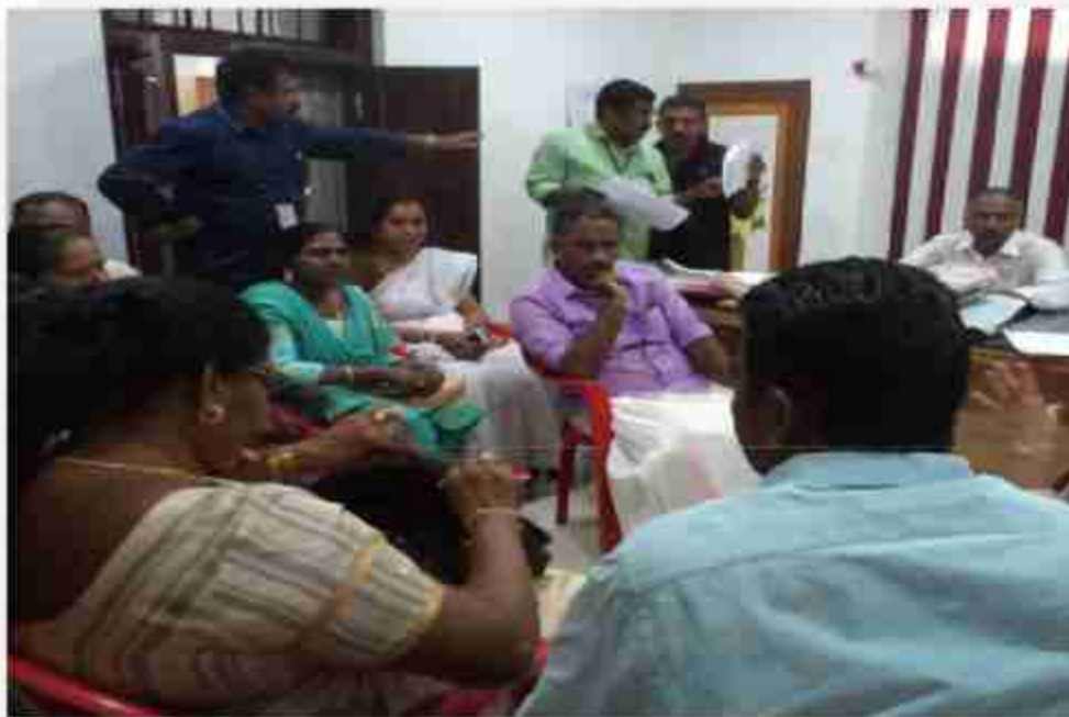
Image: Discussions being held regarding tax collection with the Government Officials

As a result of all these efforts of the Panchayat, during the year 2016-17, it collected Rs. 33,43,925 through taxes, Rs.44,700 Rental income, Rs.25,0141 through fee and user charges, Rs. 78,800 through sale and hiring charges and Rs. 25,949 through other sources.