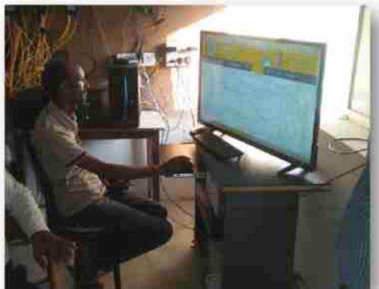
Image: Effective usage of GIS

Apart from this, GP is effectively making use of the public announcement system for announcing the Gram Sabha meeting details; renovating the class rooms, modern toilets, washing facility, smart class rooms; constructing compound walls ; developing modern painting on the building and compound walls etc. Therefore, HansudiAusanapur Gram Panchayat can easily be tagged as a smart Panchayat and has done remarkably in providing all the basic amenities to the locals.