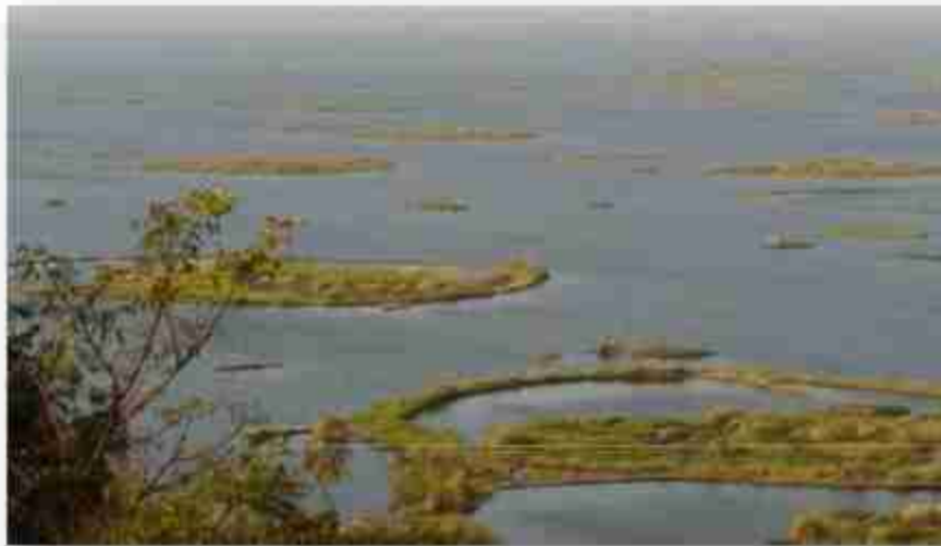
Image: Loktak lake where fish farms are allocated among citizens

Further, it is also worthwhile to mention here that GP Saiton is also an ODF Panchayat. All the abovementioned collective efforts have resulted in generating income for the locals while also motivating youth through engagement in livelihood practices.