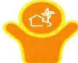
Village with Self Sufficient Infrastructure