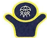
Socially Secured Village