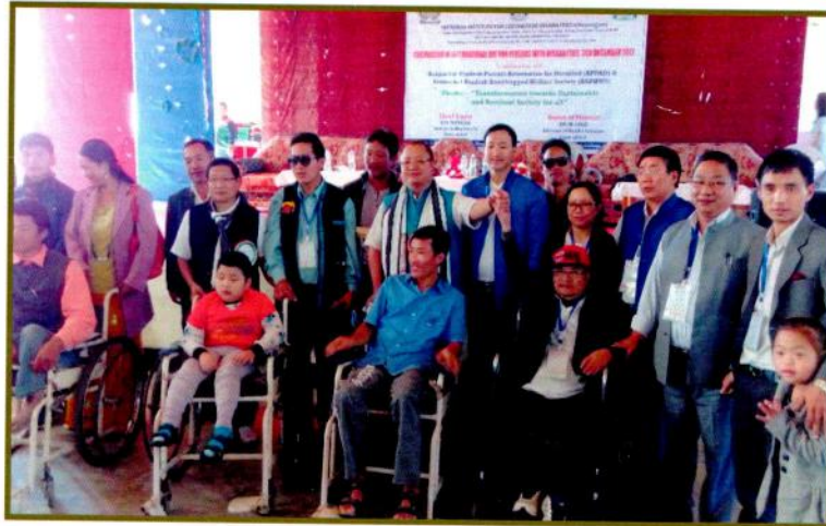
World Disable day celebration 3 rd Dec'2017