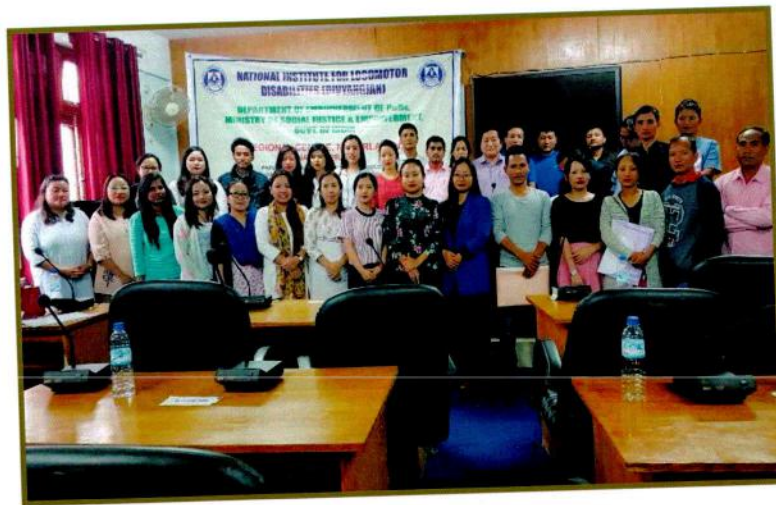
During Seminar held on 24 th March'2018