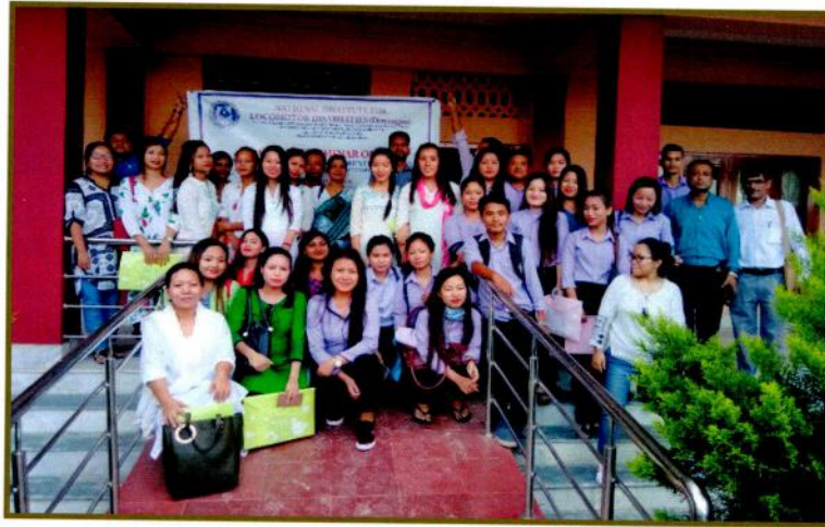
Awareness programme 22th Sept'2017