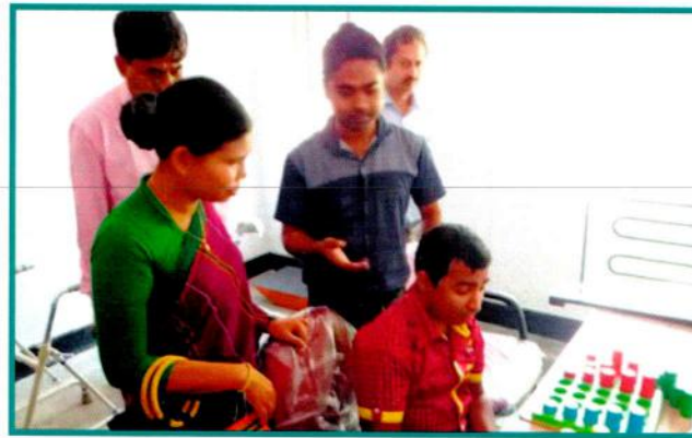
Center In-Charge demonstrates in front of Minister.