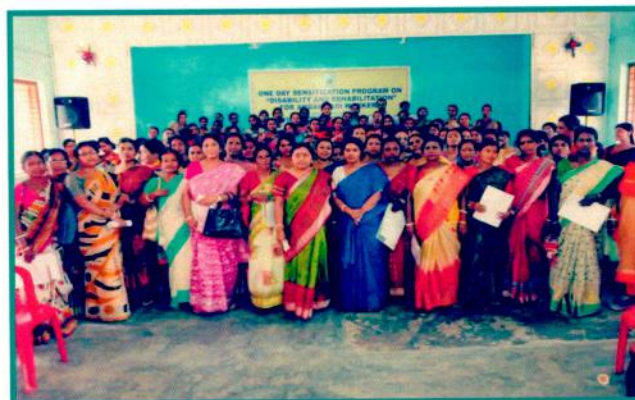
Group Photograph by the participants (Anganwadi Workers)