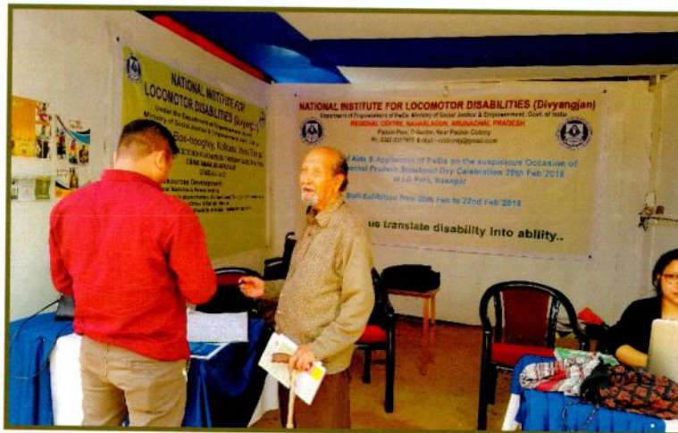
Centre Exhibition on Statehood Day 20 th Feb'2018