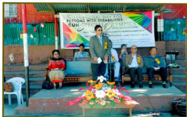
International Day For Persons With Disabilities Cum Special Olympics Was Celebrated at Zarkawt Recreational Centre.