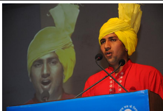
Haryanvi song by a student of R.K.S.D. College, Kaithal