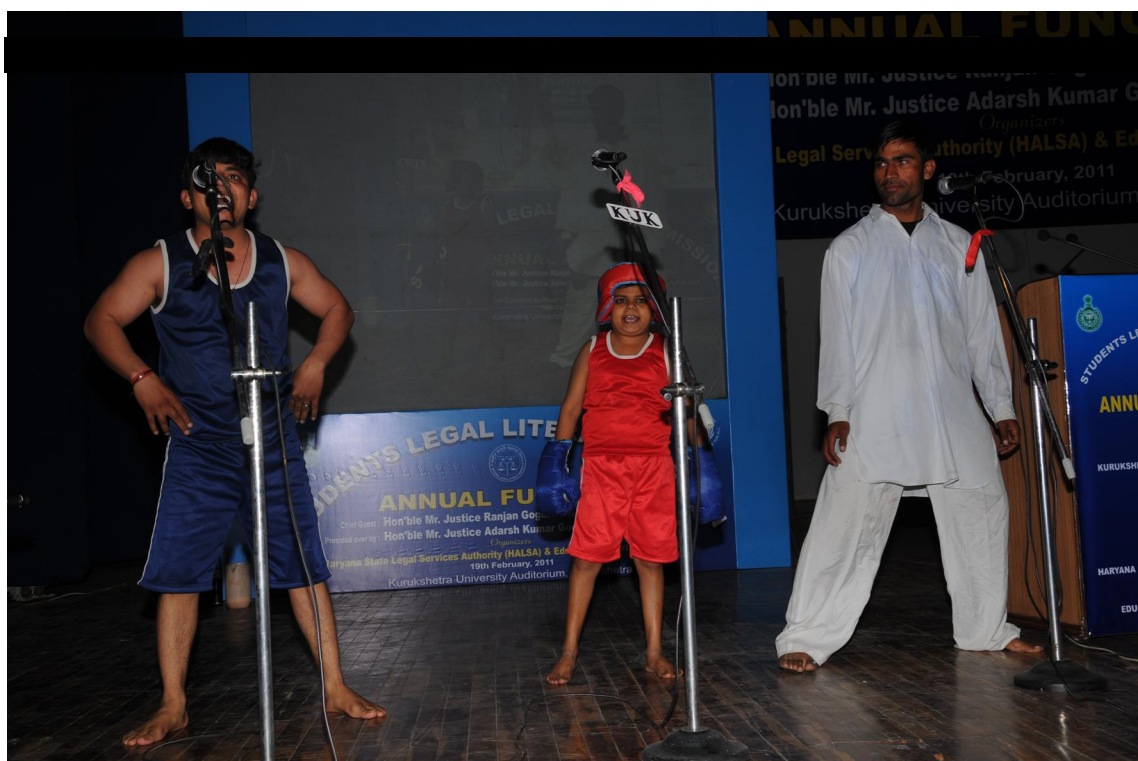
Skit by the students of R.K.S.D. College, Kaithal at Kurukshetra University, Kurukshetra