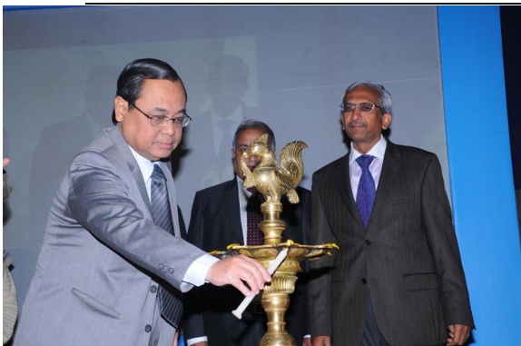
Hon'ble Chief Justice Mr. Ranjan Gogoi inaugurating the session at Kurukshetra University, Kurukshetra