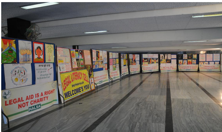
Thematic presentation of drawing and painting skills of college and school students at Kurukshetra University, Kurukshetra

On this occasion, the prize winning paintings, slogans and poems of students of various schools and colleges of Haryana were exhibited in the crush hall of University Auditorium. The paintings, slogans and poems highlighted various social issues like