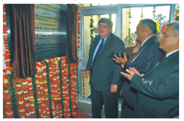
a hub for all kinds of ADR activities--conciliation, mediation, arbitration, Lok Adalat and judicial settlement, making it a multi-service centre.

ADR Centers consist of a 'front office, Library; Waiting Room; Facility for conducting Lok Adalats/Permanent Lok Adalat constituted under Section 22B; A combined Office space for the District Legal Services Authority and the ADR Centre; Cubicles for conducting mediation/conciliation/Arbitration; computer room; Conference/Meeting room and other common facilities.