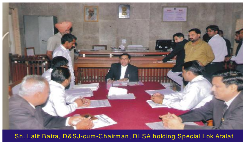
Sh. Lalit Batra, D&SJ-cum-Chairman, DLSA holding Special Lok Adalat

Special Lok Adalats are organized from time to time for disposing of specific kind of cases e.g. Cases for compensation under Motor Vehicles Act, Negotiable Instruments Act etc.