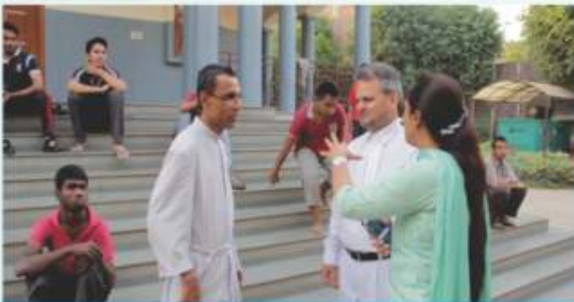
Deepashram at Gurgaon