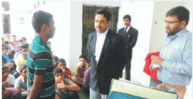
Observation Home and Shelter Home at Ambala