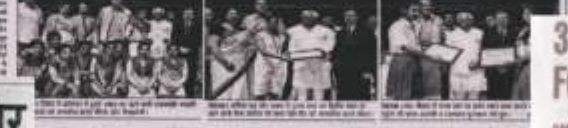
अधिकार जानोगे तो न्याय मिलेगा का कार्यक्रम।