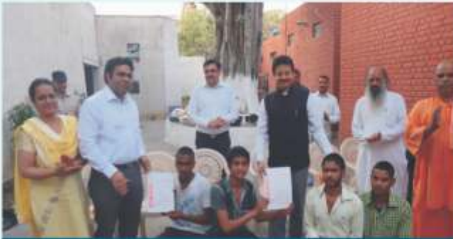
Child Shelter Home & Observation Home, Faridabad

To ensure proper legal protection to the vulnerable and marginalized section, the Chairmen cum District and Sessions Judges alongwith Chief Judicial Magistrates-cum-Secretaries have been making visits regularly every month to Children Homes, Shelter Homes, Observation Homes and Old age homes across the State of Haryana under the instructions and guidance of the Haryana Legal Services Authority. Deficiencies are taken up with the concerned authorities. Legal aid is also provided in appropriate cases.