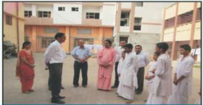
Sri Krishan Pranami Jankalyan Trust, a shelter home for children, Bhiwani