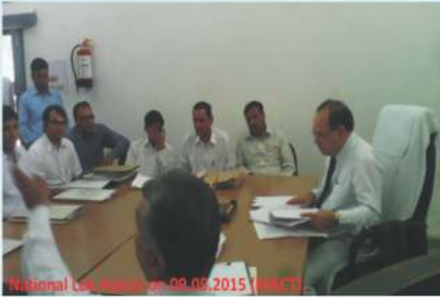
National Lok Adalat on 09.08.2015 (NACT)