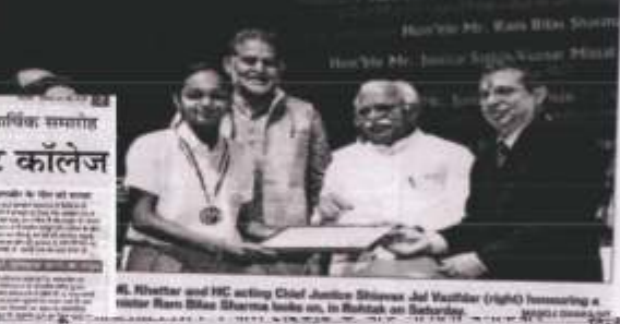
Manohar Lal Khattar and HC acting Chief Justice Shrivesh Jai Vardhan (right) in a meeting.

NEW DELHI: Citing a pendency of more than 1.40 lakh cases in the state, chief minister Manohar Lal Khattar on Wednesday demanded a separate High Court for the state along with representation