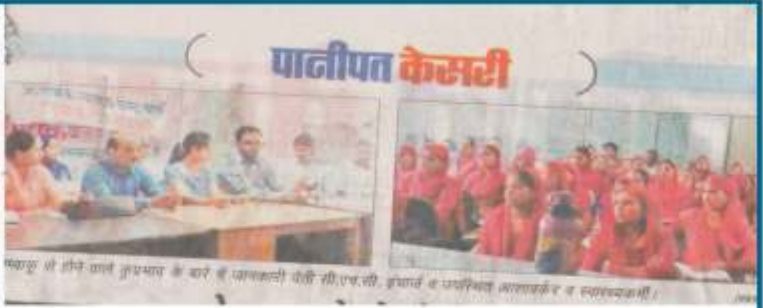
पानीपत केसरी के कार्यक्रम में भाग लेने वाली महिलाएँ।

सिंधु पत्रिका के संपादन के दौरान एक कार्यक्रम के आयोजन के दौरान