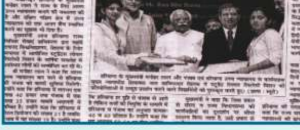
सीएम ने अलग उच्च न्यायालय से मिलेगा प्रदेश की जनता को लाभ का कार्यक्रम में संबोधित किया।

स्टूडेंट्स लीगल लिटरेसी मिशन के वार्षिक समारोह में सीएम ने किया संबोधित