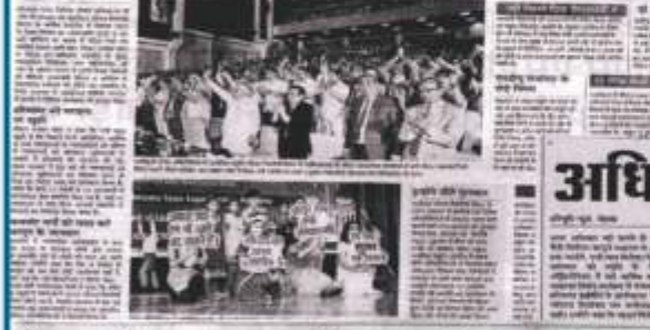
शिक्षा विभाग ओवरऑल चैंपियन, नेकीराम बेस्ट कॉलेज का कार्यक्रम।