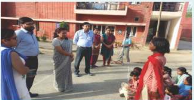
Balkunj Chachrauli Children Home at Yamunanagar