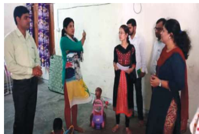
Shelter, Children Home, Rewari