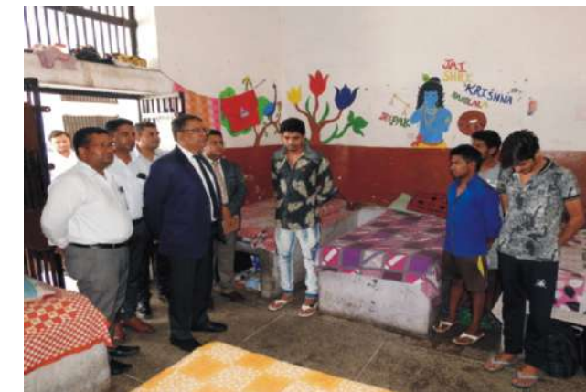
Observation Home, Ambala