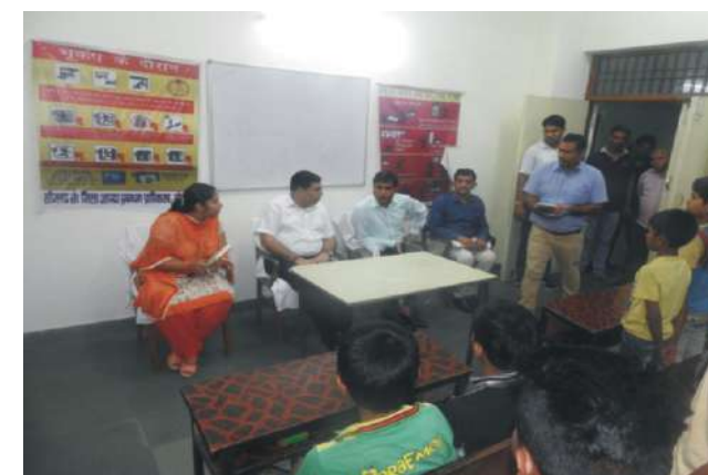
Shelter Home, Sonapat