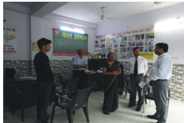
Shelter Home, Narnaul