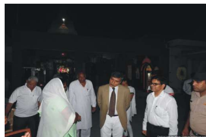
Old Age Home, Kaithal