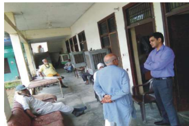
Old Age Home, Yamunanagar