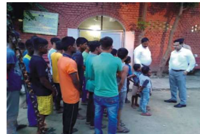
Shelter Home, Panipat