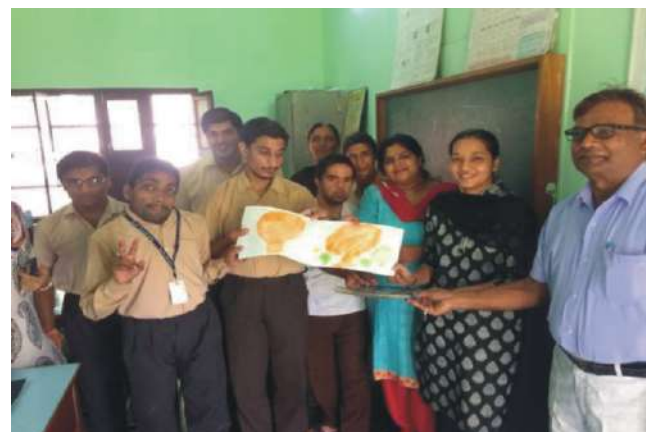
Arpan Institute, Rohtak