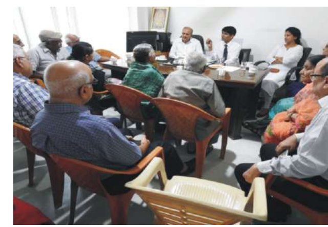
Old Age Home, Gurugram