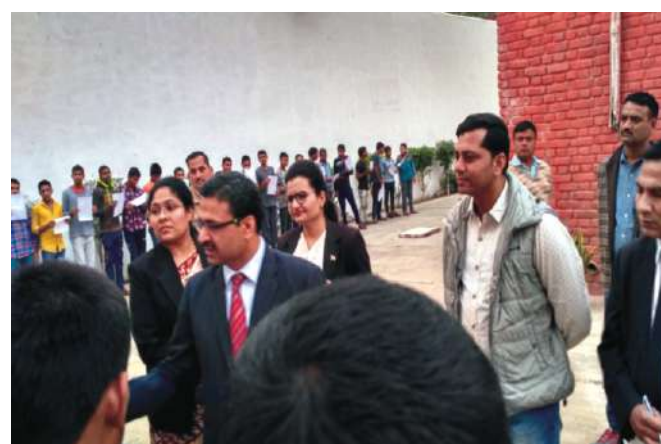
Shelter Home, Faridabad