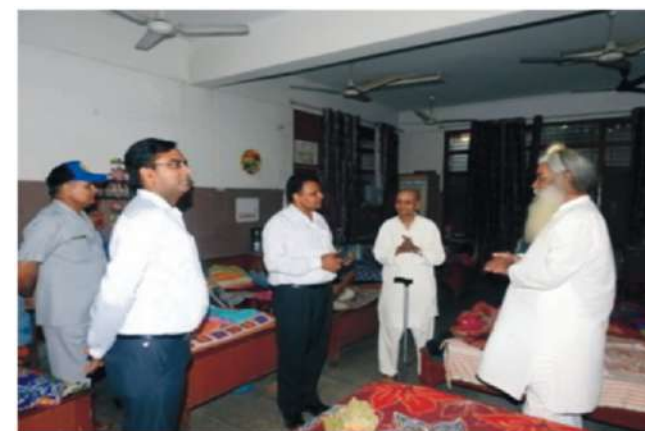
Old Age Home, Panchkula