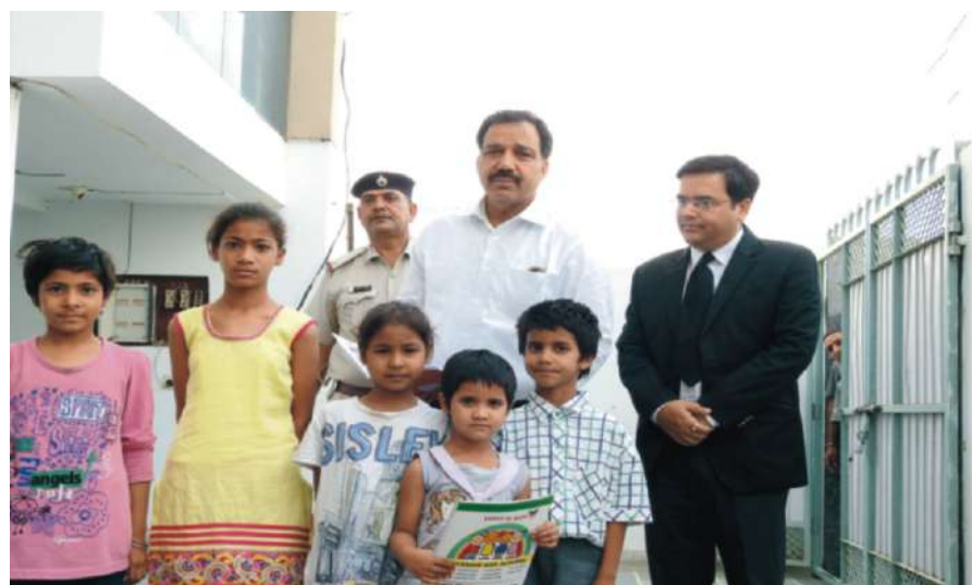
Shelter Home, Sirsa

A glance of the visits made by Chairpersons and Secretaries, District Legal Services Authorities in the state of Haryana during the quarter July to September, 2018: