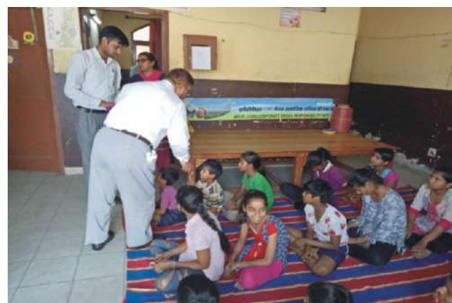
Shelter, Children Home, Jhajjar