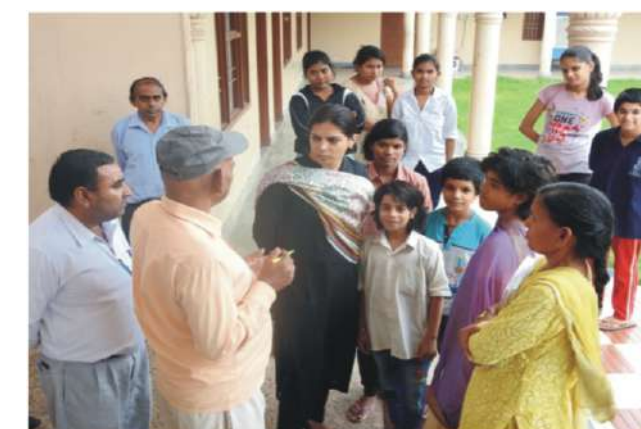
Bal Seva Ashram Bhiwani