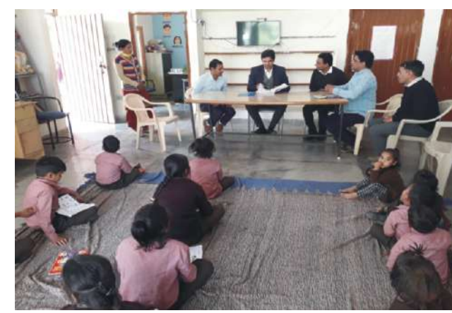
Children Home, Fatehabad