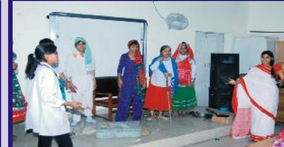
Spreading legal awareness through skit