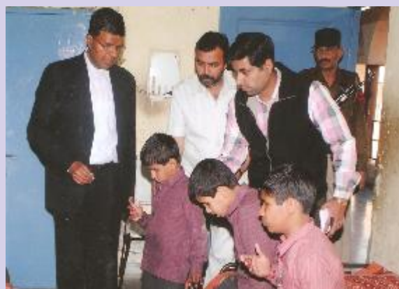
D&SJ-cum-Chairman, DLSA, Hisar visiting the institute run by District Red Cross Society for visually handicapped children