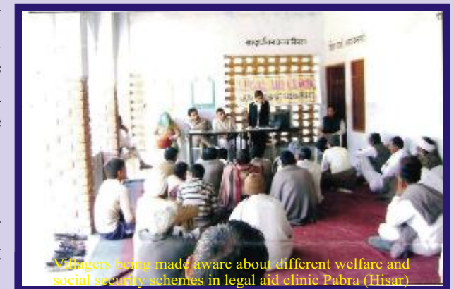
Villagers being made aware about different welfare and social security schemes in legal aid clinic Pabra (Hisar)

In total 220 Legal Literacy Camps were organised on different legal topics all over Haryana.