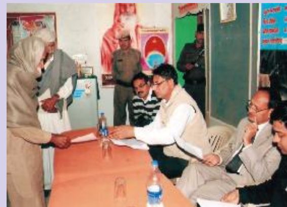
D&SJ-cum-Chairman, DLSA, Fatehabad addressing the grievances of Sr. Citizen on his visit to Sr. Citizen Club (Bagbaan), Jagjiwanpura