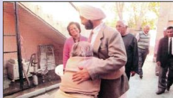
One female member of Old Age Home Sikri expressing her gratitude to D&SJ-cum-Chairman, DLSA Faridabad by hugging him on his visit

In compliance with the direction issued by HALSA, apart from holding Legal Literacy Camps, District and Sessions Judge-cum-Chairmen, DLSA alongwith Chief Judicial Magistrate-cum-Secretaries, have been making fortnightly visits to Shelter Homes and various other Homes/Institutions run for the Senior Citizens/Disabled or Under Privileged people to look into the their well-being and the facilities provided to them. Visits are also made to protection Homes, Observation Home and Jails to redress the grievances of the inmates.