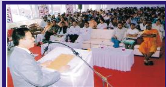
Camp organised in Collaboration with Haryana Yua Shakati in the campus of Maharani Kishori Jat Kanya College