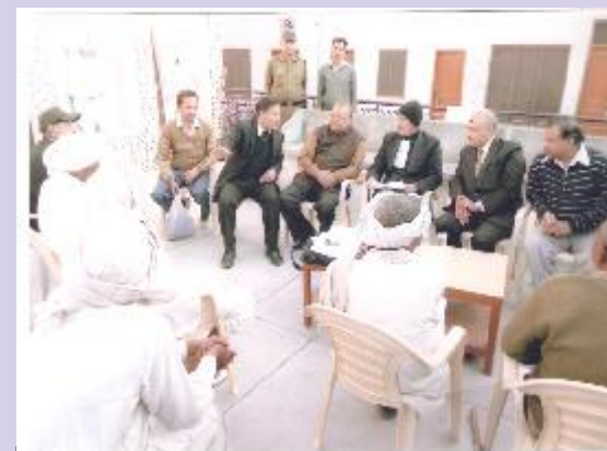
D&SJ-cum-Chairman, DLSA, Kaithal interacting with Sr. Citizen on visit to Old Age Home run by Sanatan Dharam Mandir