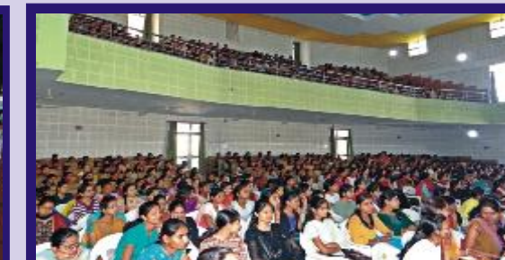
Students of Government College for Women, Sector-14, Panchkula being addressed on their Legal Rights

In all, 62 Special Legal Literacy Camps for Women were organised by District Legal Services Authorities in their respective districts all over Haryana.