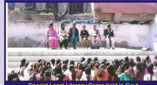
Special Legal Literacy Camp held in Govt. Girls Sr. Sec. School, Thanesar, Kurukshetra