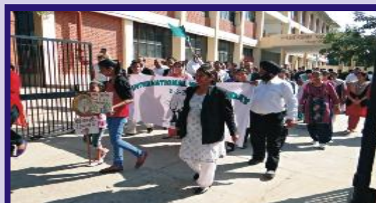
Procession March starting from District Court Complex to Govt. College for Women, Sector 14, Panchkula