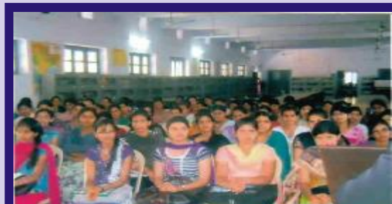
Legal Literacy Camp organised in Tikka Ram P.G. Girls College