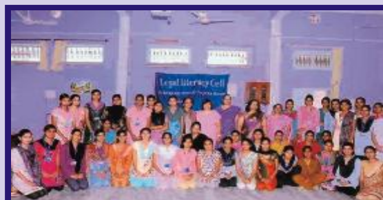
Legal Literacy Camp organised in Maharaja Aggresain College for Women