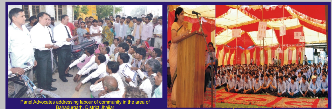
Panel Advocates addressing labour of community in the area of Bahadurgarh, District Jhajjar

The CJM-cum-Secretaries alongwith its Co-ordinators and Panel Advocates of the Authority enlightened the Labours about various schemes of NALSA and HALSA through which they can address their grievances and also apprised them of legal rights bestowed upon them through various Acts by legislature and schemes floated by the government.