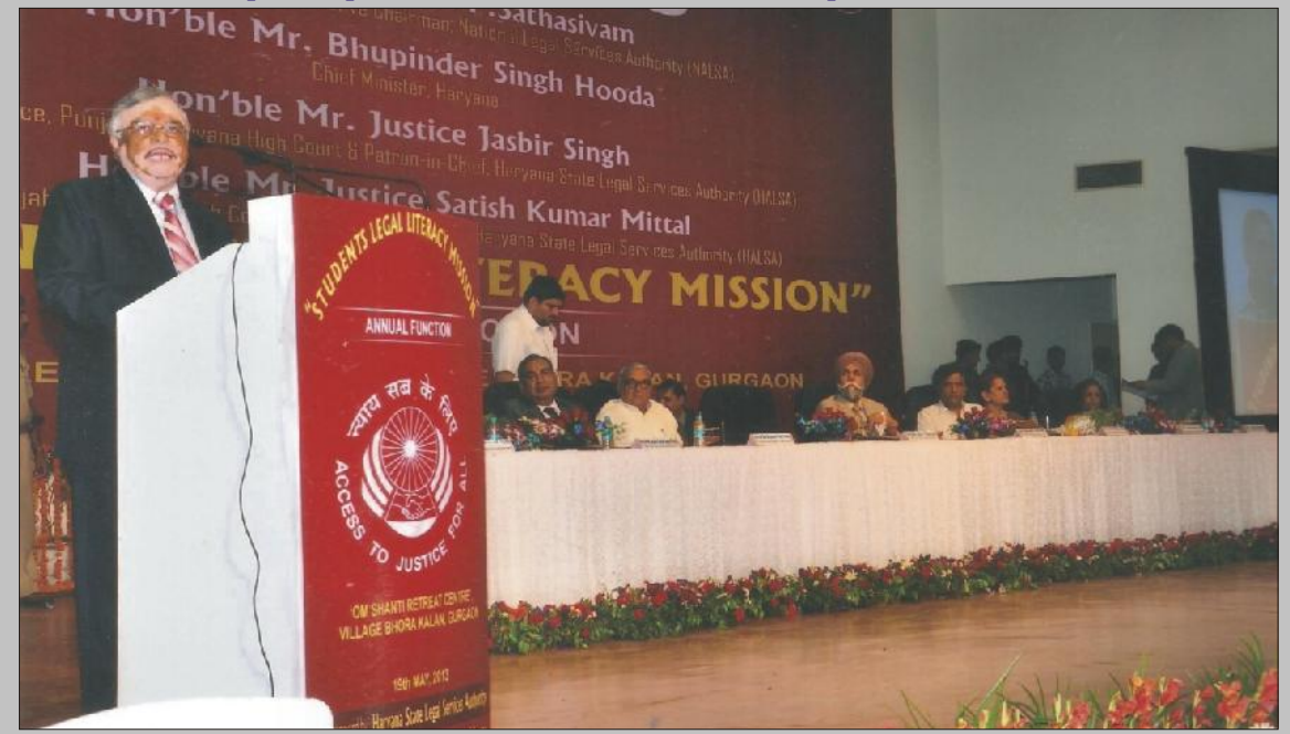
"Students Legal Literacy Mission" - Annual Function at Brahmkumari Om Shanti Retreat Centre, in a Bhora Kalan District Gurgaon on 19th May, 2013

HARYANA STATE LEGAL SERVICES AUTHORITY SCO No. 142 143, First Floor, Sector 34 A, Chandigarh 160 022 Tel.No. : 0172 2604055, Fax No.0172 2622875, Toll Free No.1800 180 2057 Website : www.hslsa.nic.in E mail : hslsa@hry.nic.in , hslsa.haryana@gmail.com