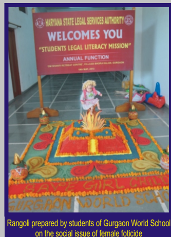
Rangoli prepared by students of Gurgaon World School on the social issue of female foeticide