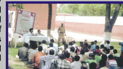
District Jail, Jind

Apart from organizing other Regular Literacy Camps, Special Legal Literacy Camps were organized in jails in various Districts of Haryana by District Legal Services Authorities in which inmates were apprised of their legal rights on 27.4.2013 by various enactments and judicial pronouncements. They were further asked to adhere to the rules and regulations, which would automatically result in securing their rights.