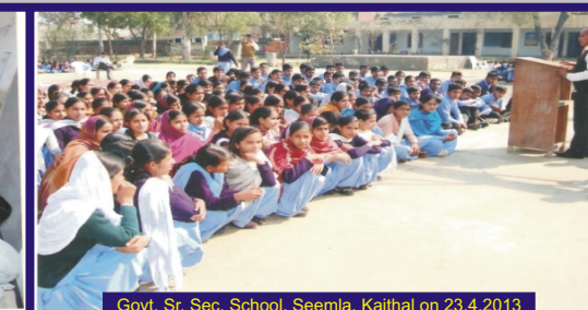
Govt. Sr. Sec. School, Seemla, Kaithal on 23.4.2013