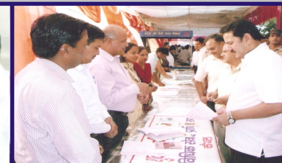
DLSA team of Kaithal in Night HaltCamp in vill. Chuaharmajra about 200 people discussed their legal problems