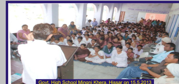
Govt. High School Mingni Khara, Hissar on 15.5.2013