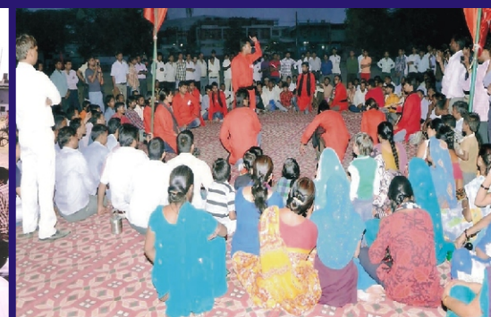
Labour community being education of their legal rights in Industrial Area Sector 24, Faridabad by delivering lectures and also by way of Nukad Nattak (Skit)