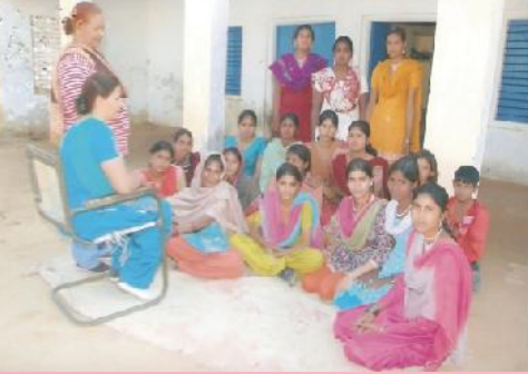
National Plan Action 2011 2012 Legal Literacy and Awareness Class for woman at Sirsa