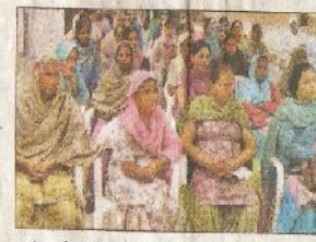
काकूम में उपस्थित महिलाएं।