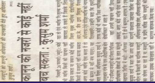
Identifying the Unorganized Workers within jurisdiction of DLSA, Bhiwani