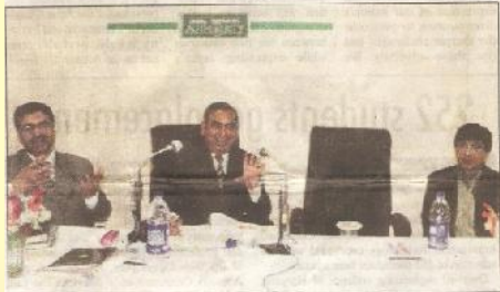
Justice SK Mittal of the Punjab and Haryana High Court addresses a legal convention. In Rewari, Photo by writer