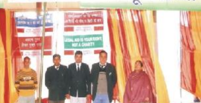
ic Information Campaign of Government of India in H i, District H