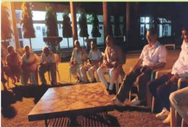
Prerana Old Age Home, Kurukshetra