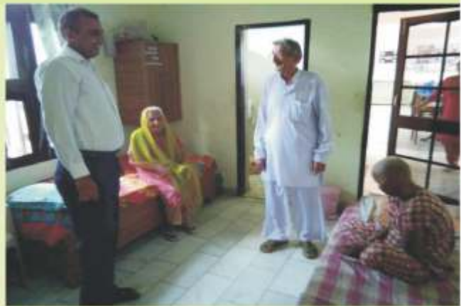
Moksh Vardh Ashram, Hissar