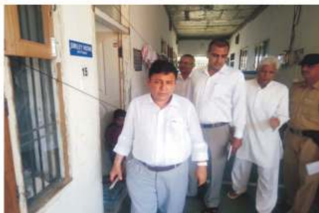
Shaishav Kunj, Hissar