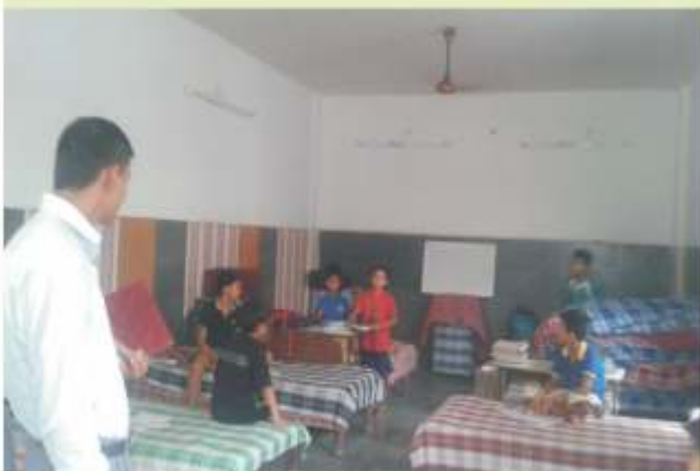
Vanvasi Kalyan Ashram, Bhiwani