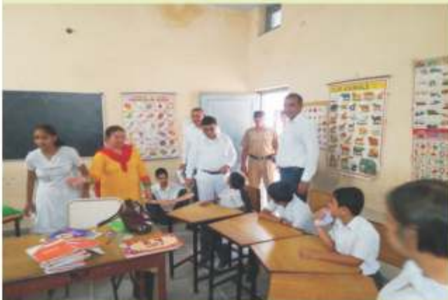
Aanchal Vikas Mansik Kendra, Hissar