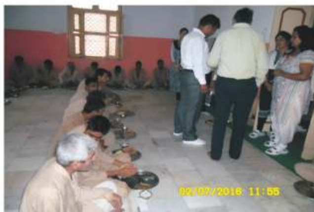
Old Age Home and Shelter Home for Mentally and Physically challenged persons, Rohtak