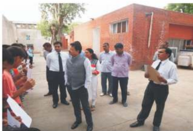
Old Age Home/Observation Home, Faridabad

Children and senior citizens are vulnerable. Children are voiceless and defenseless. Nurturing children in an environment free from exploitation and fear is very important. Children in Children Homes, Shelter Homes and Observation Homes form the most vulnerable section. Similarly, Senior Citizens, living in the Old Age Homes, also form the vulnerable section who apart from legal protection also require the motivation to live happily and fearlessly. To ensure proper legal