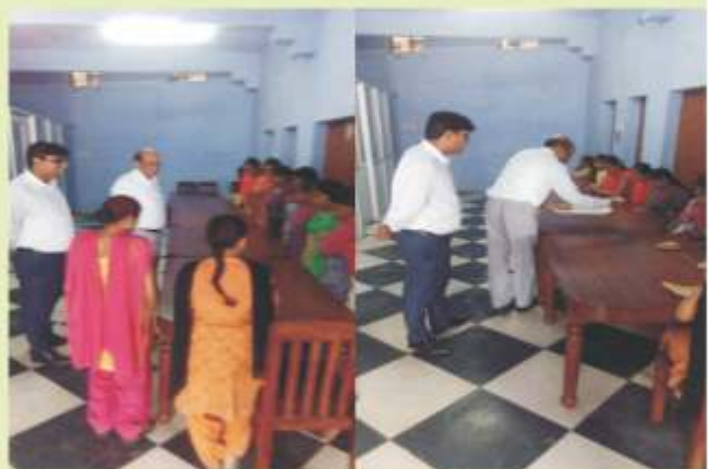
Shelter Home, Narnaul