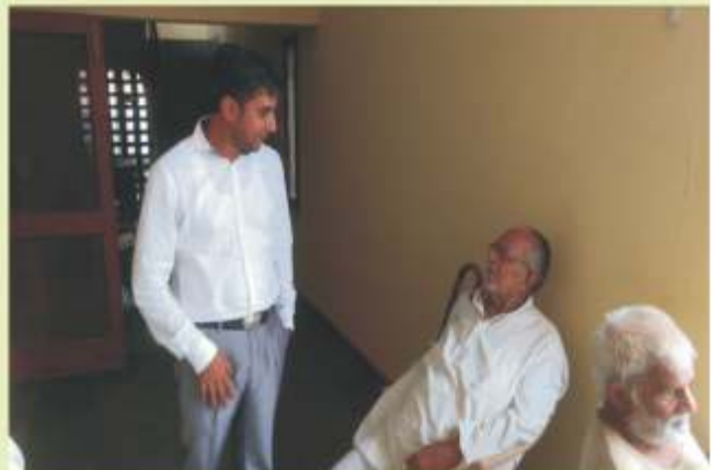
Children Home & Old Age Home, Rewari