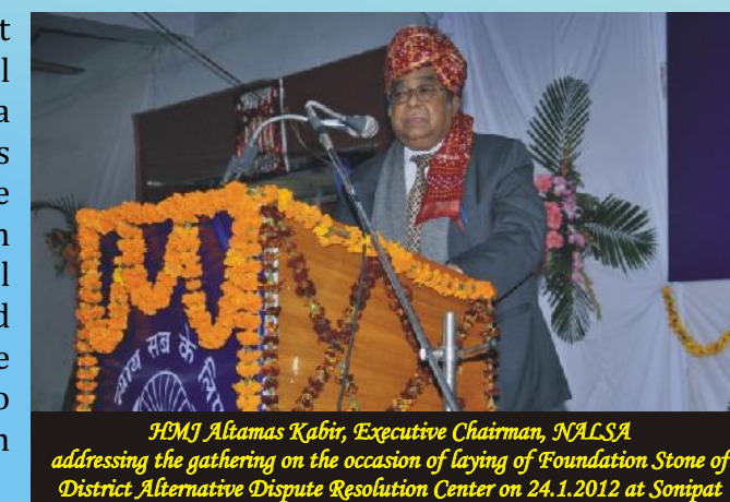
HJM Altamas Kabir, Executive Chairman, NALSA addressing the gathering on the occasion of laying of Foundation Stone of District Alternative Dispute Resolution Center on 24.1.2012 at Sonipat

the disputes can be resolved by any of the ADR processes like arbitration, conciliation, Lok Adalat or mediation. His lordship told that Haryana will soon get its first District Alternative Dispute Resolution Centre, which will help to provide quick settlements out of court, which are informal in nature. His lordship also told at length about the concept of 'Legal Aid Clinics' and the scheme of Para Legal Volunteers. He said that "As Primary Health Centres have proved beneficial to the health sector, the District ADR Centre will play an important role in legal aid and legal service sector". These centres will provide the option to parties to settle their matters in satisfactory manner.