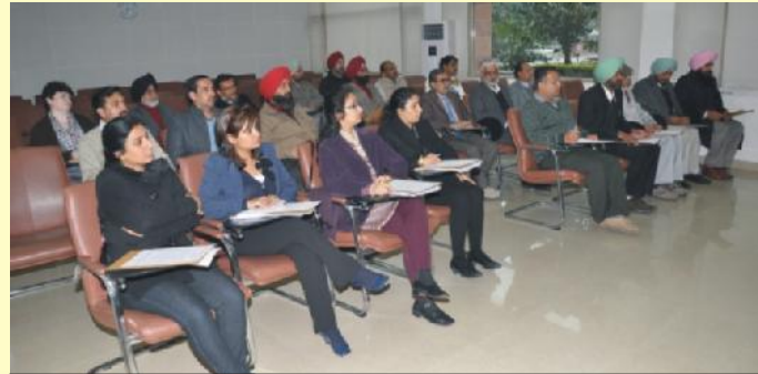
Advocates participating in Mediation Training Programme