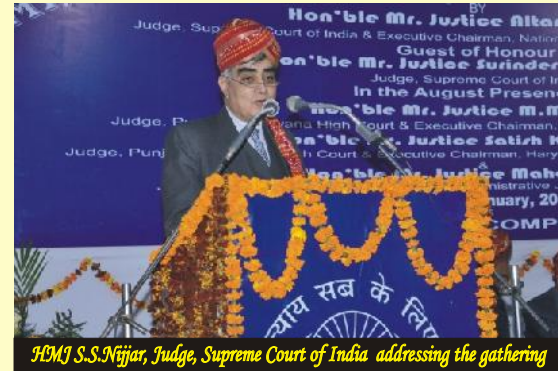
Hon'ble S.S.Nijjar, Judge, Supreme Court of India addressing the gathering

because foundation stone of first ADR Centers had been laid by Hon'ble Mr. Justice Altamas Kabir in district Sonipat.