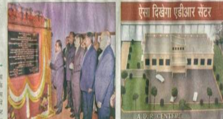
रोहताख में आठ हजार वर्ग फुट में तैयार हो रहे हैं न्यायालय के न्यायाधीशों के न्यायिक सहायता केन्द्र की आधारशिला।

आठ हजार वर्ग फुट में बनकर तैयार होगा एडीआर सेंटर, कानूनी सहायता मिलने में होगी आसानी हरदोम नगर, रोहताख