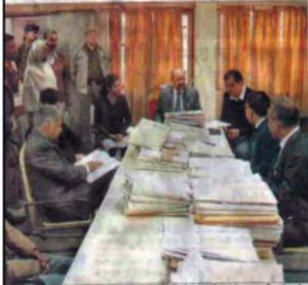
राष्ट्रीय लोक अदालत में 463 मामलों का निपटारा करके 51 लाख से अधिक राशि अर्वाइ और जुर्माना के तौर पर वसूली गई

कुल 1635 मामलों में से 424 मामलों का निपटारा करके 51 लाख से अधिक राशि अर्वाइ और जुर्माना के तौर पर वसूली गई