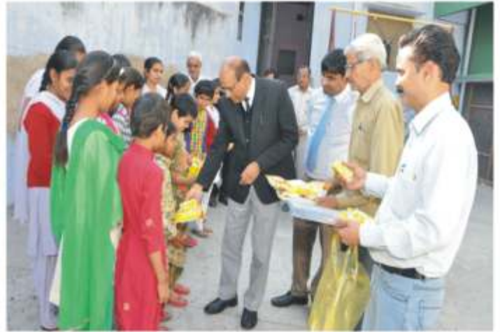
Shelter Home, Narnaul