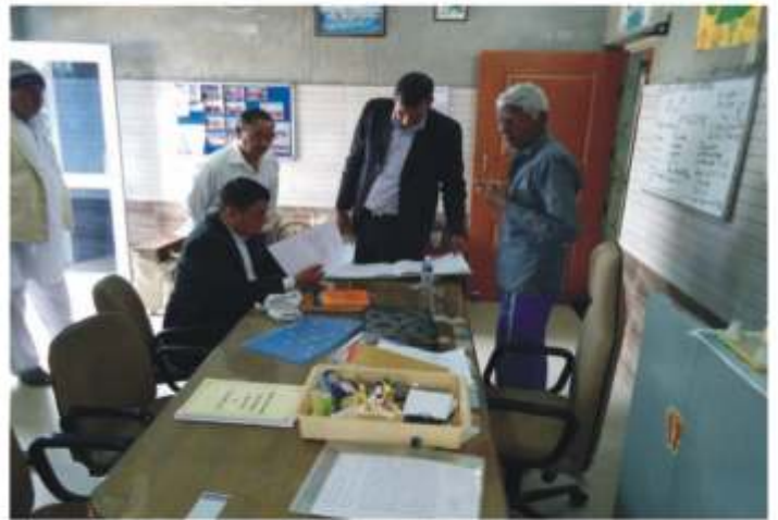
Shaishav Kunj, Hissar