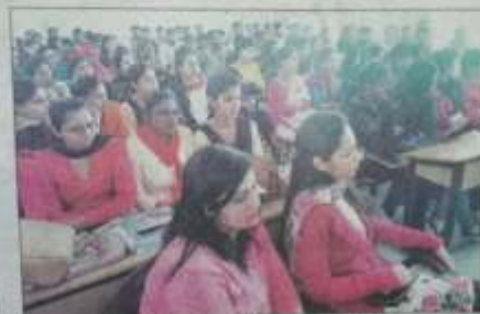
कार्यक्रम में भाग लेते कालेज के छात्र-छात्राएं।

कुरुक्षेत्र, 22 फरवरी (का.प्र.): जिला विधिक सेवा प्राधिकरण द्वारा सेंटर-5 स्थित अत्याधुनिक परचूरम कालेज के प्रांगण में बना एवं रोज