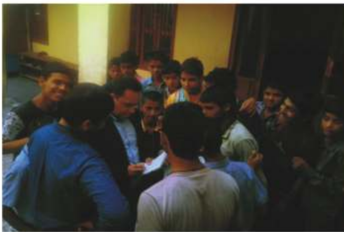
Shelter Home, Jhajjar