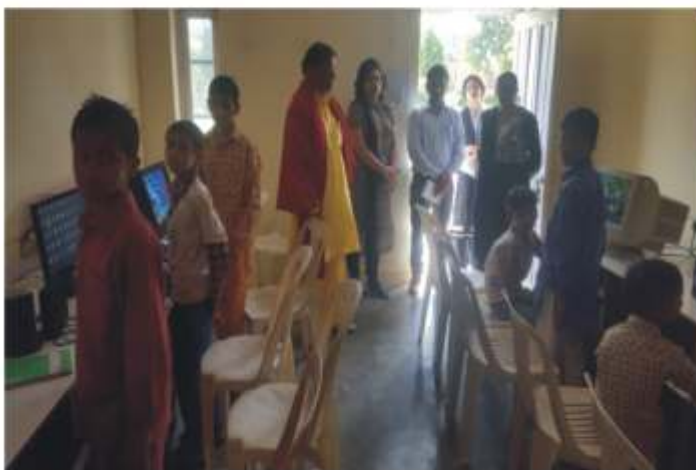
Children Home, Kurukshetra