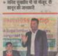
श्रमिकों को सम्बन्धी जानकारी दी।

मुख्य न्यायिक दंडाधिकारी व सचिव सुखप्रति सिंह ने कहा कि श्रमिकों को लाभ पहुंचाने के लिए सरकार द्वारा कई योजनाएं चलाई जा रही हैं। श्रमिकों को इन योजनाओं का लाभ लेना ही है और वे सुविधाएं ही जाननी हैं। मुख्य न्यायिक दंडाधिकारी ने कहा कि श्रमिकों को इन योजनाओं का लाभ लेना ही है और वे सुविधाएं ही जाननी हैं।