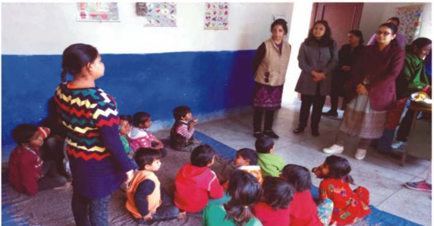
Bal Bhawan, Ambala