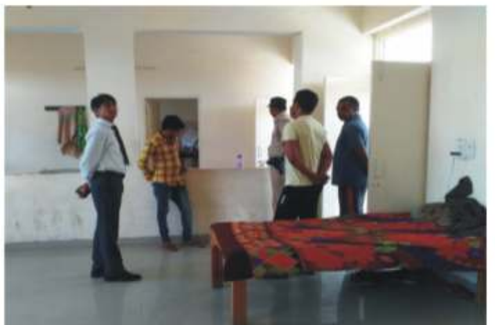
Safe Home, Mewat