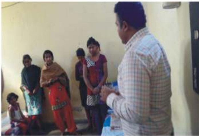
Observation and Children, Sonapat