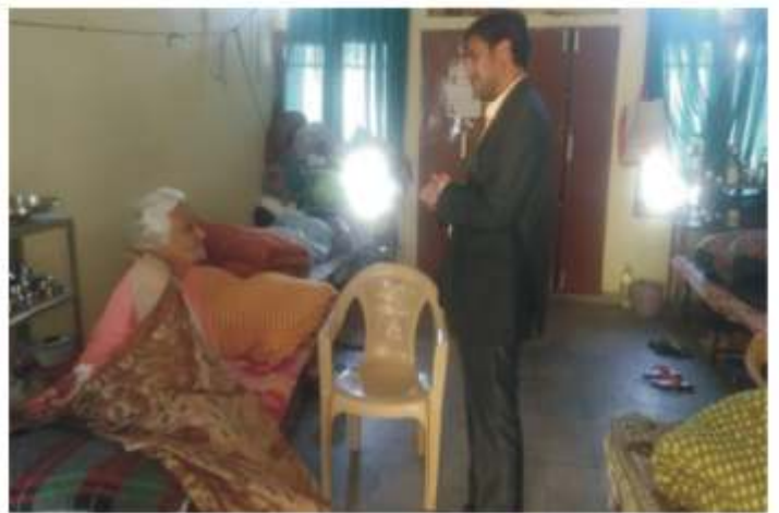
Old Age Home, Rewari