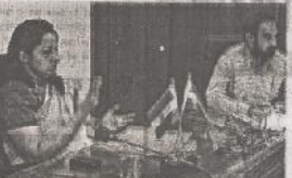
पंचकुला के रामगढ़ कस्बे में कानूनी सेवा दिवस समारोह में भाग ले रहे लोग।

पंचकुला, 9 नवम्बर (बीबीसी) - विश्व नैतिक सेवा दिवस के अवसर पर पंचकुला कस्बे में कानूनी सेवा दिवस समारोह मनाया गया। इस अवसर पर जिलाध्यक्ष, पंचकुला के अलावा अन्य अधिकारियों के अलावा भी उपस्थित हुए। उन्होंने लोगों को कानूनी सेवा के बारे में जानकारी दी। उन्होंने बताया कि कानूनी सेवा के माध्यम से लोग अपने अधिकारों को सुरक्षित रख सकते हैं।