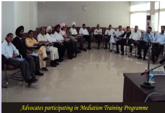
Advocates participating in Mediation Training Programme

His Lordship pointed out that a conciliator or mediator should not only have the capacity to marshal and analyze the facts giving rise to the conflict, he must have a fair knowledge of the current laws, rules and regulations that may have bearing on the case brought before him. Though, as we all know, mediation is a non-binding negotiation process and the role of the mediator is to assist the parties in the referred case to resolve dispute but knowledge of