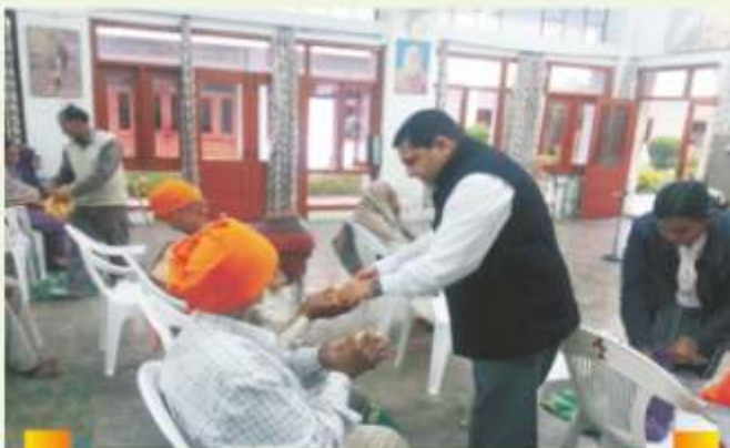
Old Age Home, Karnal

protection to this vulnerable section, the Chairmen cum District and Sessions Judges alongwith Chief Judicial Magistrates cum Secretaries have been making visits regularly every month to Children Homes, Shelter Homes, Observation Homes and Old age homes across the State of Haryana under the instructions and guidance of the Haryana Legal Services Authority. Deficiencies are taken up with the concerned authorities. Legal aid is also provided in appropriate cases.