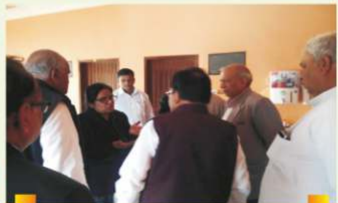
Old Age Home, Kaithal