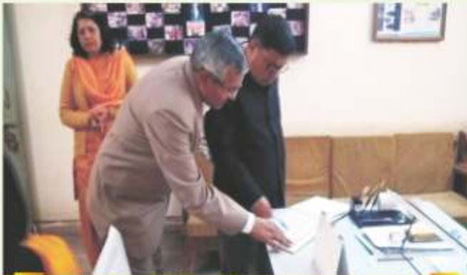
Anchal Mansik Vikash Kendra and School for visually Handicapped Children, Hissar