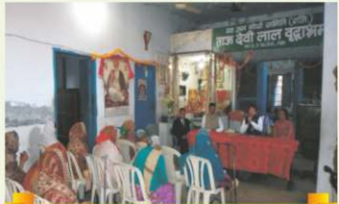
Old Age Home, Faridabad