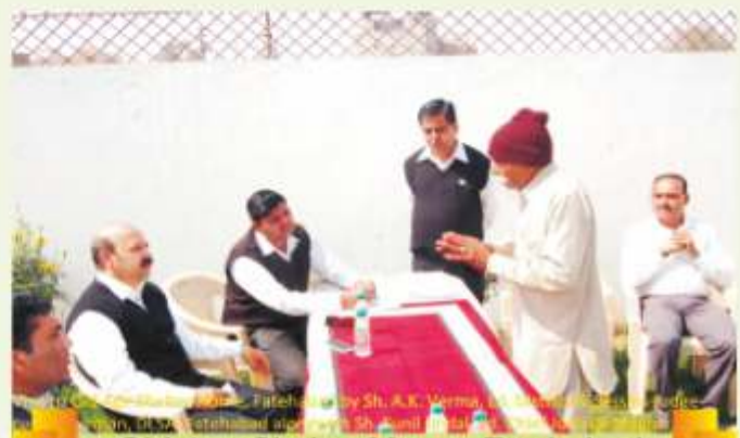
Old Age Shelter Home, Fatehabad