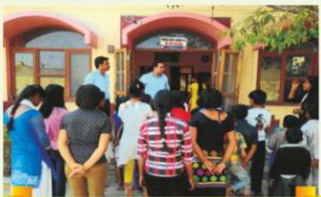
Shelter Home, Jhajjar